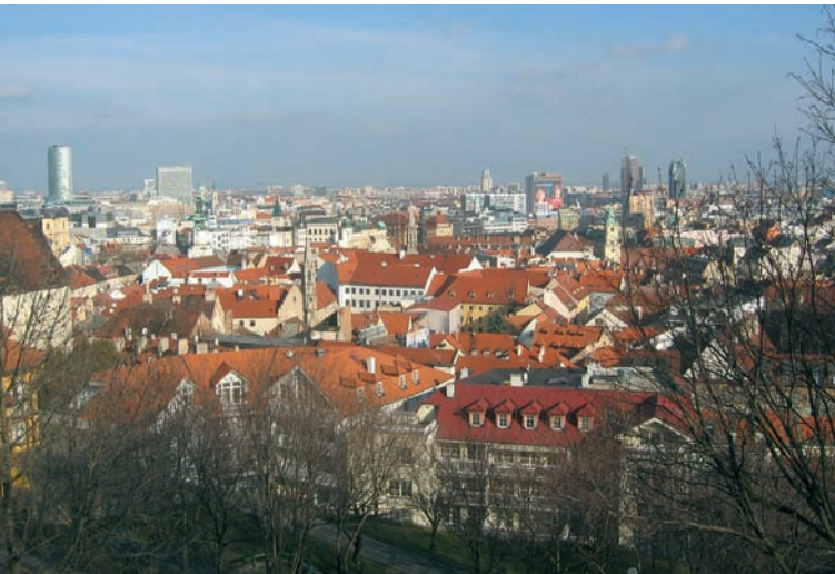
Panorama of Bratislava's eastern territory