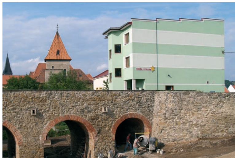
Bardejov, house in Rhody Street 14

The first place is within a World Heritage site: the Bardejov Town Conservation Reserve. Originally a one-storey building, during the registration process the house was evaluated as a contributing element of the World Heritage site and was identified for retention. Only its maintenance was allowed. In spite of opposition from the Slovak Monument Office and the lack of building permission, an investor restored the ground floor three years ago and later added two floors. This illegal construction is situated near the castle moat and the arch bridge which are close to the southern gate and damages the authenticity of the fortified castle and of the town silhouette with its dominant landmark, the St. Giles Church, as viewed from the south? These building activities are incompatible both with the legislation and the conditions of protection of World Heritage sites. Other institutions as well drew attention to this incident, but without any positive result so far.