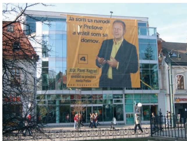
Prešov, house in Hlavna Street 107B and 109

There are other equally negative examples of illegal building and/or restoration activities. In our country there is no institution that conducts building inspections. Sometimes illegal houses can also be legalised subsequently. An owner can obtain a building approval belatedly either by “an amendment to the project documentation before the end of building works” or by the “subsequent legalisation of a building”. Fines today are rather low so that they can be allowed for in the project budget. Unfortunately, the demolition of such buildings after they have been completed is almost impossible.