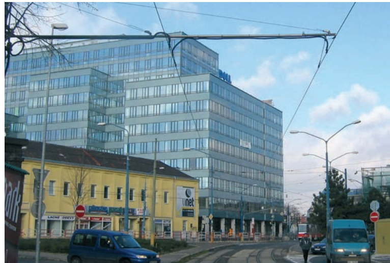
Square of St. Florian – loss of 19th-century character caused by inadequate new constructions

Inadequate modern buildings in the protected area of the central urban district