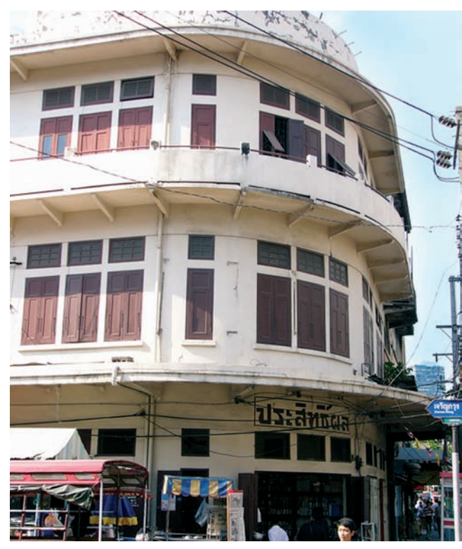
House in Wang Li community

Nevertheless, not all "at risk" buildings and communities are facing a dead-end. The Mahakan Fortress and its community are an example of a successful resolution of the issues. The Mahakan fortress is part of the remains of Bangkok's fortifications built by King Rama I (reigned 1782 – 1809). The area beside the Mahakan Fort, between the old city wall and the canal, is occupied by a community living in a group of wooden houses described as "a rare complex of vernacular architecture". After a long period of struggle, a solution has been reached by collaboration from several parties, both public and private, including wholehearted cooperation among community members, that the community will be developed into a centre for learning and exchange of knowledge on historical and cultural issues, as well as being a leisure area and tourist attraction. Thus the community, whose members also act as property