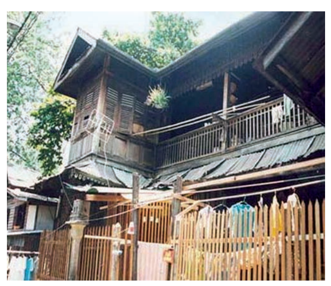
Wooden house, Mahakan Fortress community

Although news-reports on the conditions of cultural heritage and its conservation are disseminated only by small and medium-sized organizations and are of interest to only a limited number of people at present, cooperation and wide distribution of information concerning cultural heritage to the society is certain to catch a wider circle of interested groups and people in the long run. Such information will also raise awareness and recognition of values in monuments, ancient objects, buildings and communities in historic, archaeological, social and cultural terms. Conservation would then