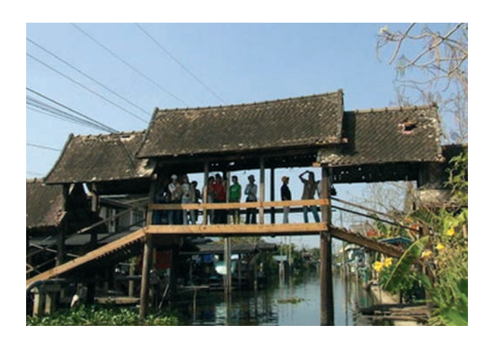
Wooden structured bridge with tiered roofs, Wat Som Kliang, Nonthaburi