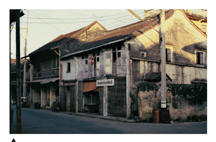
Two Chinese shop-houses with five units, Pattani