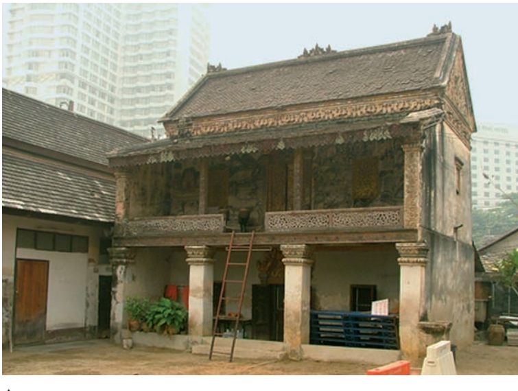
Ho Trai (Scriptures Hall), Wat Chang Khong, Chiang Mai