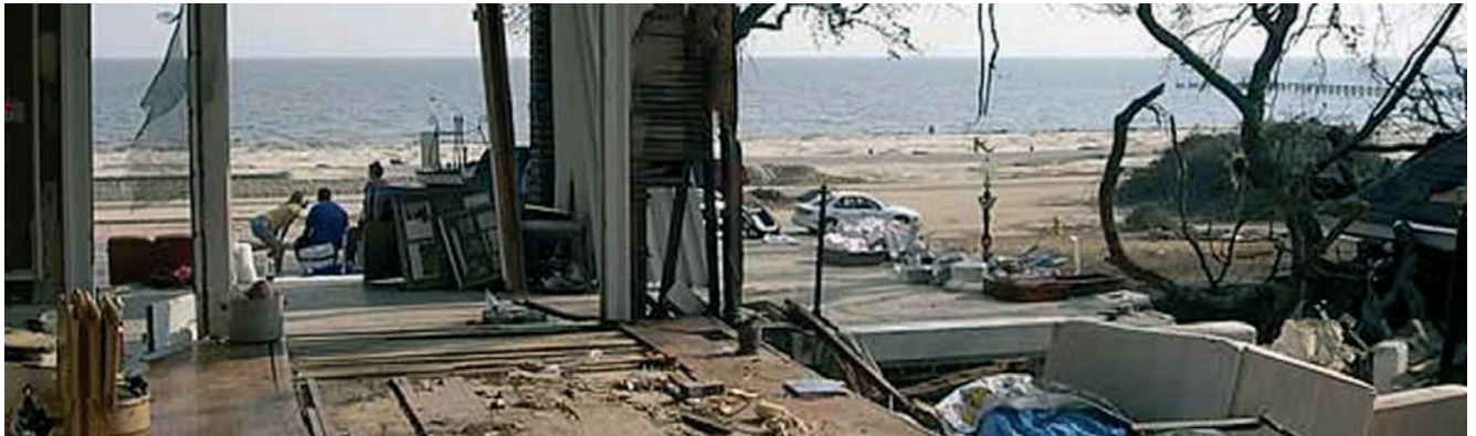
House on the Mississippi Coast, damaged by Hurricane Katrina