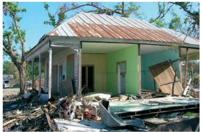
Last house on Pearl Street, Biloxi