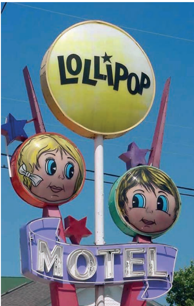
Doo Wop motel, illuminated advertising

The demand for resorts that offer modern amenities means that motels in the Doo Wop district, which encompasses the cities of Wildwood, Wildwood Crest and North Wildwood, are ripe for development. Nearly 100 Doo Wop motels have been demolished in recent years, usually for the construction of market-rate condominiums. While the architectural and historic significance of the motels has been widely recognized, local governments have not reached agreement on how—or whether—to regulate new development.