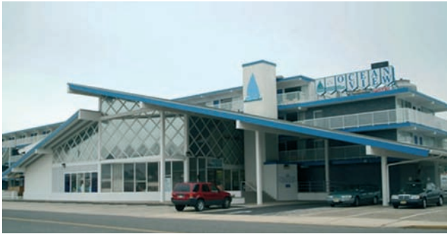
Example of a Doo Wop motel in New Jersey

funky signage and exotic architecture decked out with sawtooth angles, crazy overhangs, space-age “Jetson” ramps and lava rock siding. Considered the largest collection of mid-20 th century commercial resort architecture in the nation, the motels celebrate a number of kitschy styles, including the Polynesian-inspired “Pu Pu Platter”, the “Chinatown Revival” with its de rigueur pagoda roof, and “Phony Colonee”, a tribute to American patriotism. Besides boasting a well-loved boardwalk, the Wildwood area became known as a rock-and-roll hot spot where Bill Haley and the Comets performed “Rock Around the Clock” in public for the first time in 1954 and Dick Clark broadcast his “American Bandstand” program live in 1957.