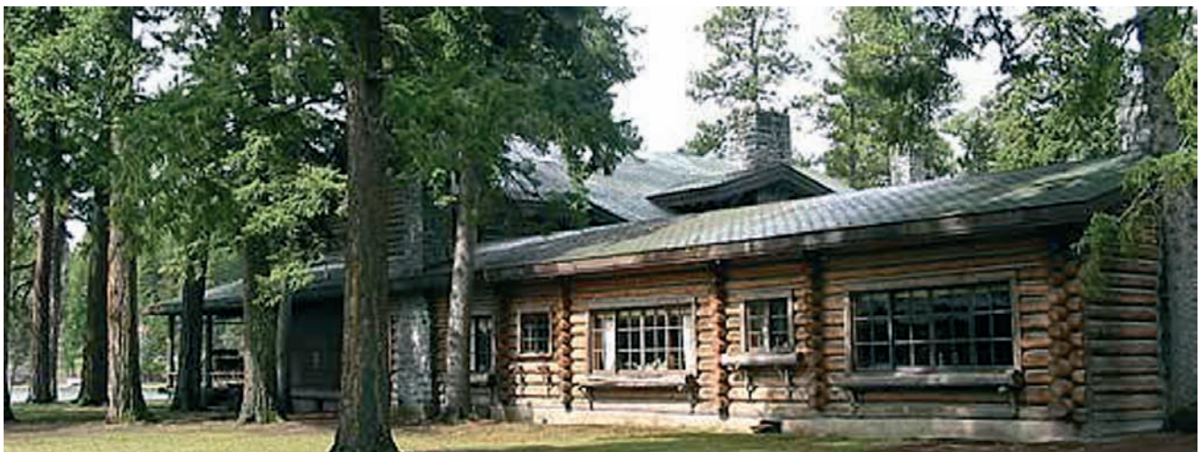
Kootenai Lodge, Bigfork, Montana

Directly following the 2003 earthquake, Mission San Miguel hired a team of architects, engineers and conservators to develop a preservation plan. The mission has already funded nearly $1 million worth of construction to stabilize parts of the church and other buildings. While progress is being made slowly, it will require collaborative work to ensure that the Mission can receive desperately needed federal and state preservation and disaster funds as well as financial contributions from foundations and the general public to ensure the Mission's continued survival.