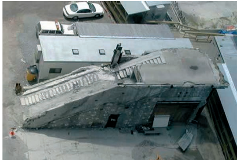
World Trade Center, New York, Vesey Street staircase

Before the September 11 attacks, the Vesey Street Staircase was seen and used by the public on a daily basis. Located near the intersection of Vesey and Church streets, it consisted of two granite-clad outdoor flights of stairs and an escalator that led from the World Trade Center plaza to Vesey Street. When terrorists crashed two planes into the Twin Towers, the staircase provided a path of escape for hundreds of people. It is the only surviving above-ground remnant of the original World Trade Center, and a vivid and haunting reminder of the September 11, 2001 terrorist attacks. The staircase