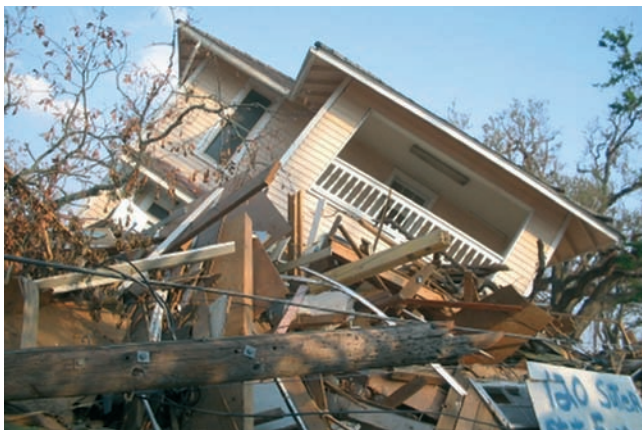
Destroyed house in Biloxi