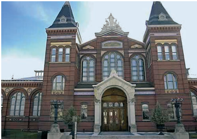
Arts & Industries Building of the Smithsonian Institution, Washington