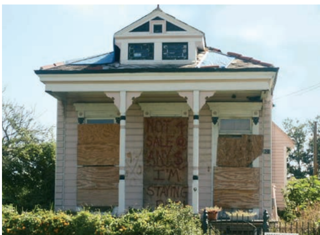
Boarded-up house in New Orleans

The challenge of recovering from an unprecedented storm has overwhelmed both public and private efforts. While owners wrestle with the complexities and uncertainties of job losses, flood insurance payouts, levee reconstruction, restoration of public services and endless delays, historic buildings continue to deteriorate. Many have also been unnecessarily "red-tagged" for demolition.