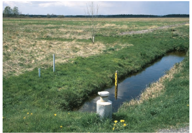
Groundwater level measuring stations monitor the groundwater tables in an area of the Federsee bog, which has undergone wetland restoration. The archaeological evidence remains preserved beneath the peat cover.