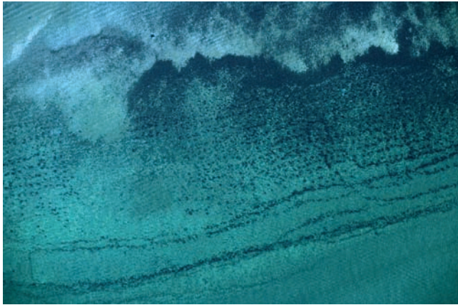
Aerial photograph of the pile dwelling site of Unteruhldingen on Lake Constance. The erosion of the shallow water zone is ongoing, palisades and ground plans of houses are constantly being exposed.