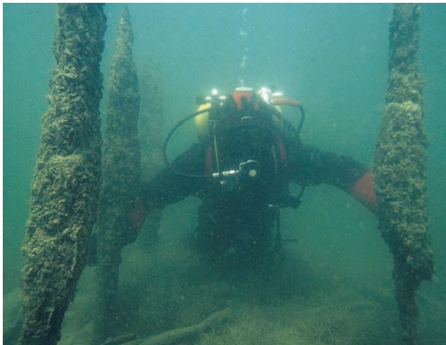
Situation of a pile dwelling site on Lake Bienne, the archaeological layer of which is in the process of disintegrating. Crabs are already burrowing into the archaeological layer – it looks like Swiss cheese. Jutting out of the lakebed are the stumps of piles from a settlement that was destroyed by a conflagration in 2704 BC.