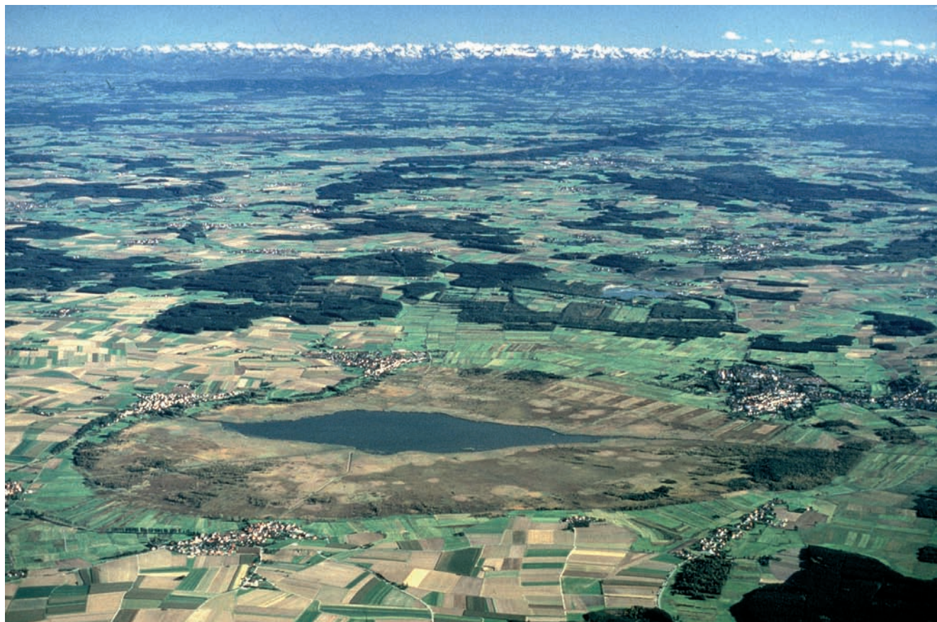
Lake Federsee (foreground), situated 60 km north of the Alps (background) in the state of Baden-Württemberg, is a classic example of a dried up lake in the foothills of the Alps with a rich body of preserved settlements, plank ways and dugouts dating from the Stone Age to the Metal Ages. Nature conservation and heritage protection work hand in hand to create reserves and to raise groundwater levels.