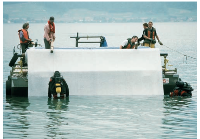
Erosion protection measures at Lake Biene, Switzerland (2003-2004). 'ROBOR' catamaran in action with geotextile mats. 6,000 m2 of the settlement site in the bay of Sutz-Lattrigen have been covered over and 30,000 m2 have been excavated archaeologically.

Artefacts made of organic materials survived thousands of years in the wetland settlements throughout the foothills of the Alps in exceptional states of preservation. Textiles, wooden vessels, a comb and a knife dating from the Late Stone Age found at the lakeside settlements of Vinelz and Lattrigen on Lake Biene.