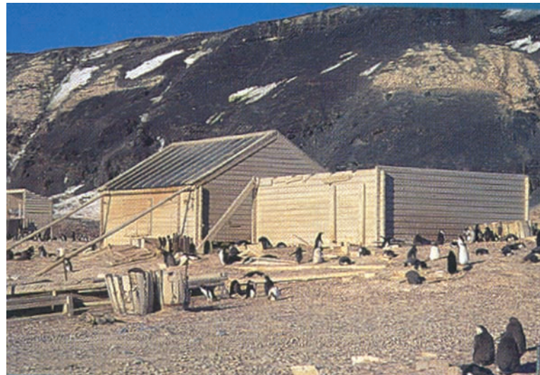
Cape Adare huts

Once transport is confirmed, the employment of appropriate conservators can proceed. Conservators of course need a range of specialist equipment and materials so further detailed planning for these is essential because, once on site, the lack of a relatively minor item can quickly turn success into failure. Once in the field there is no prospect for delivering anything that has been forgotten so such oversights can mean not only a compromised project, but perhaps more seriously, compromised safety.