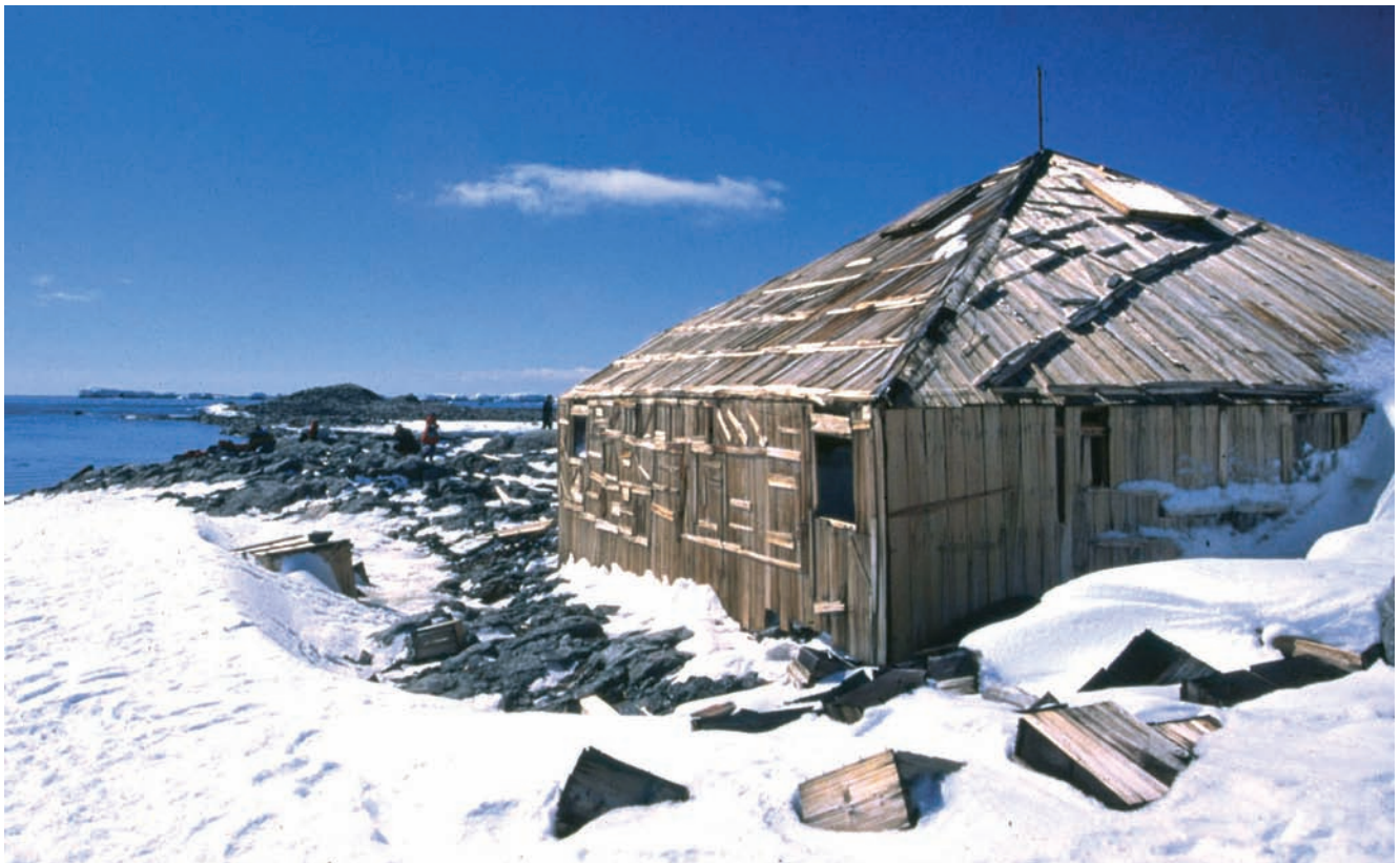
Mawson's hut