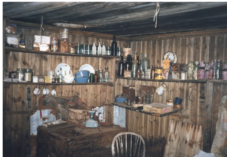
Interior artefacts