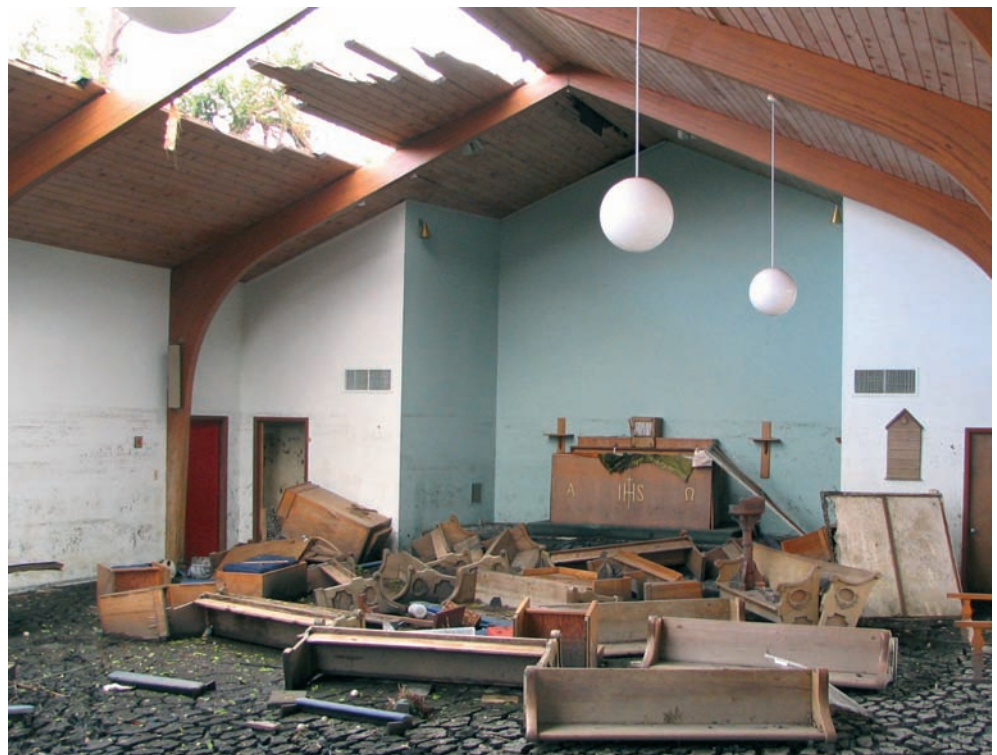
Fig. 5 Image inside of a church in the Ninth Ward after the flood had subsided. Wind damage can be seen on the roof and sediment from the flood has "raised" the level of the ground by about 3 cm.