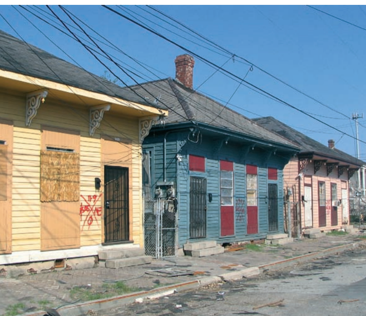
Fig. 1 One month after Hurricane Katrina the Tremé Historic District was still deserted. Water marks show that the flooding was approximately 30 cm above the first floor. Though devastated the decayed charm of the neighborhood and its vernacular Caribbean character is still easily discernible.

In unveiling its 2008 World Monuments Watch List of the world's 100 most endangered heritage sites (which includes New Orleans) the World Monuments Fund states that "human activity has become the greatest threat to our cultural heritage." Human activity has been understood in the heritage community as the wear and tear our presence takes in the form of construction, traffic, our wastes, etc. - on our built heritage. But if human activity melts the polar ice caps thus raising the sea level and warms the oceans making hurricanes stronger and more frequent, then the two are linked. But to frame the discussion of Hurricane Katrina and New Orleans only in the context of climate change oversimplifies the story. This discussion must also include why we choose to live where we do and how we try to shape our environment.