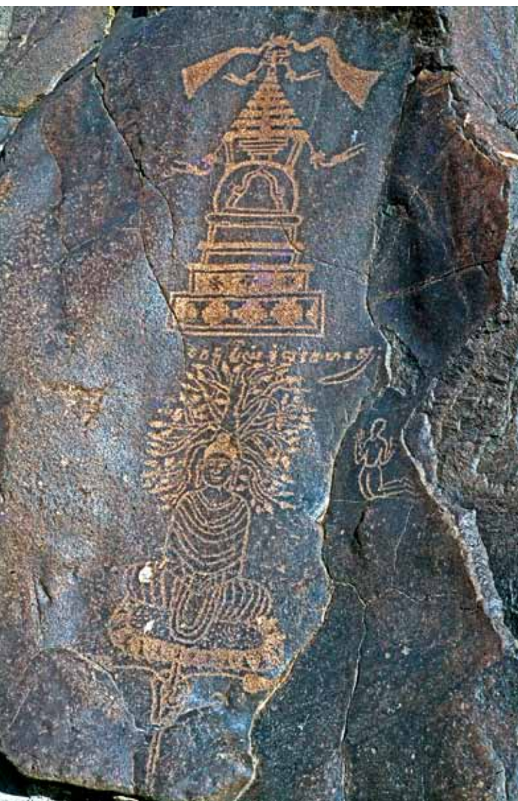
Thalpan, Buddha under the "Tree of Enlightenment" (6th-8th cent. AD)

ures engraved on rocks above the Indus with some examples also in Ladakh. Together with masks they reveal a shamanistic background, having parallels in Central Asia in the 3rd millennium BC. The new life-style of a chiefdom of cattle and sheep herders and husbandmen seems to have been introduced since the beginning of the 2nd millennium BC as rendered by drawings of chariots and humped cattle. The 1st millennium BC since its onset is marked by the intrusion of a new wave of northern nomads, the Skytho-Saka. Their images of ibex, deer, predators and animal hunting scenes are chiselled in the distinct Eurasian animal style paralleled in the Scythian art of Central Asian and Siberian kurgans. With the expansion of the Persian-Achaemenid Empire during the 6th century BC under the great king Dareios I Iranian influence is reflected by perfectly executed petroglyphs depicting warriors, stylised horses and fabulous creatures. With the rise of the Kushan Empire (1st-3rd centuries AD) Buddhism as the new belief system was introduced into the Upper Indus valley, which entered now the light of history. Images of stūpas worshipped by pilgrims in Scythian dress, scenes with enthroned rulers, and in particular, the first inscriptions