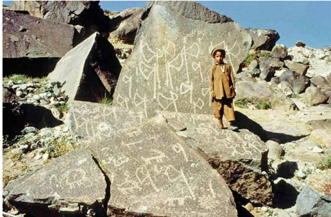
Chilas, post-Buddhist axe symbols (9th-11th cent. AD)