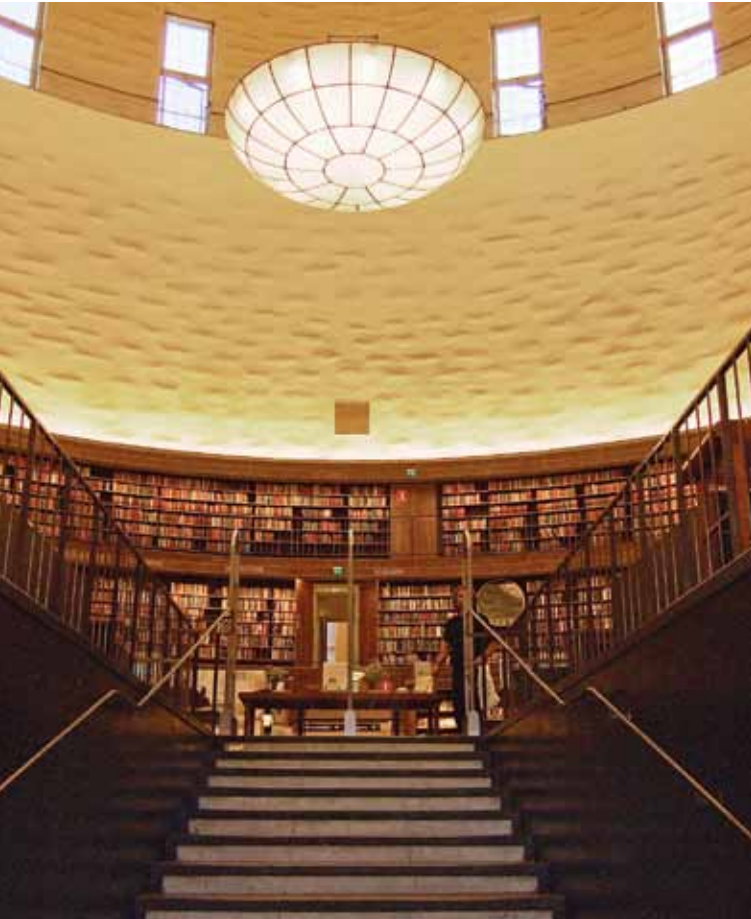
The library's central book hall