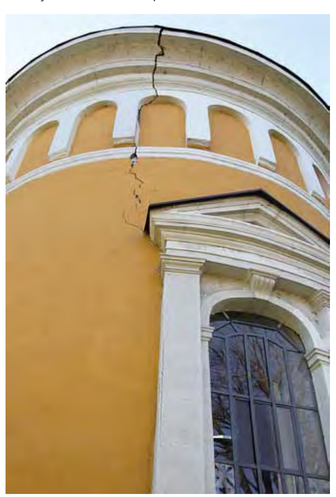
St. Michael's Church, cracks on the tower