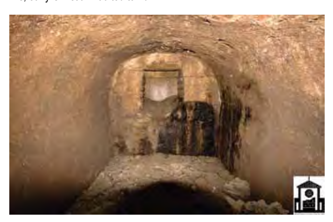
Niš, inside a vaulted tomb

Golden earrings found in one of the tombs