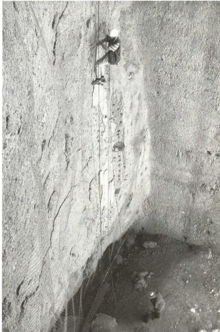
Provisional fixing of plaster fragments on the back wall of the niche of the Small Buddha, carried out by restorer E. Praxenthaler