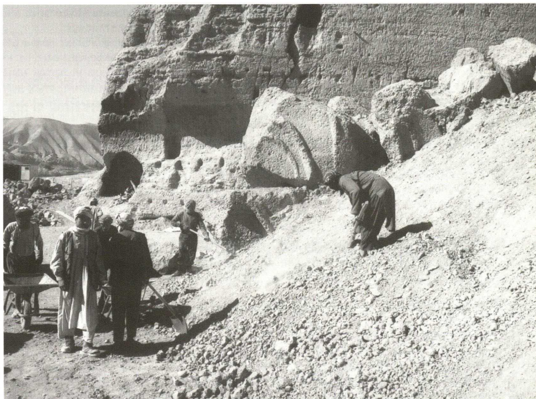
Salvaging fragments of the Great Buddha