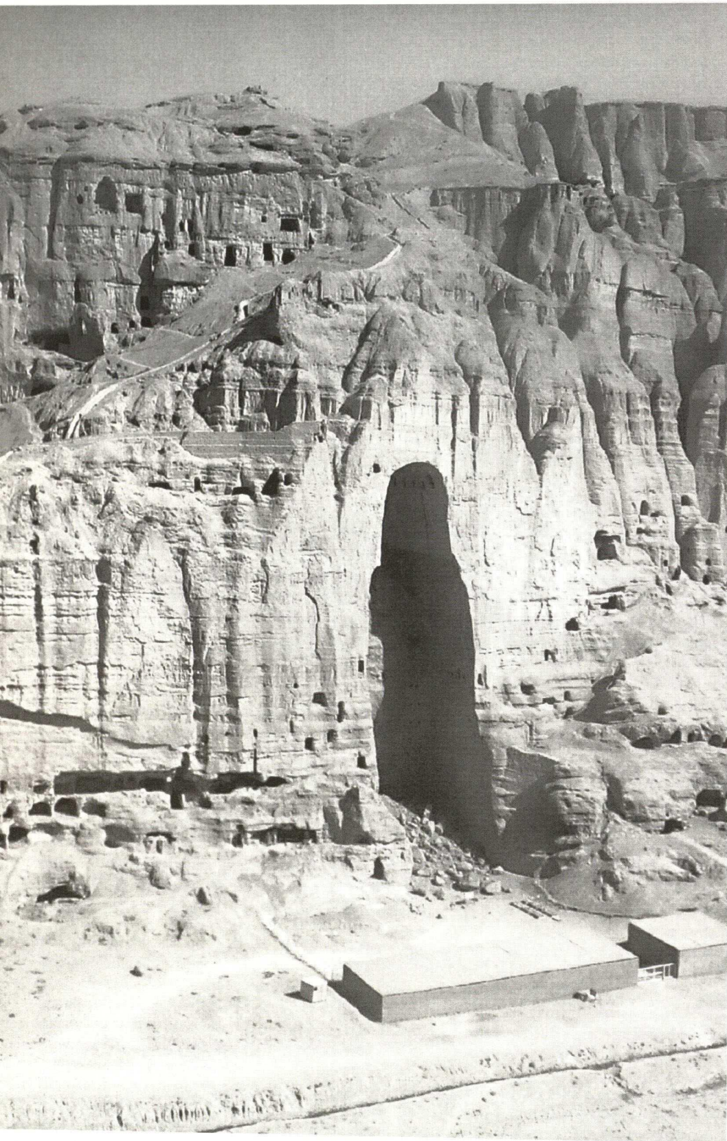
Niche of the Great Buddha, in the foreground the new shelters for storing the fragments