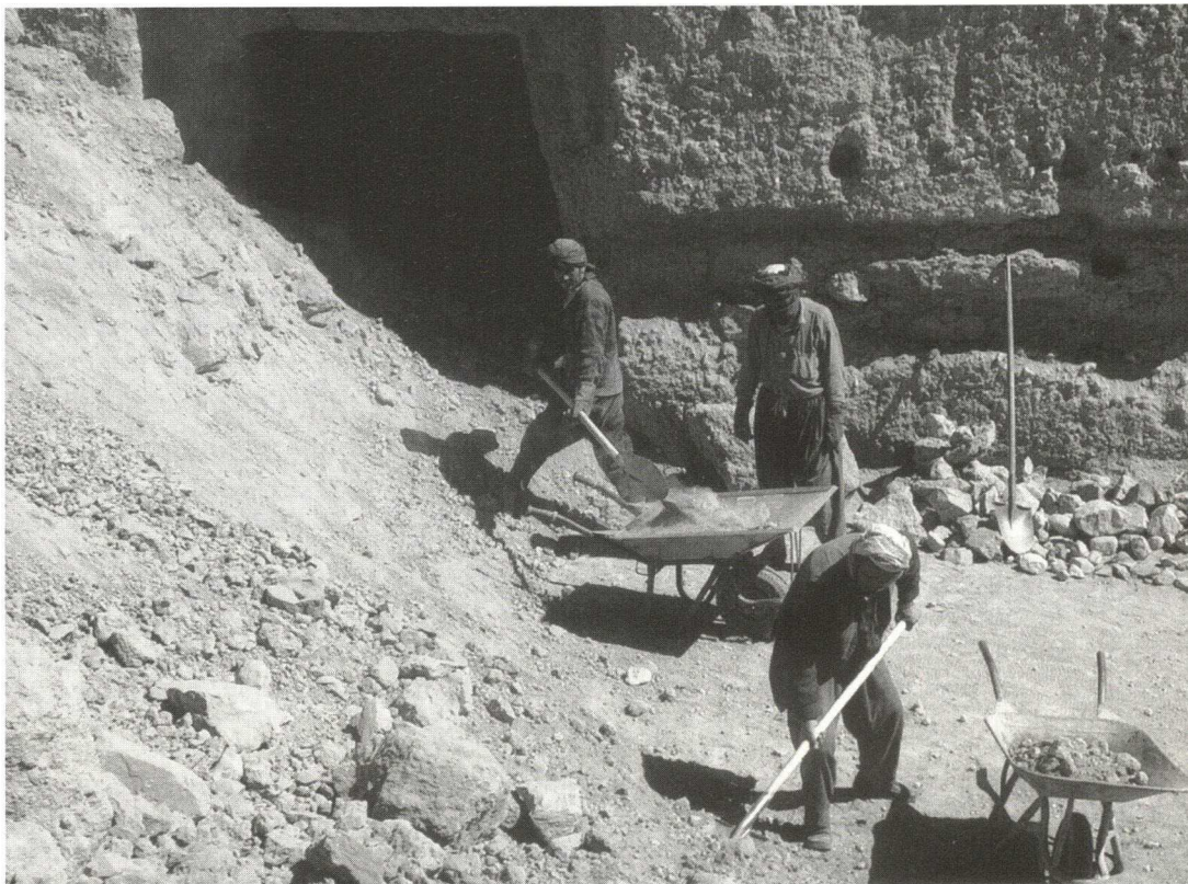
Salvaging fragments of the Great Buddha