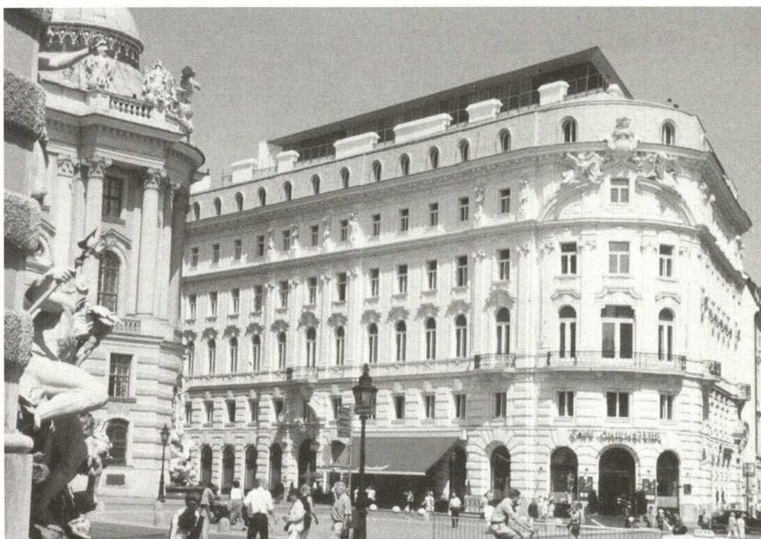
Vienna, Michaelerplatz, Palais Herberstein (2002)