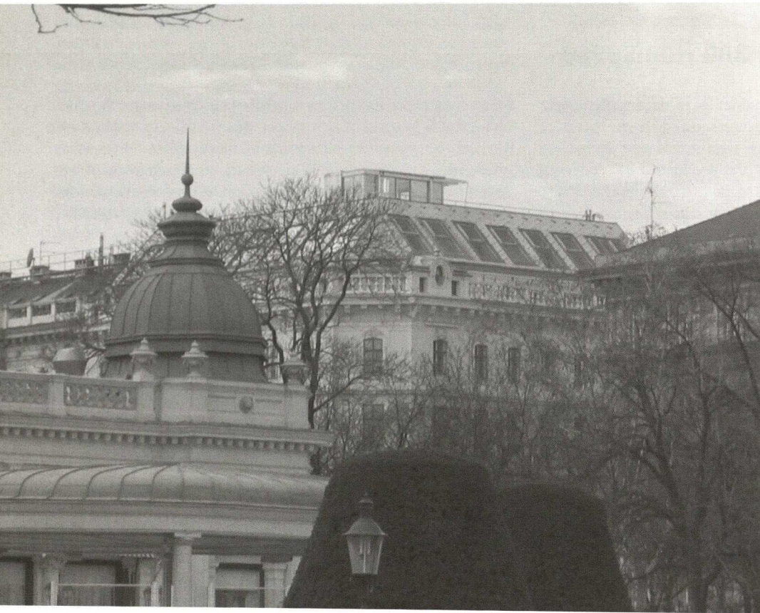
Vienna, Inner City