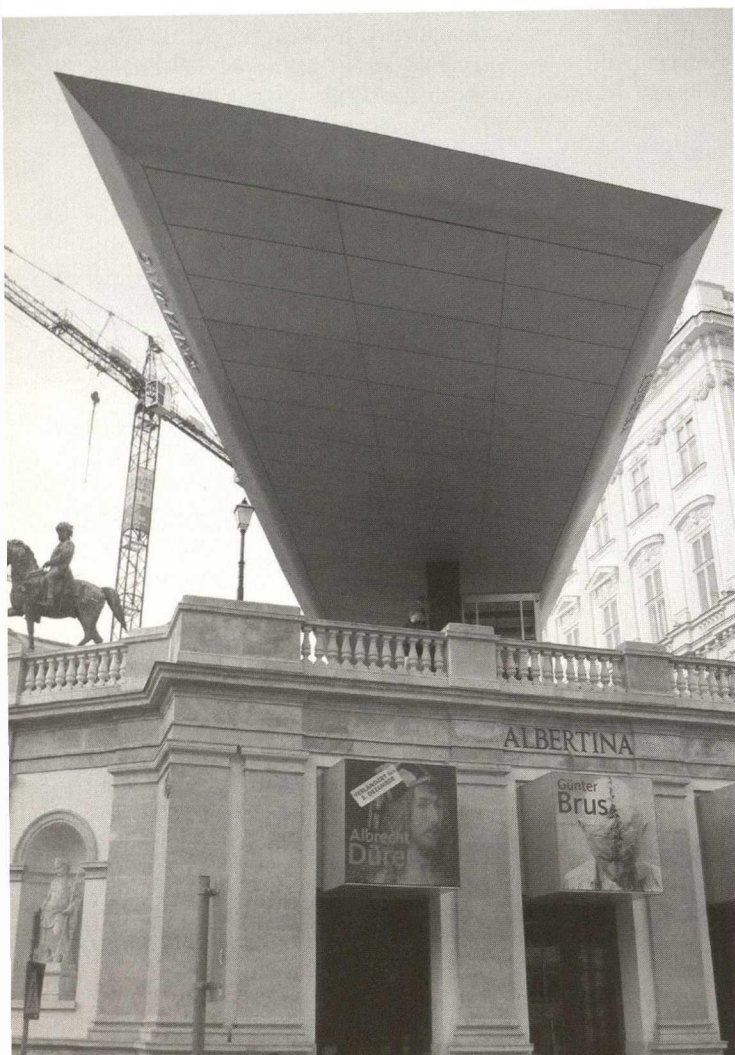
Vienna, Albertina, Museum of Graphic Arts. Fifty metre long overhanging roof, designed by the Austrian architect Hans Hollein, a symbol for the "roof-mania" in Vienna.