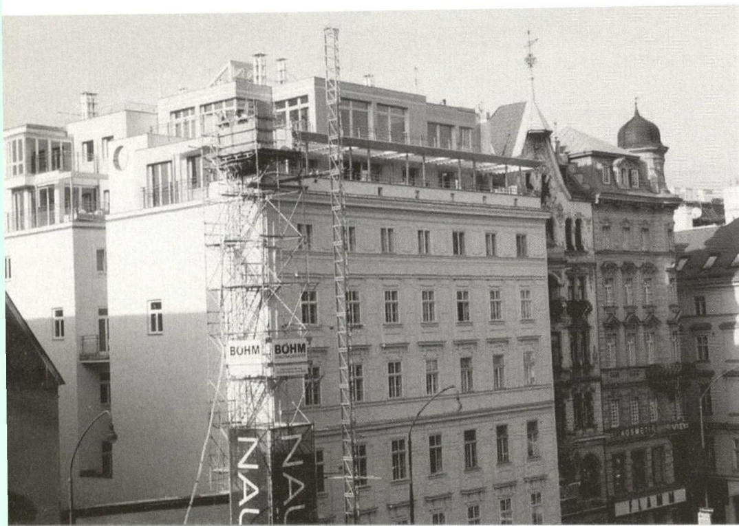
Vienna, Neuer Markt