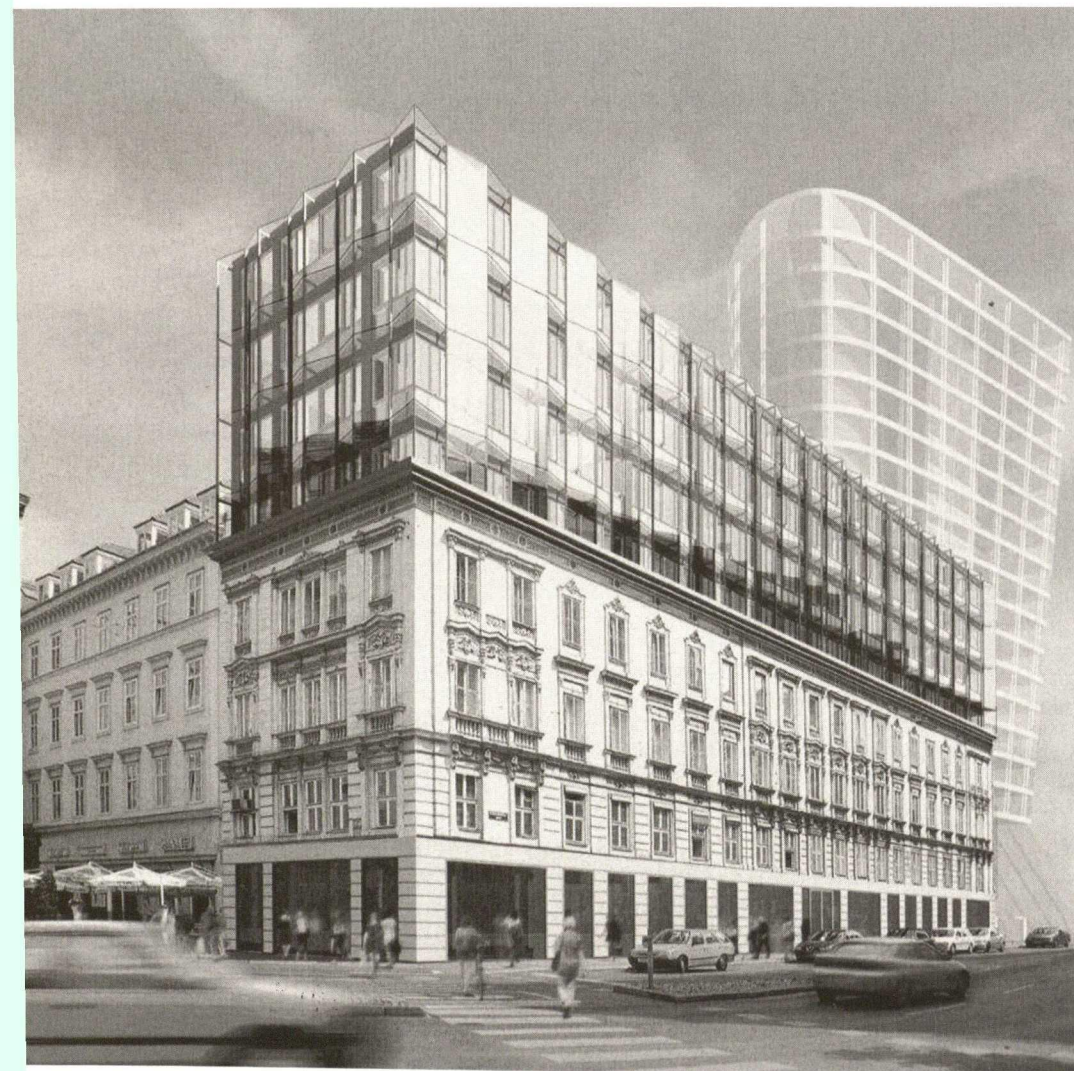
Vienna, Praterstrasse, Project