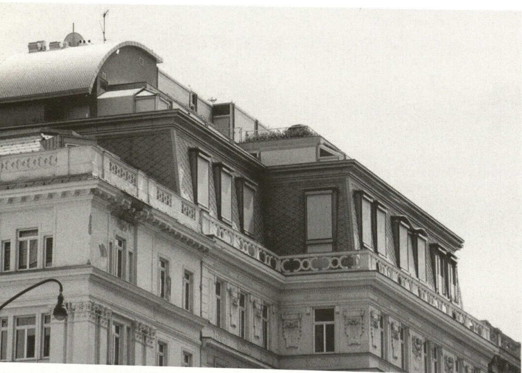
Vienna, Neuer Markt, Hotel Ambassador (2001-2002)