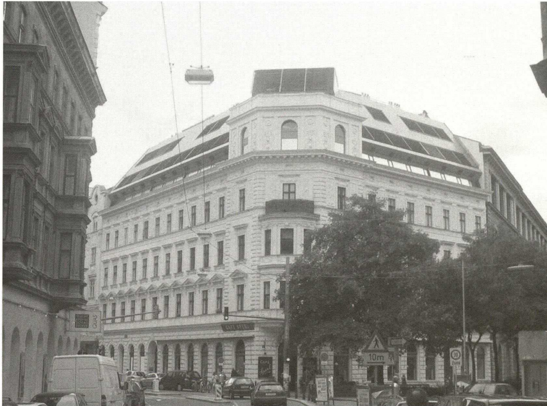
Vienna, Gumpendorfer Strasse (2002)

nology, materials and design is obvious. In this context it seems ironic that it is not a lack of money that is a risk to architectural heritage, but rather the abundance of money. This means many investments in architectural works are against the interests of heritage preservation and conservation. One of the most noteworthy which has evolved as a field of its own is roofspace development.