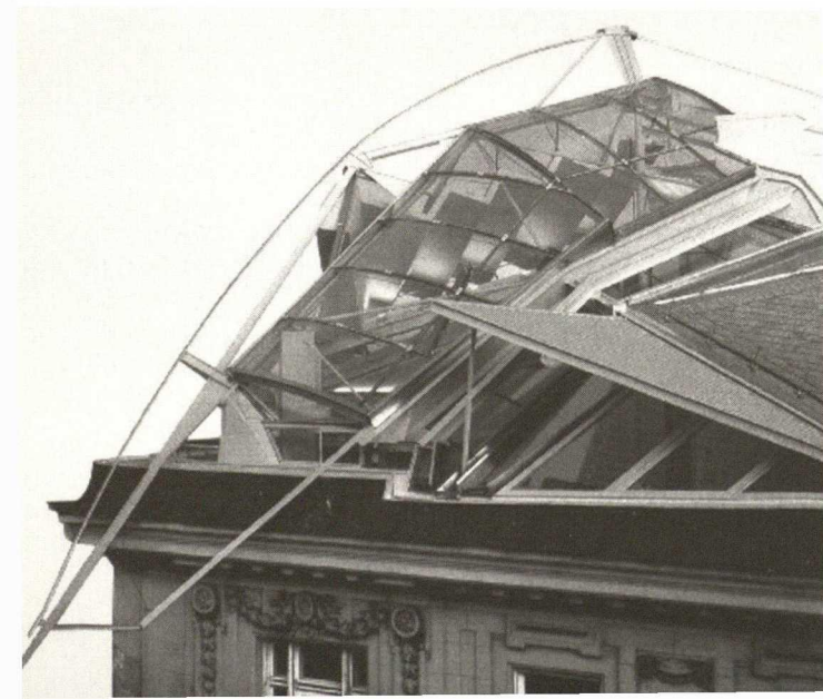
Vienna, Falkestrasse. The artificial initial of the "roof on roof" development in Vienna, erected 1984–1988 by the architects Coop-Himmelblau.