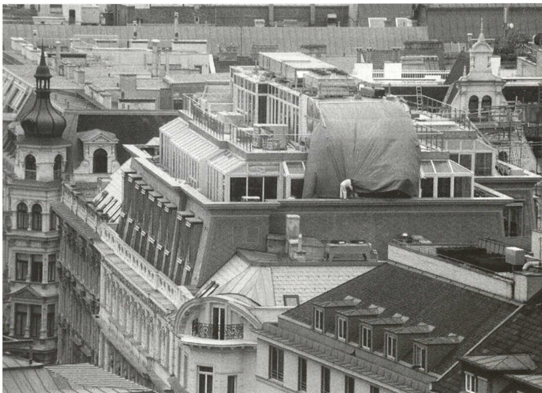
Vienna, Neuer Markt, Hotel Ambassador (2001-2002)