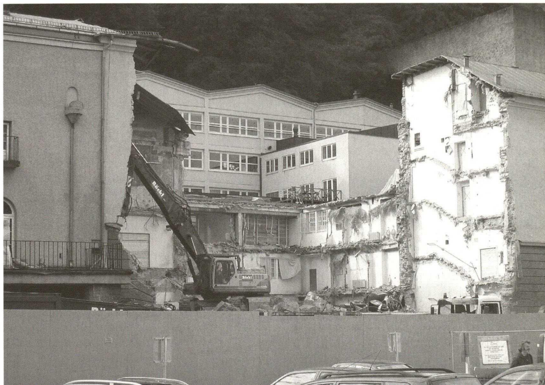
Salzburg, Neues Festspielhaus, demolition in October 2004