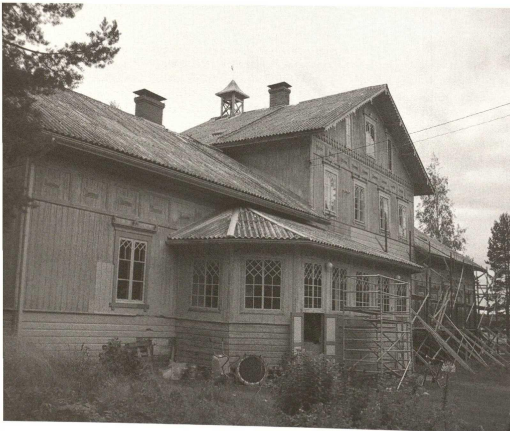
The West Façade of Isotalo ('Big House') at Tunkelo village. It is one of the biggest Finnish rural main buildings in central Finland

Problems with wooden buildings normally begin with leaking roofs – and taps. The basements tend to move due to frozen ground, and old, cracking chimneys are especially dangerous. However, renovation work can also be dangerous, as the wrong