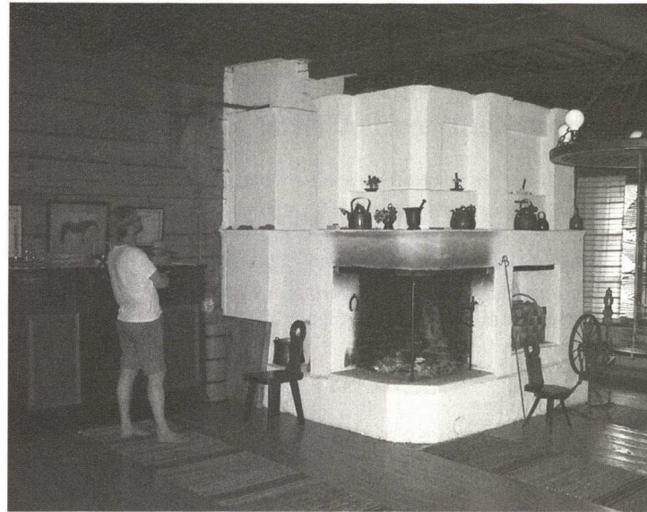
The Pirtti (Great Hall) and fireplace of Alanen farm's main building, near Isotalo