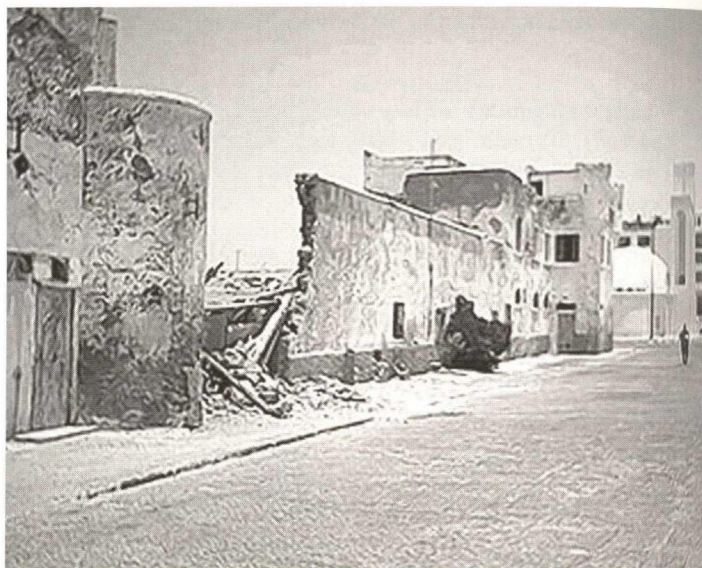
Demolition of a wall of the fort

After the printing deadline we received news that „the authorities started the last phase of the Fort destruction on 13 December 2004“ – unfortunately, this could not be verified anymore. We can only hope that this important historic building will be saved after all.