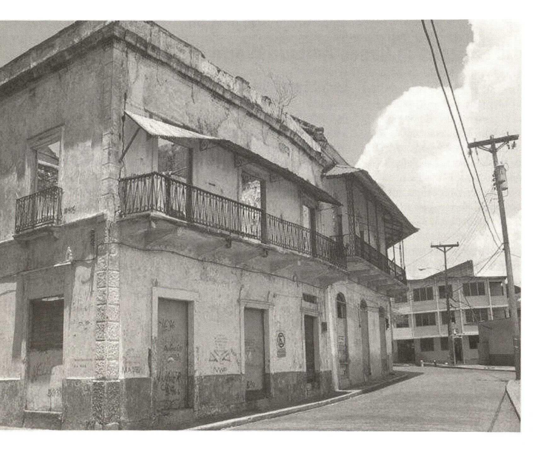
Ave. Eloy Alfaro, facade (demolished)