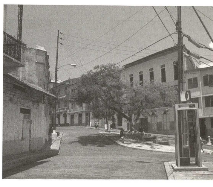
9th Street, facade (demolished)