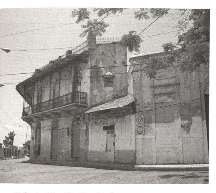
9th Street and Eloy Alfaro (demolished)