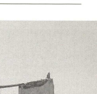
9th Street, facade (demolished)