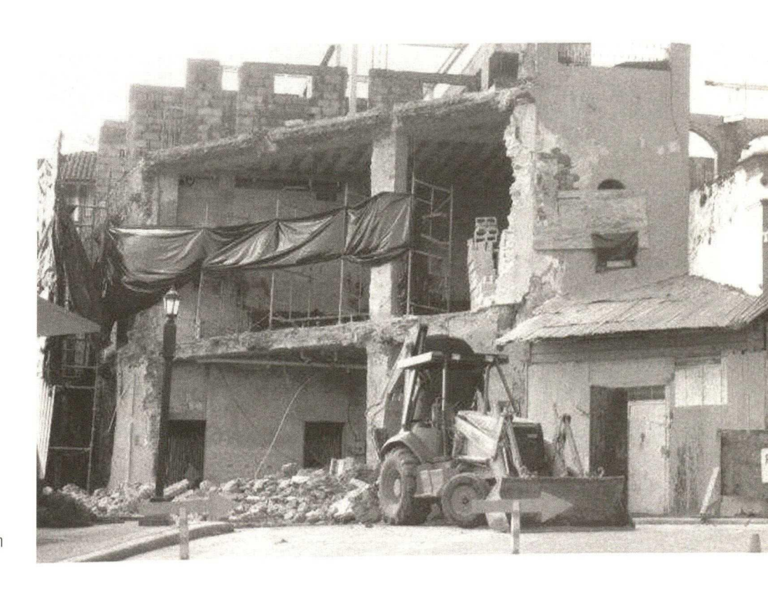
The demolished facades covered in plastic