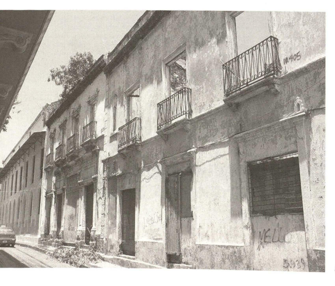
8th Street, facade (demolished)