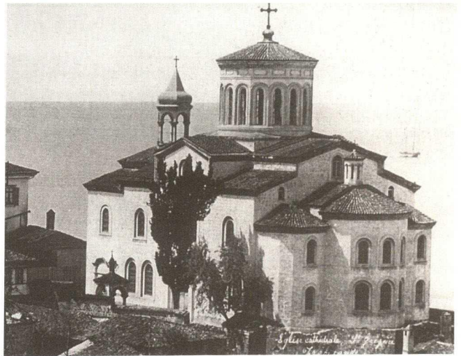
Trebizond, church 'Hagios Gregorios of Nyssa (1863), blown up in the 1930s

The problems in protecting and caring for heritage places are many and widespread. Many churches do not possess an attractive outer or inner appearance, or no longer do, because at times the building materials used were quite plain. This also leads to an inappropriate management assessment and evaluation, because a building might be ranked as not aesthetic enough to be protected at all. It is precisely this that has caused and is causing the loss of many heritage buildings in many rural areas, as well as the strong interest to readily getting cheap building materials for modern structures.