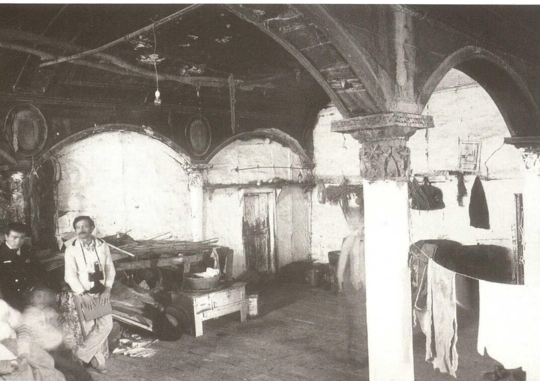
Çakıl – Michania, basilica inside, building used as a farm-house as seen in 1982