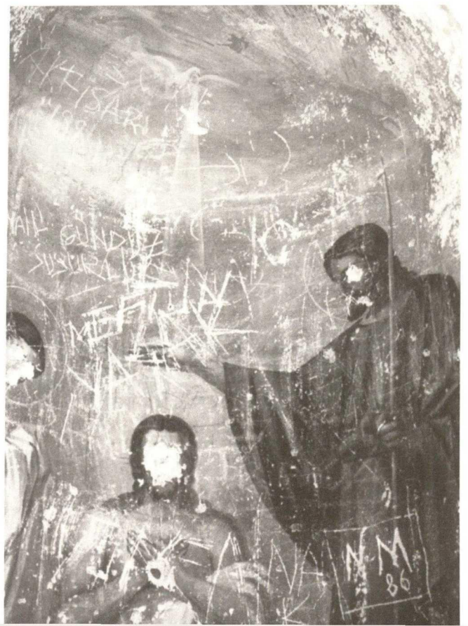
Cunda Adası, domed church, vandalised niche painting 'Baptism of Christ'