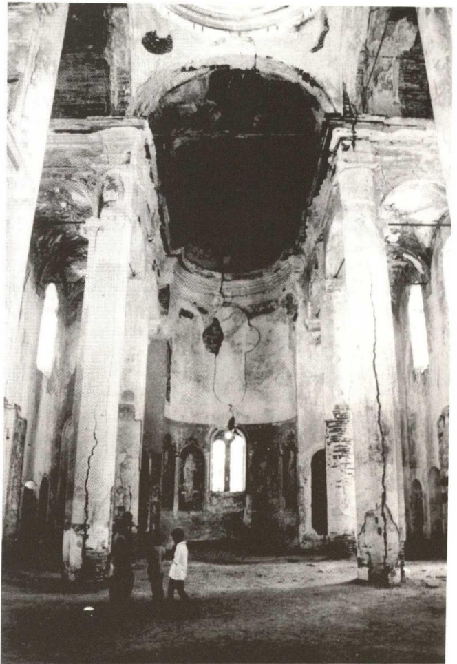
Cunda Adası, near Ayvalık, domed church, cracked brick-pillars and vaults