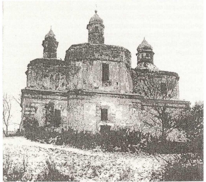
Church of the Transfiguration of the Saviour, village of Polichyntsi

The architecture of this Orthodox church is unique and represents a combination of fortifications with tripartite churches of wooden vernacular architecture. This heritage place is a very rare example of the 17 th century stone church in Ukraine with well-preserved bright vernacular features of wooden architecture combined with defensive elements.