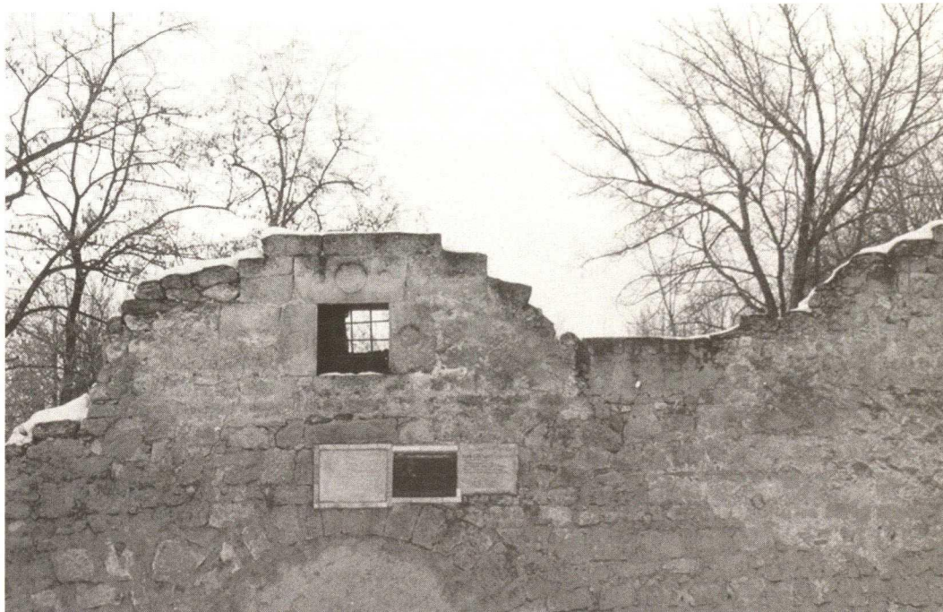
Caravanserai in Bilogorsk, Independent Republic of Crimea