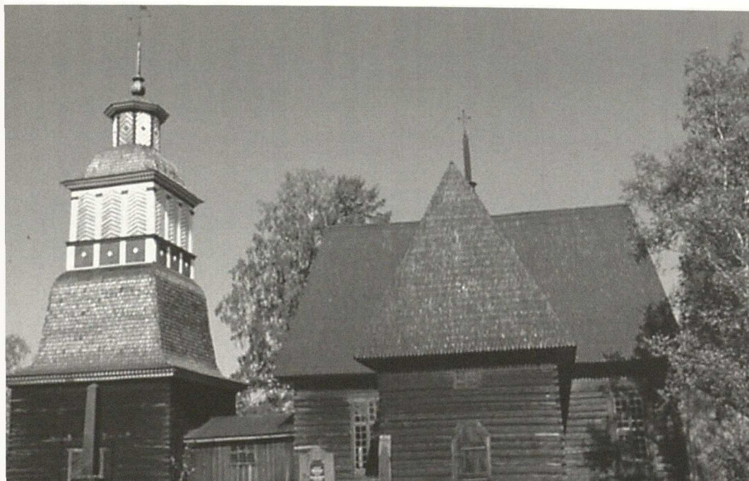
The old wooden church at Petäjavesi, built in 1763–1764