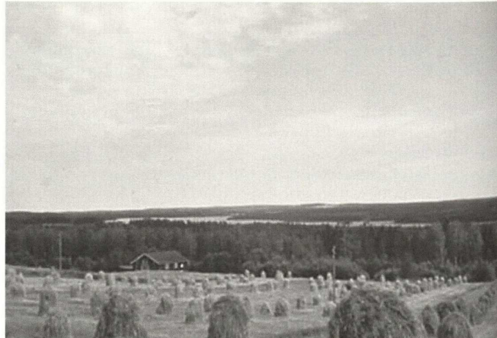
Hay poles, a vanishing scene in the Finnish countryside. Pylkönmäki, Finland