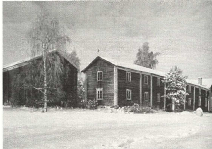
The buildings of the Pehkonen estate in Liminka form one of the sites protected by the Act on the Protection of Buildings.