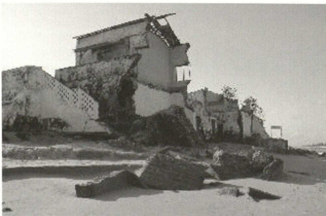
Fort Prinzenstein in Keta

Most of the materials, especially the stone used for the building of Fort Prinzenstein came from Accra. This is because the local stones around Keta were unsuitable. However, lime for the mortar was obtained on the spot by burning shells. From contemporary drawings it is known that the fort was lavishly equipped with firearms along the curtains and bastions – eight slits and three