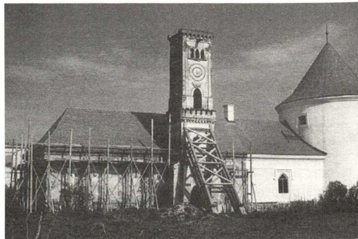
Bontida Castle after first campaign (Transilvania Trust Foundation, Cluj-Napoca)