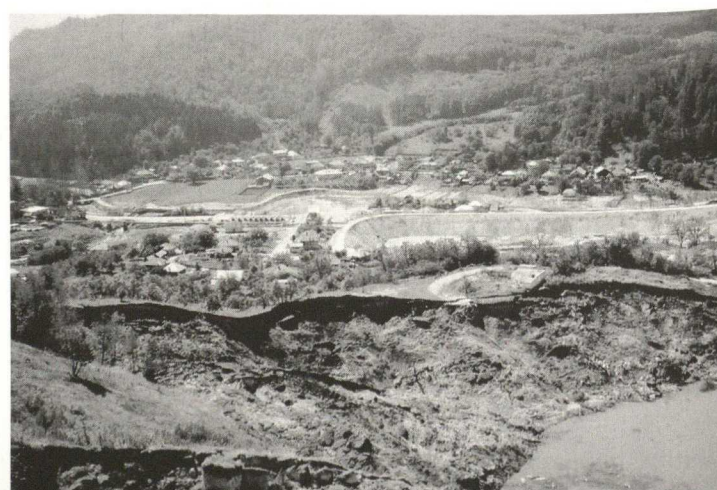
Soil erosion at Ocnele Mari