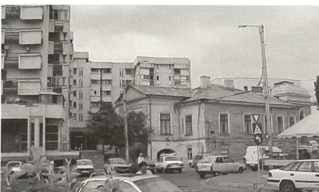
19th-century urban mansion in Iasi (arch. Ioan Sasu, Iasi)