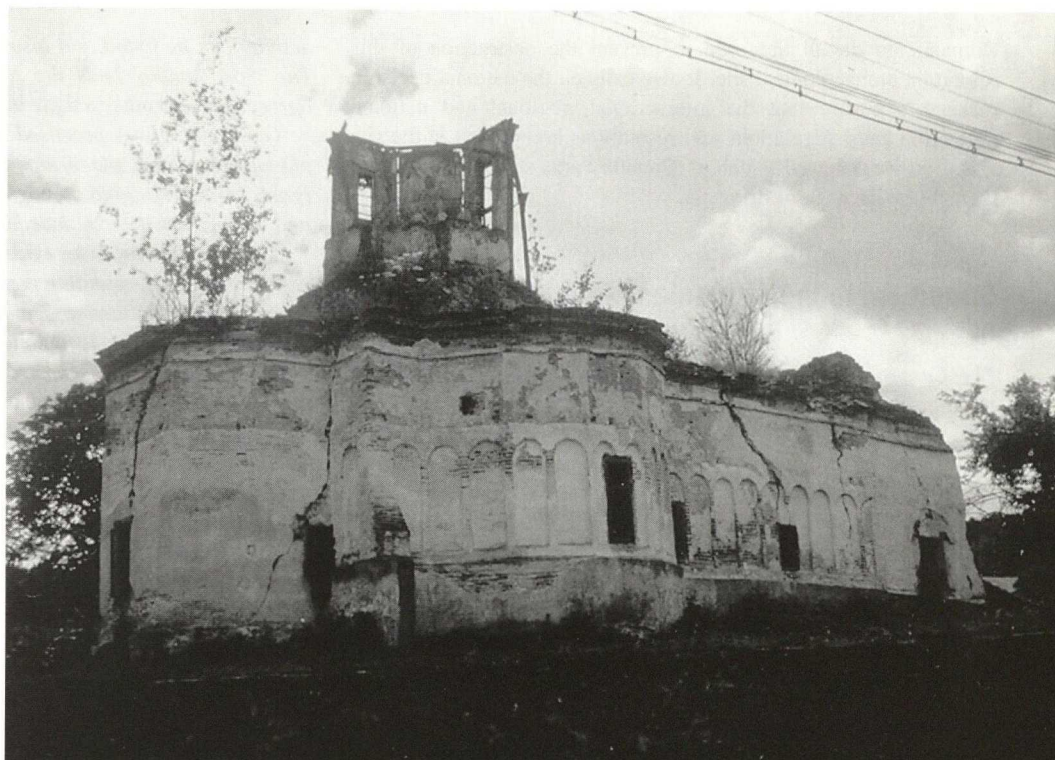
Ruined church – Ocnele Mari