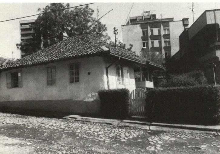
Kruševac, house from the 19th century surrounded by new constructions