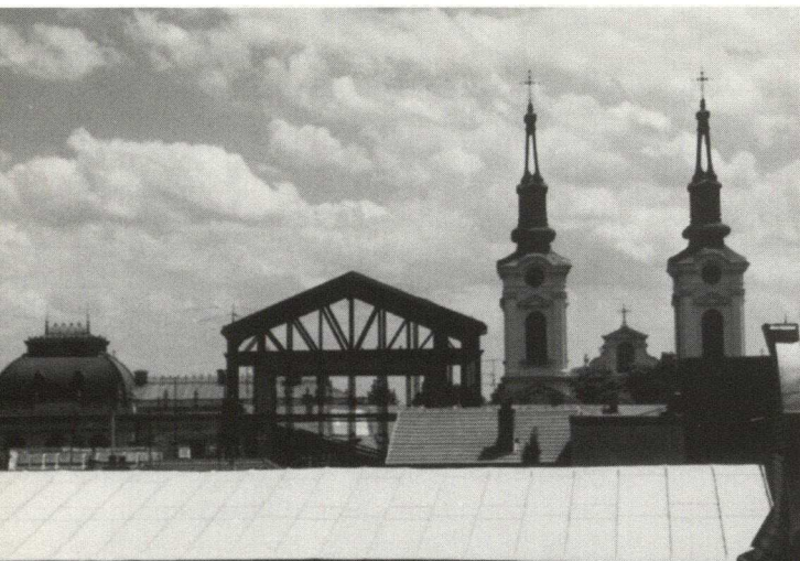
Sremski Karlovci, new construction in the historic centre – detail