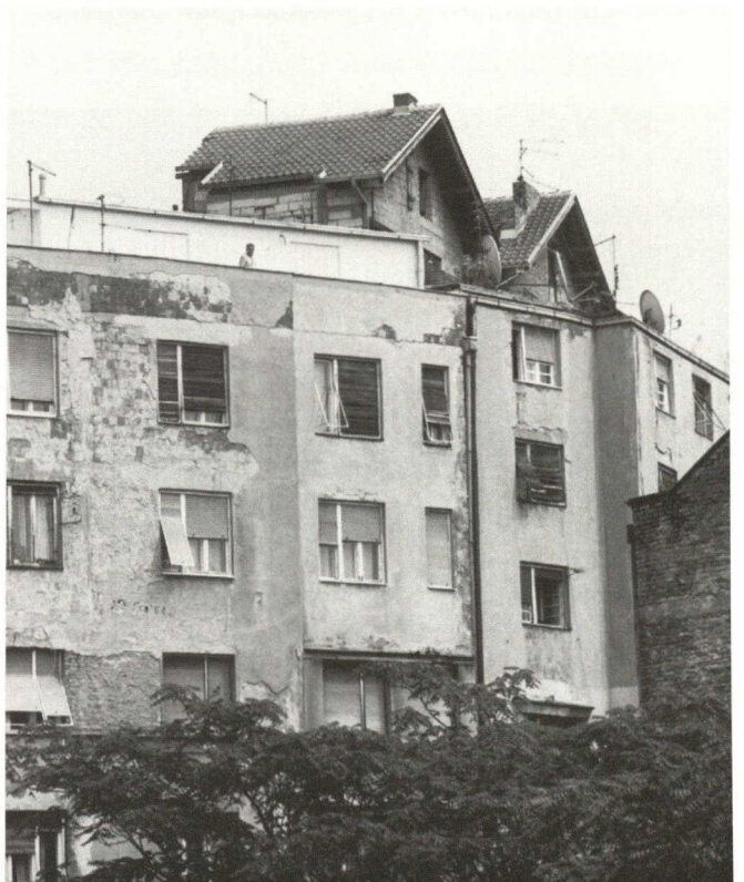
Belgrade, illegal construction in the historic centre