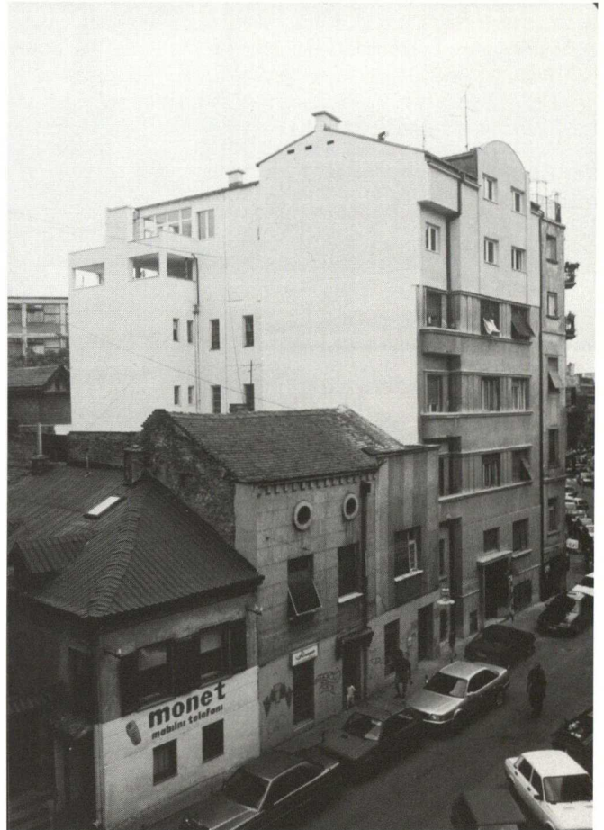
Belgrade, inappropriate addition in the historic centre

The building heritage of historic towns and urban complexes dating to the 18th–20th centuries has been exposed to permanent risks and destruction. On the one hand, due to the neglect of this kind of heritage in an environment that more easily and readily attaches monumental value to the heritage of bygone ages, the conservation service has marginalised protection work on this more recent heritage. On the other hand, throughout the past decade and still in the transitional period, this type of heritage has been exposed to specific degradation processes – as a result, many building values have been devastated or even irrevocably lost. The pressures of urbanisation, migration, alteration of buildings' function, unresolved traffic problems, and effects of environmental pollution are the same risks noted in developed western countries.