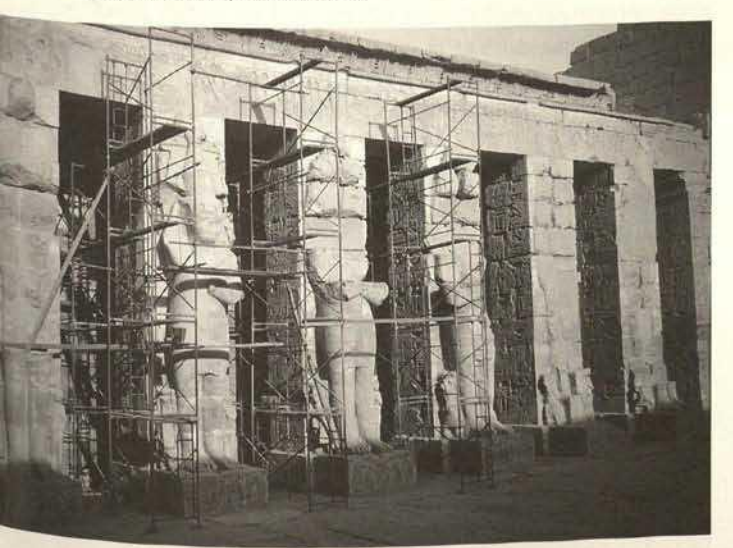
El-Charga Oasis, Hibis Temple, northern wall with ancient crack, mortar from the restoration of 1910-12