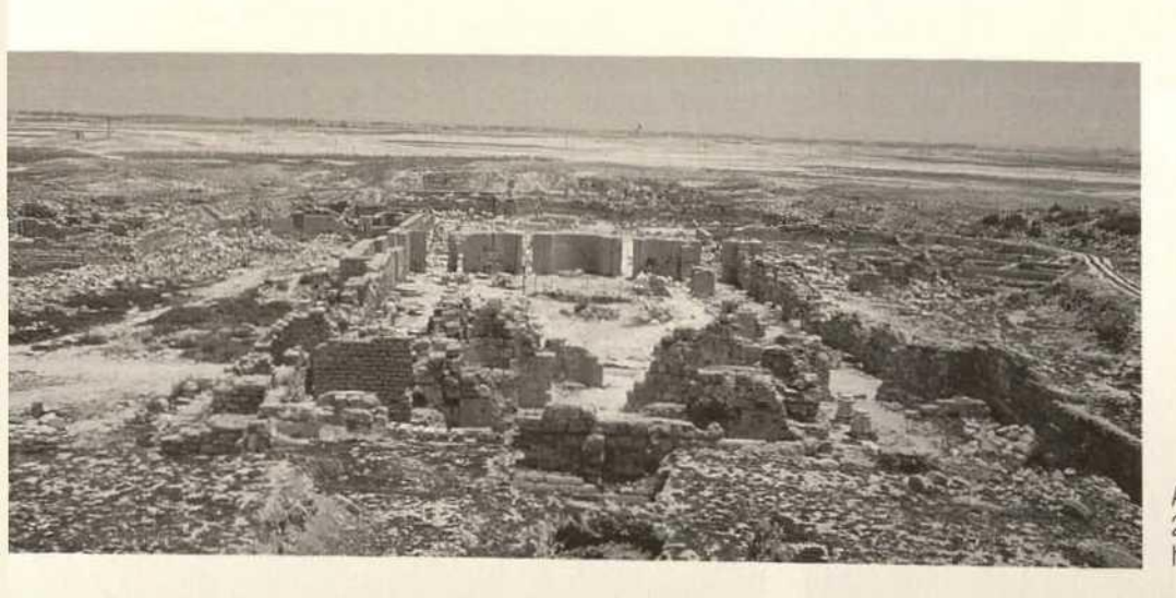
Abu Mina, The Great Basilica in 2001, extensive plant growth due to high groundwater level

This kind of destruction can be seen on all lower parts of the temple walls in Luxor, which are situated only a few metres or sometimes centimetres above the current Nile water-level. Through the rise of the groundwater level in the Nile valley – from Aswan to the Delta – the fabric of nearly all temple complexes and archaeological sites is severely affected by rising dampness, as well as by irrigation for land reclamation. In addition to these problems, a lack of maintenance is leading to a further loss of historic substance. Considering the enormous number of monuments from over 5000 years of cultural history (plus other problems due to its state as a threshold land), it is asking too much to expect Egypt (or any other country in a similar situation) to take care of the conservation of its cultural heritage without assistance from outside sources.