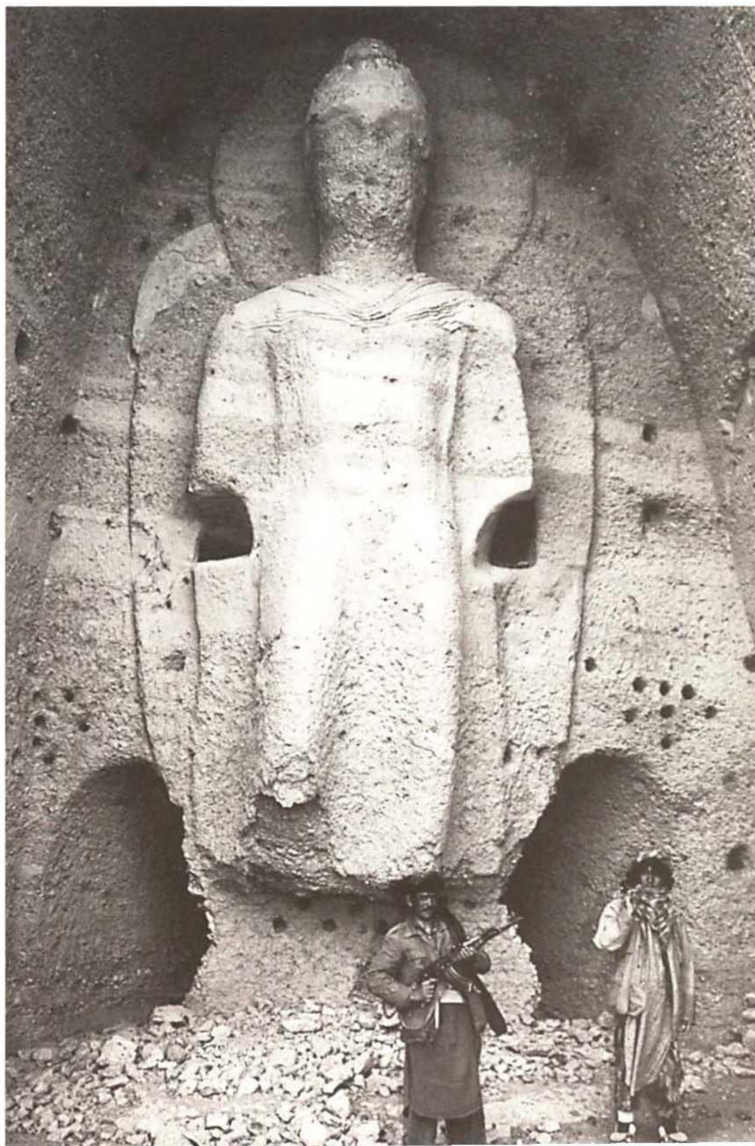
Buddha of Kakrank (5 th /6 th century), south of Bamiyan, seriously endangered by the destruction of the sculpture's base

But not for them alone. No other country was more traversed in antiquity, or was the meeting place of so many cultures and civilisations – Iranian, Indian, Central Asian and Far Eastern. At times they clashed, but at others they blended with unparalleled creativity, yielding rich fusions of artistic styles unknown elsewhere: Graeco-Bactrian, Indo-Parthian, Sino-