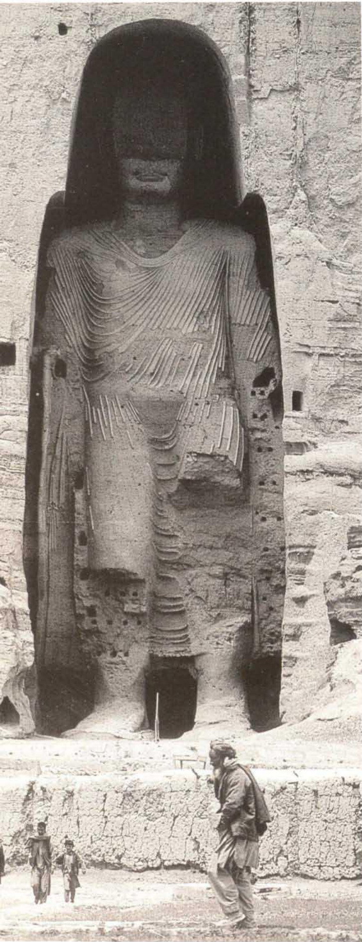
The Great Buddha of the valley of Bamiyan (7 th /8 th century)