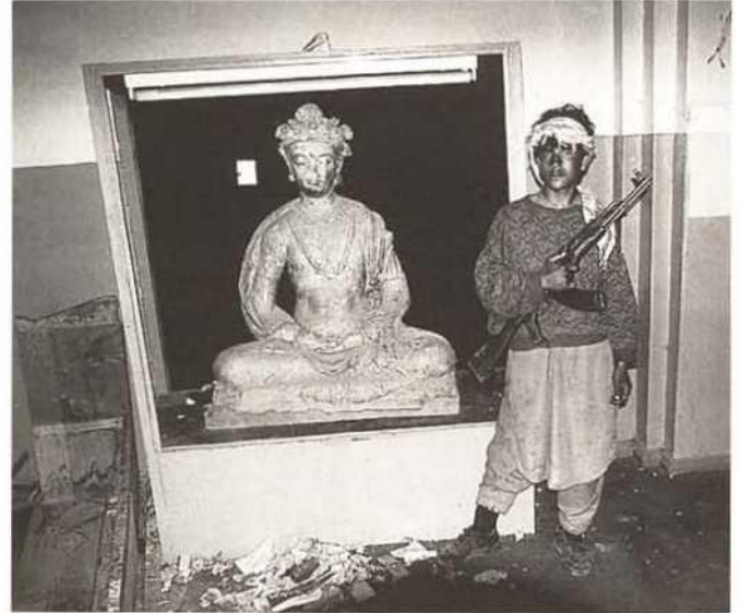
Looting of the Museum in Kabul

Although the illegal traffic in antiquities in areas under control of the Taliban has slowed, the activities of dealers elsewhere remain beyond the reach of a single government.