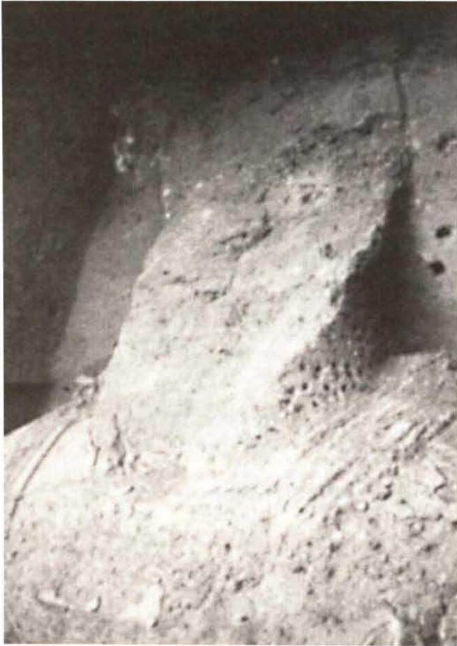
The blown-off head of the Small Buddha (photo 1999)

Efforts to enlist the help of foreign governments to prevent the importation of stolen artefacts have been hampered because Afghanistan is not a signatory either to UNESCO's 1954 convention and protocols on the protection of cultural property during war, or its 1970 convention concerning illicit trade in objects of cultural heritage. As such other states-parties are not obliged to help recover property that has been stolen and spir-