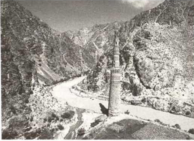
The Minaret in Jam

-Siberian, Kushano-Sassanian. The loss of this heritage is a loss for us all.