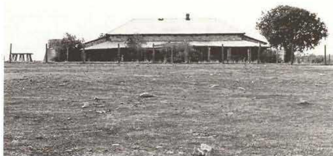
Coombie Station Homestead Complex

No national programmes are currently in place to monitor the physical condition of Australia's heritage places or objects, increasing the difficulty of assessing the effectiveness of responses in conserving heritage resource... State of the Environment Report, 1996