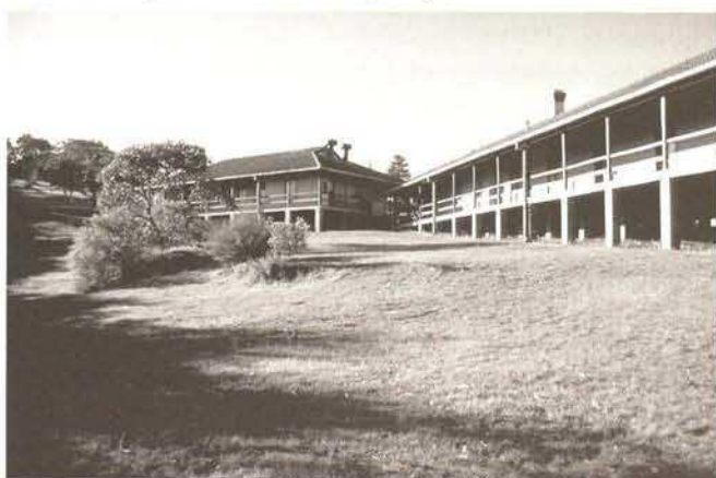
North Head Quarantine Station, Sydney Harbour National Park