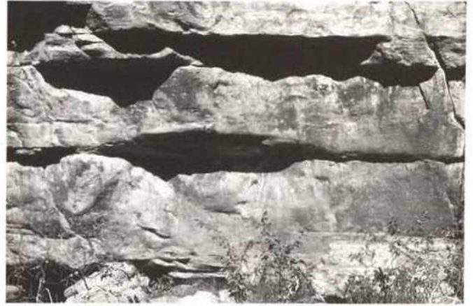
Kakadu National Park

In early 1999 there were 28 languages in Australia with only one speaker remaining ( Ethnologue , February 1999). Despite