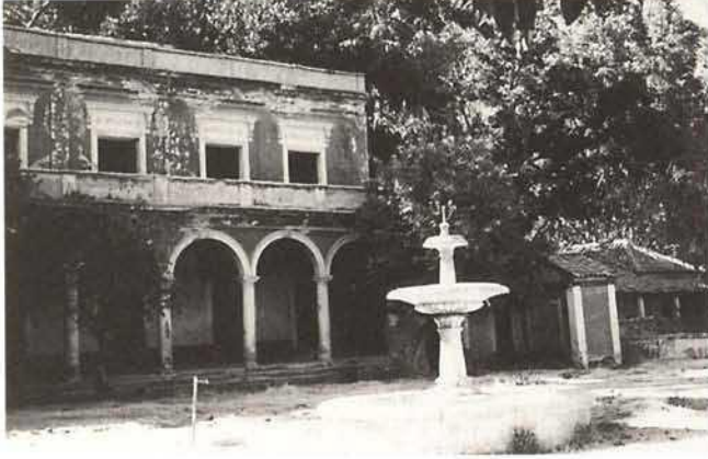
La Florida Palace, Sucre