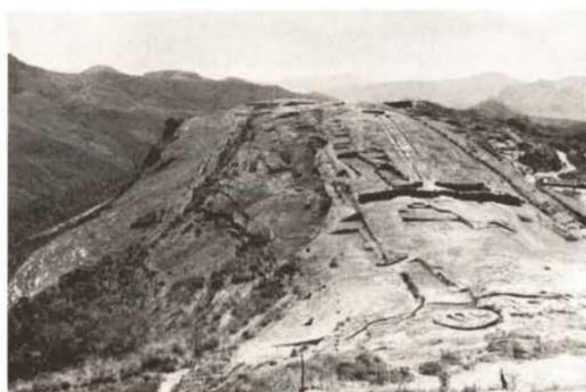
View of the sculptured rock at Samaipata, Dept. of Santa Cruz

3 miles (5 km) from the village, at an altitude of about 2000 m (6500 feet).