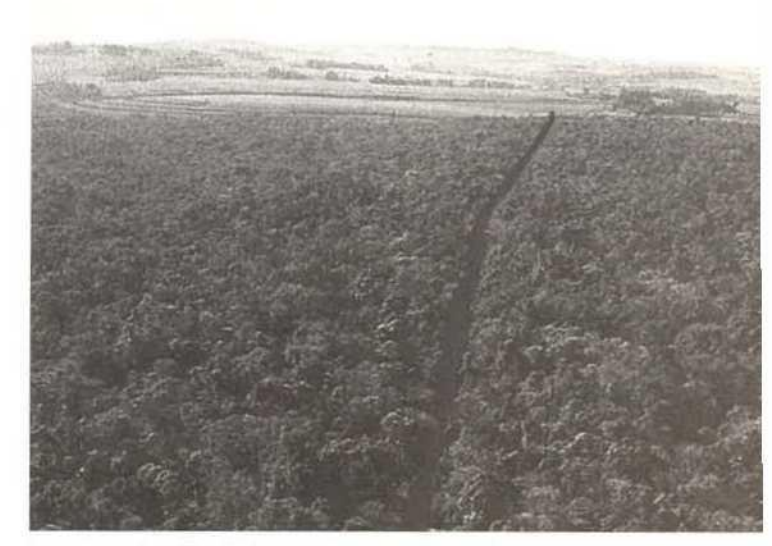
Iguaçu National Park, Colono Road. The road threatens the ecosystem of the park.