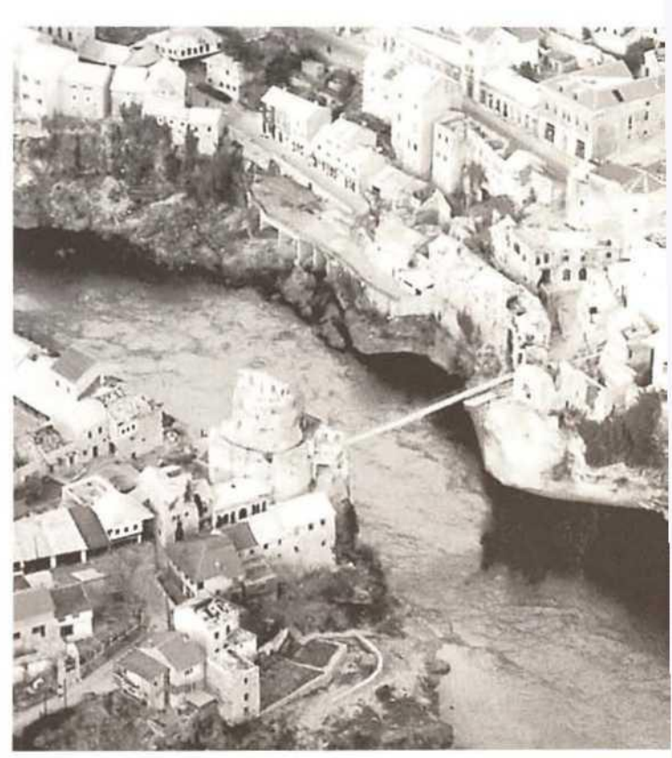
The destroyed centre of Mostar

(Information based on A. & F. Hadzimuhamedovic's report for the UNESCO conference "Cultural Heritage at Risk", Paris September 1999)