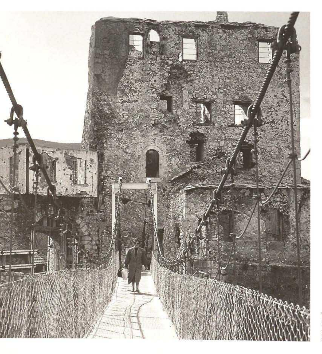
Temporary suspension bridge in Mostar (in the meantime replaced by a reconstruction of the old bridge)