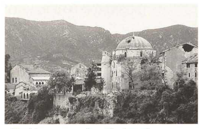
Mostar's Koski Mehmed Pasha Mosque before and after the war. Most of Bosnia's mosques were destroyed or damaged.