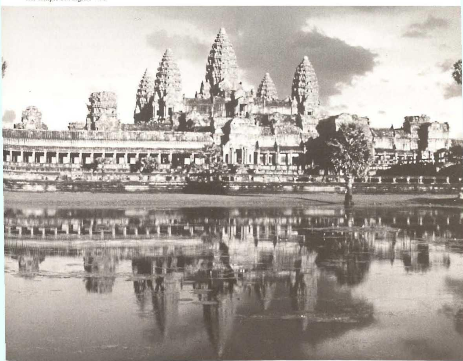
The temple of Angkor Wat

The sculpture is made of various types of sandstone, which differ considerably in colour as well as in the behaviour of their deterioration. The observed damages are far-reaching: from immense structural and stability problems to extremely active deterioration processes and a rapid decay of the artificially sculptured images along the temple walls. At the moment the Fachhochschule in Cologne, Germany, is entrusted with a project for the rescue of this World Heritage Property, but can only take care of an infinitely small part of its endangered fabric.