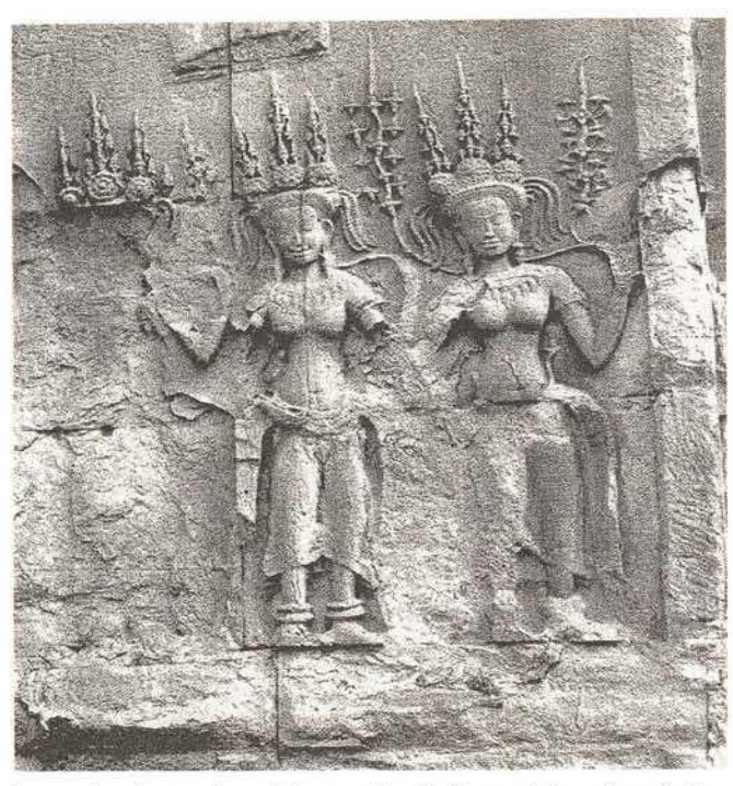
Increasing destruction of the temple reliefs: condition of a relief in 1965