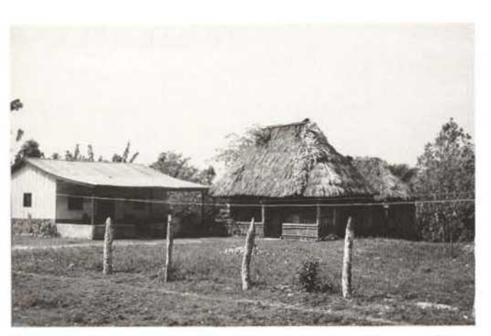
Petén, rain forest area, traditional houses threatened by use of industrial building materials

Antigua Guatemala, partial reconstruction of the cathedral, damaged by an earthquake