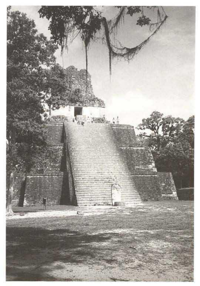
Tikal, Temple I

Apart from that, the entire cultural heritage in Guatemala is threatened by earthquakes, the most famous example being Antigua Guatemala, which was destroyed several times. In this town, which is on the World Heritage List, it is not enough to consolidate the ruins of important monuments. Instead, in the