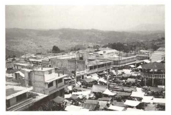
San Francisco El Alto, market place. Almost all the traditional houses have been replaced by new reinforced concrete buildings.