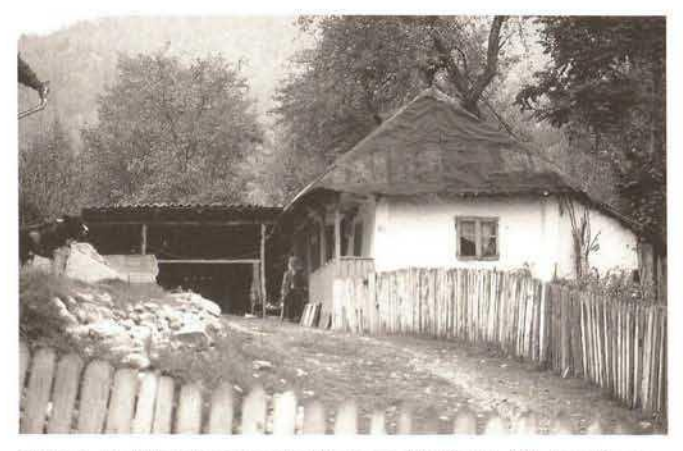
Hurezu, traditional vernacular farmstead in South-Western Romania

HRH the Prince of Wales in the destiny of the Saxon villages). In 1998, the historic city of Sibiu and its surroundings were declared an area of national interest and priority for the economic and cultural revitalization by the Council of Ministers – again an initiative of the Minister. The project "Sibiu 2000" as part of the Council of Europe's campaign "Europe a common heritage" includes urban conservation projects, also run and financed by the German Federal Ministry for Development and Cooperation and the GTZ, the society for technical cooperation.