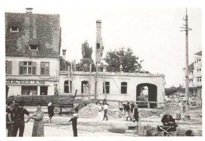
Sighişoara (Schäßburg), demolition of the historic mill district during Ceauşescu's time (1986)