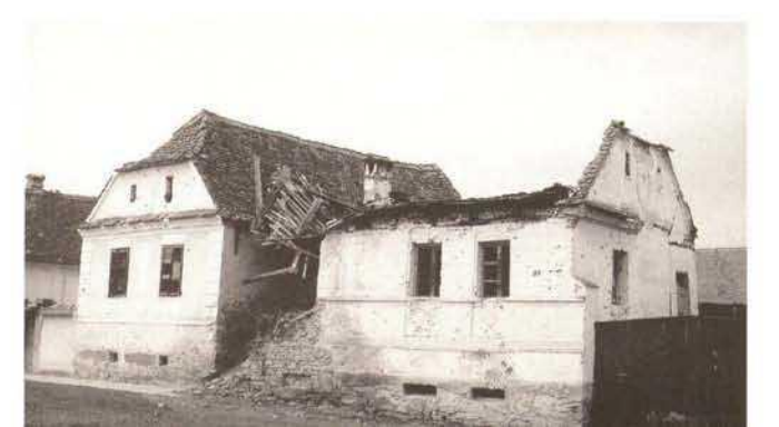
Cincu (Großschenk), abandoned house of Transsylvanian Saxons (1994)