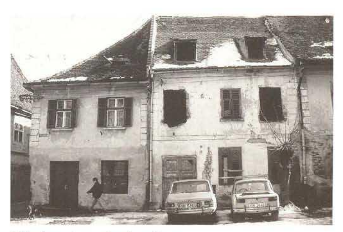
Sibiu, lower town, abandoned house