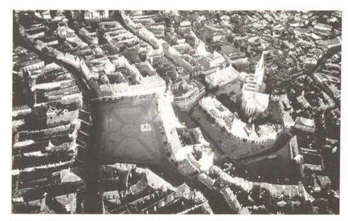
Sibiu (Hermannstadt), aerial view of the historic city

The efforts made by Ion Caramitru, Minister of Culture, should be appreciated: for 1997 he managed to get a ten times higher budget from the Parliament for restoration works and in 1998, due to his initiative, the World Bank offered a loan for conservation work on some important monuments including a research project on revitalization measures for some of the Saxon villages (the latest going back to the interest shown by