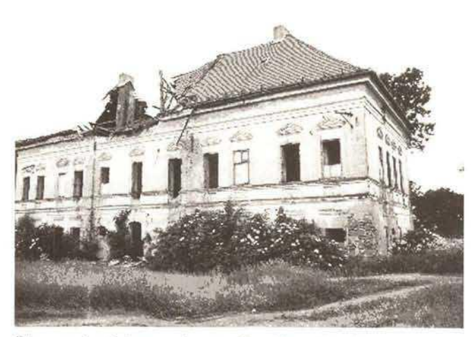
Žip, neo-classical manor house with collapsed roof