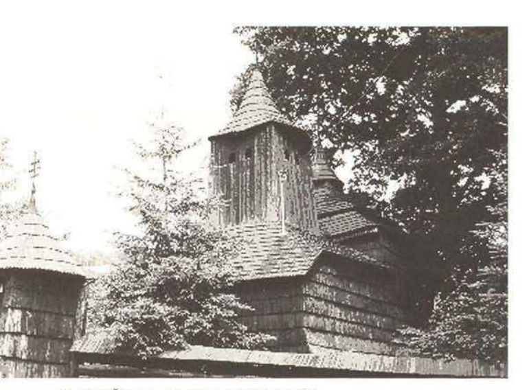
Krajné Čierno, wooden church (1730)

unsuitable use. In many cases, the process of dilapidation has not stopped yet, and it is threatening furniture and other parts of the interiors as well. In many very large monasteries (such as the Gothic complexes in Leles, Šahy or Hronský Beňadik) the basic question of their proper use is still unsolved. Churches, often situated outside contemporary town centres, especially the oldest ones, are left without any use, although their interiors are often covered with precious medieval mural paintings. Persistent efforts to rebuild and enlarge historic churches are part of the actual problem and often result in a preference for a new construction to the maintenance and use of an old one. On the other hand, large synagogues, ignored and misused disparagingly for years, are without use, such as the representative 19th century one in Lucenec. An increasing problem that persists is the vandalism, destruction and pilfering of churches in a post-totalitarian community. The wooden churches in eastern Slovakia are a delicate problem, as their weak fabric needs regular maintenance, but the communities responsible often consist of between 20 to 200 inhabitants, mostly elderly, without any chance of allocating the budget for necessary actions. One of the churches - Krajné Čierno, has been inscribed in the year 2000 List of the 100 Most Endangered Sites by the World Monuments Watch.