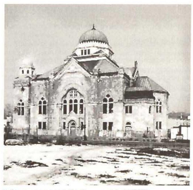
Lučenec, synagogue in Art Nouveau style (1923/26)