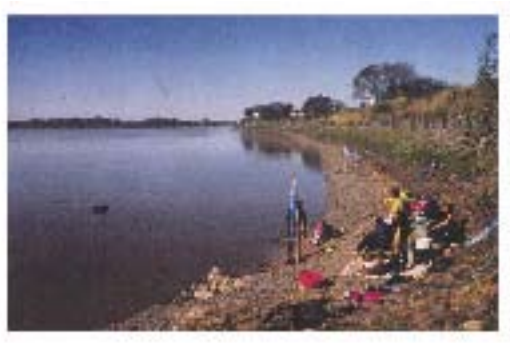
Figure 3: Erosion of the San Javier river banks; the map shows the area lost due to erosion