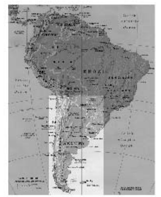
Figure 1: Localisation

The repeated flooding of the river and the resulting periods of isolation together with the erosion process of the terraces banks created difficult living conditions. The city started to suffer the loss of dry land, especially along the river front,