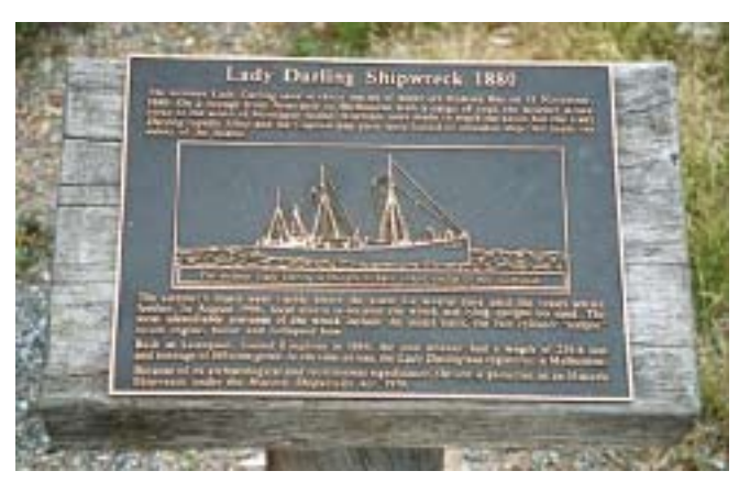
Figure 3: The plaque - funded by the Eurobodella Shire Council (D. Nutley)

shipwreck in Australia as accessible and as frequently visited as the Lady Darling that is as intact and as attractive as the day it was found.