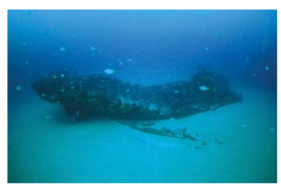
Figure 1: Lady Darling wreck – from stern to boiler at midships (D. Nutley)

Other identifiable features are expected to survive beneath present sand levels, particularly forward of the boiler, the