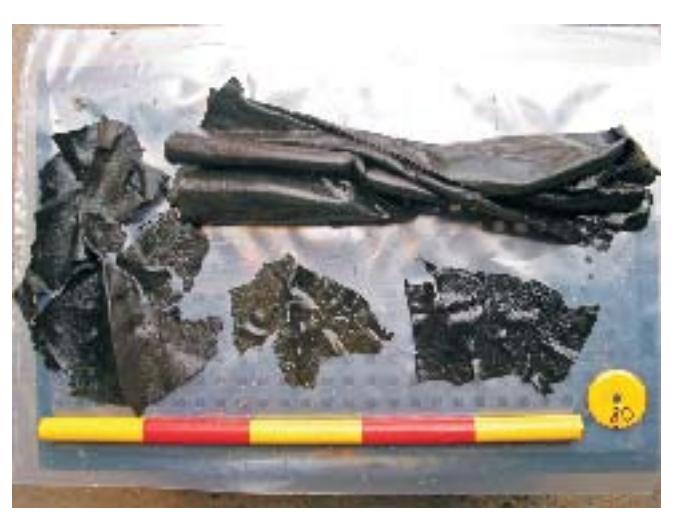
Figure 1: Part of a leather garment or jerkin excavated from the Princes Channel wreck

The PLA believed that the wreck had been completely recovered or dispersed, but a bathymetric survey to monitor the results of the channel dredging in October 2003 identified some 'high spots' in the vicinity of the wreck. A further diving