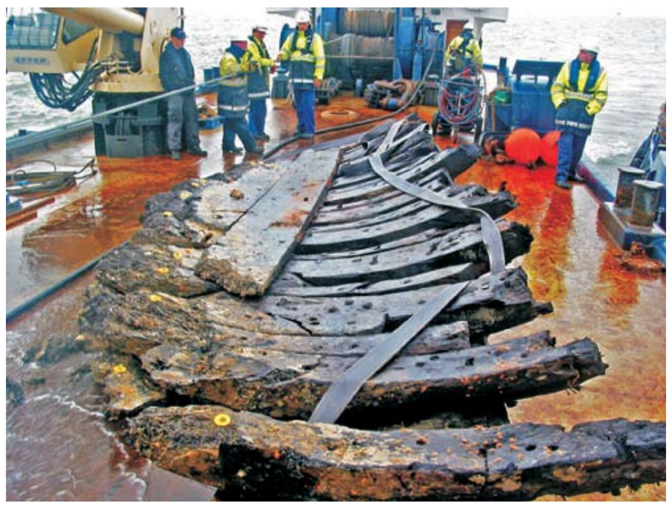
Figure 2: A section of the lower port side of the hull of the Princes Channel wreck, onboard a PLA salvage barge