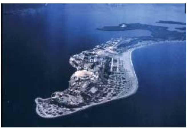
Figure 1: Aerial view of Port Royal situated at the tip of the Palisadoes

Port Royal is known for the unusually high number of catastrophes that have struck it. The most significant disasters causing extensive damage were the 1692 earthquake (which submerged two thirds of the town), the 1703 fire (the town was burned to the ground), the 1722 and 1744 hurricanes (they both obliterated the town), the 1770 earthquake (which destroyed the hospital), the 1815 fire (the town was extensively burned), the 1907 earthquake (which heavily damaged the Victoria Battery) and the 1951 hurricane (which left only four buildings standing). All of these played a major role in creating the different archaeological components