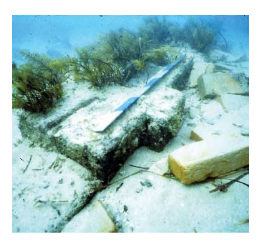
Figure 3: The Solway in the 1980s (B. Jeffery)

Cosmos Coroneos, 1997, "Shipwrecks of Encounter Bay and Backstairs Passage." South Australian Maritime Heritage Series No. 3. Department of Environment and Natural Resources, Adelaide, South Australia; Australian Institute for Maritime Archaeology Special Publication No. 8.