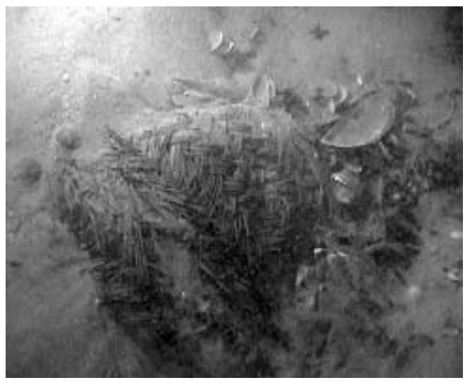
Figure 4: A Spanish olive jar with basket, within a few hours the basket disappeared due to the strong currents on the site

processes is rapid? The protection of a site should be a combination of a legal and, if necessary, a physical protection.