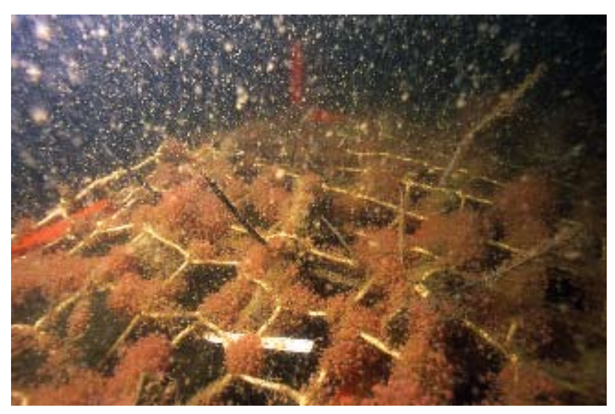
Figure 2: Fresh pine and oak woodblocks are hanging freely in the water within an open weave net. These samples help us to understand which processes are responsible for the deterioration of shipwrecks that are lying uncovered on the seabed