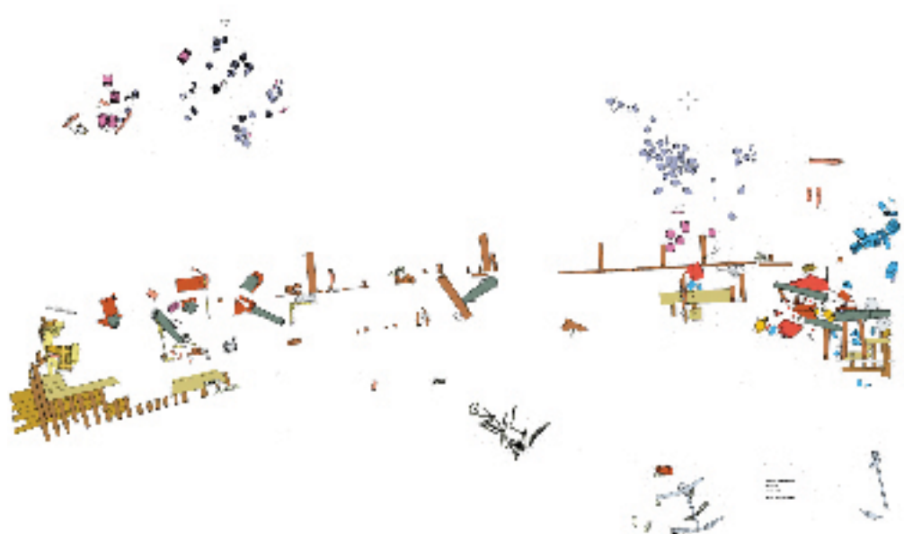
Figure 1: Site plan of the BZN 10 wreck. Only structure and objects above the seabed are mapped during a non-intrusive assessment (Drawing M. Manders)