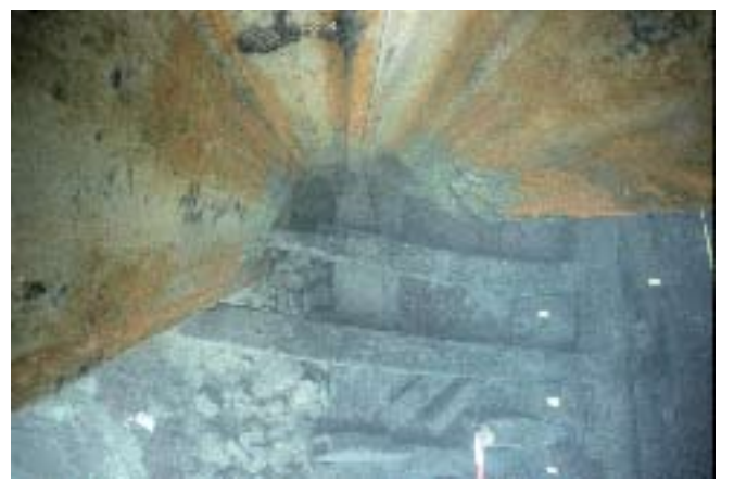
Figure 1: View of the point where the metallic bulkhead of the pier cuts the structure of the boat without damaging the rest of the architecture

In 2000, the Basque Government's Department of Public Works and Transportation, promoter of the dredging works, drew up a project for the construction of a fishing port on the left bank of the Oria. Due to the absence of archaeological protection, an archaeological survey was not included in the project. The Regional Council of Gipuzkoa, aware both