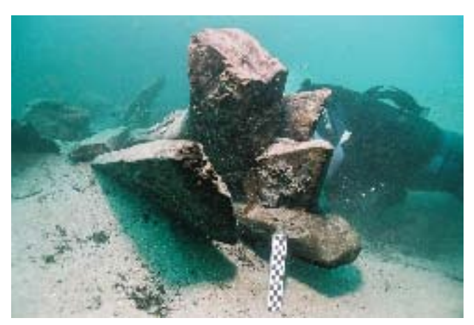
Figure 2: Given that the stern is located closer to the center of the river, it was more exposed to fluvial abrasion than the rest of the wreck and consequently was further damaged; the stern was, however, significant enough to be able to clarify the typology and chronology of the wreck

of the scope of the proposed works and of the underwater archaeological record in the area, alerted the promoting department of the Basque Government with regards to the necessity of developing an archaeological component.