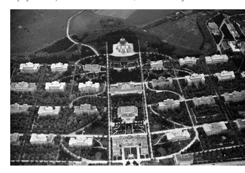
Aerial photo of the Otto-Wagner-Hospital, 1932