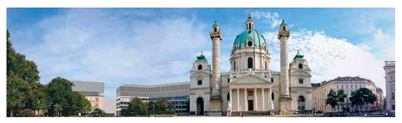
View of the Karlskirche with simulation of planned height of the Wien Museum Neu

east side of the Karlsplatz (architect Oswald Haerdtl). In the early 1970s, in the line of the museum's façade the Winterthur building of the Zurich Versicherung (architect Georg Lippert) was added. The latter building bends and comes as close as three metres to the east side of the Karlskirche (thus visually closing the square).