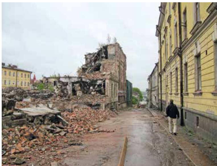
Demolished block in the middle of the town (, April 2013)