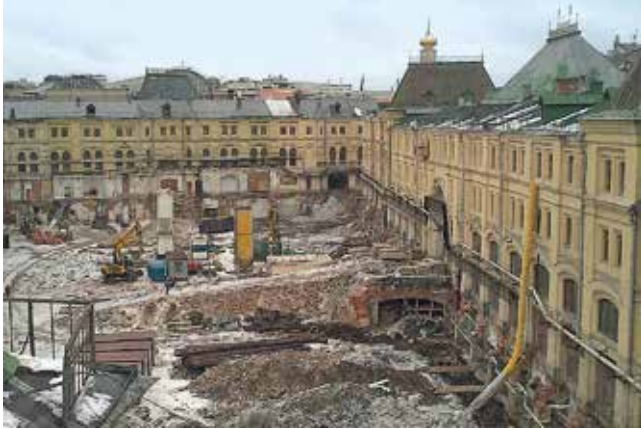
Demolition of the inner buildings of the middle rows

Kremlin and the Pashkov House, a neo-classical mansion of the 18th century.