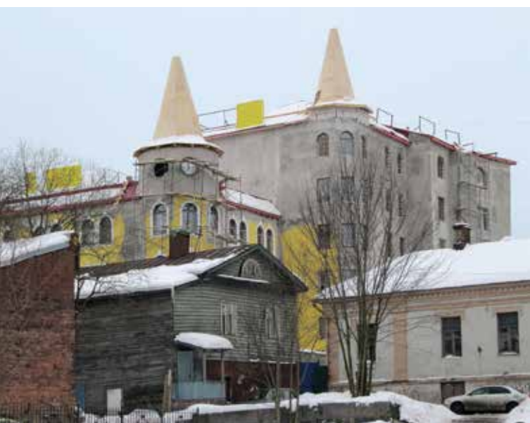
“Linna” in the middle of the old city

The town of Vyborg lies on the northeast coast of the Gulf of Finland, close to the border between the Russian Federation and Finland. Administratively, Vyborg is part of the Leningrad region ( oblast ). The history of Vyborg spans over seven centuries. Vyborg was first a part of Sweden and received a town charter in 1403, then part of Russia as a town of the Grand Duchy of Finland (1710–1917), then part of the independent republic of Finland (1917–1944), after that part of the Soviet Union, and since 1991 it belongs to the Russian Federation. Vyborg has always been an important trade centre between East