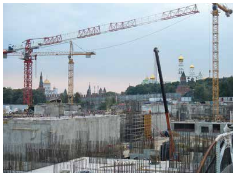
Zaryadye construction site