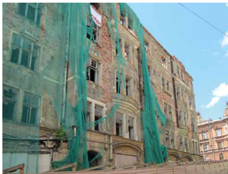
Krepostnaja uliza 3 built in 1904; the last inhabitants left 25 years ago

The ICOMOS General Assembly on November 28, 2011 adopted The Valetta Principles for the Safeguarding and Man-