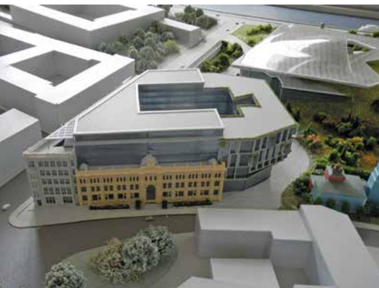
Hotel project in Zaryadye

Hotel Russia was demolished in 2006 after ordinary citizens and experts had concurred in branding the hotel as a discordant object in the historic centre of the city. For almost a decade, the land stood in ruins until an extravagant landscape project was launched. The project that originally won the international architectural competition has undergone significant changes. 2 All of them increase the volume of construction work and the final cost of the project. The original landscape project now has several ap-