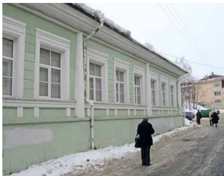
Progonnaja uliza 10, reconstruction of a bombed house, rebuilt in 1994

The town was not devastated by real street fights during the war, but the central area was heavily bombed. The Finns were evacuated and the Soviet state took over an empty and ruined town, which was then repopulated by Russians. The first Rus-