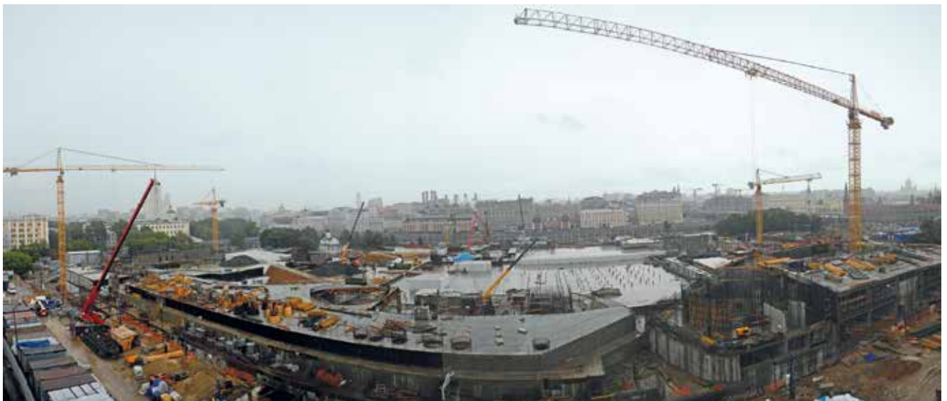
General view of the Zaryadye construction site

Borovitskaya Square, the legendary wellspring from which Moscow rose as a fortified town at the junction of trade routes, is located to the west of the Kremlin, in front of the Borovitsky Gate. At the initiative of the Russian Military-Historical Society, chaired by the Russian Minister of Culture, Vladimir Medinsky, a giant statue of St. Vladimir will be erected on this square. The statue, whose height is planned to exceed 20 metres (a notch higher than the highest Kremlin walls), will assert itself as the new architectural dominant in the vacant space between the