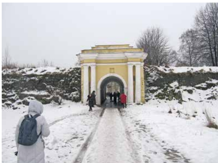
The Crown of St. Anna southern gate