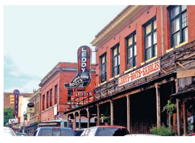
Fort Worth Stockyards

confluence of the Colorado and Little Colorado rivers, an area of great sacred significance to the Hopi, Navajo, and other American Indian tribes.