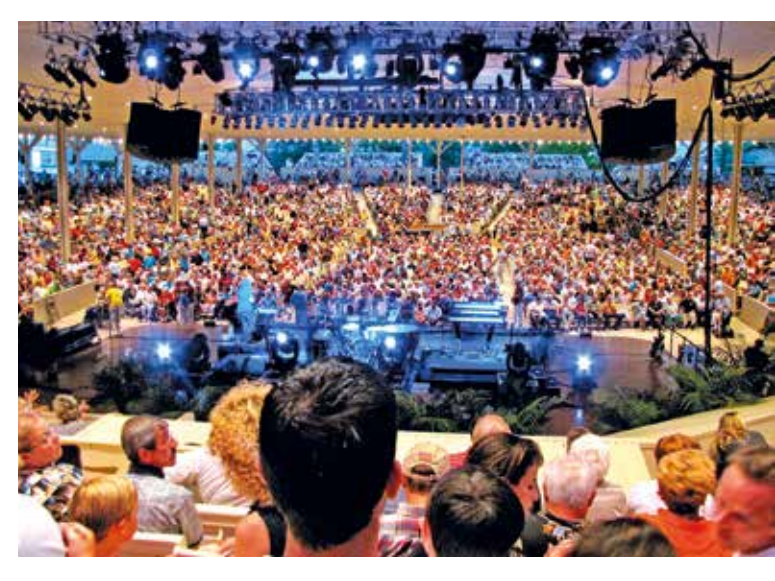
Chautaugua Amphitheater during a performance

Chautauqua Amphitheater is a National Historic Landmark located 70 miles southwest of Buffalo, N.Y. Known colloquially as the Amp, the Amphitheater, which has hosted a wide range of