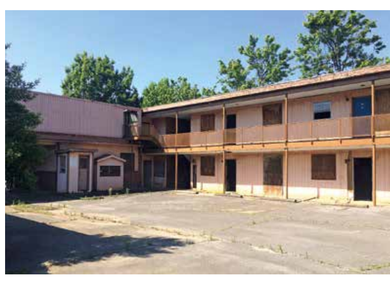
A.G. Gaston Motel in Birmingham, AL, (photo City of Birmingham Archives)

The two-story motel was built in 1954 by Arthur George (A.G.) Gaston, a pioneering African-American entrepreneur and philanthropist who was also instrumental in the integration of Birmingham. The Gaston Motel, which sits adjacent to the 16th Street Baptist Church, was a gathering place for African-Amer-