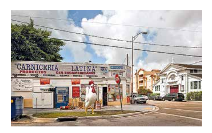
Street corner in Little Havana