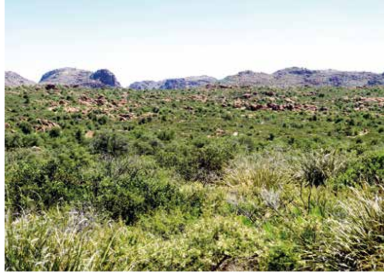
Oak Flat in Superior, Arizona