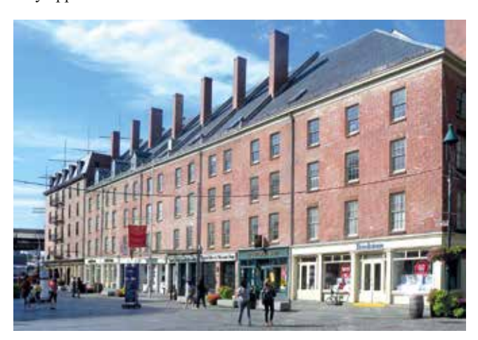
South Street Seaport in New York, Schermerhorne Row

According to the National Trust's president the proposed developments will have an overwhelming impact on the historic neighborhood, diminishing the Seaport's unique relationship to the water and compromising one of the most intact 19th century neighborhoods in Manhattan. The issues around the redevelopment of the South Street Seaport are urgent as the approval process for partial demolition of the Tin and New Market Buildings is in motion and the developer has started the process of seeking City approval for the new tower.