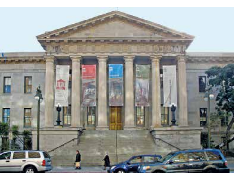
Old US Mint, San Francisco

The National Trust hopes this designation will increase national awareness of Oak Flat and its profound importance to Native American tribes. It claims the tribes who regard Oak Flat as a sacred place were not adequately consulted before this land exchange took place. Before any potentially harmful mining activity takes place at Oak Flat, it needs to be made sure that the tribes and others who care about this important place have a voice in shaping its future.