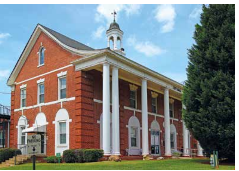
East Point City Hall

The courthouse is an important public building from Carrollton's days as an independent city and is one of the city's most significant landmarks located outside of the French Quarter. In the early 1950s, the community and the non-profit group Louisiana Landmarks Society staved off a demolition threat that led to the courthouse's rebirth as a school. From 1957 to 2013, it housed a series of public schools, including Benjamin Franklin High School, the first New Orleans public high school to integrate in 1963. Musicians Wynton and Delfeayo Marsalis and actor Wendell Pierce are among Ben Franklin's famous graduates.