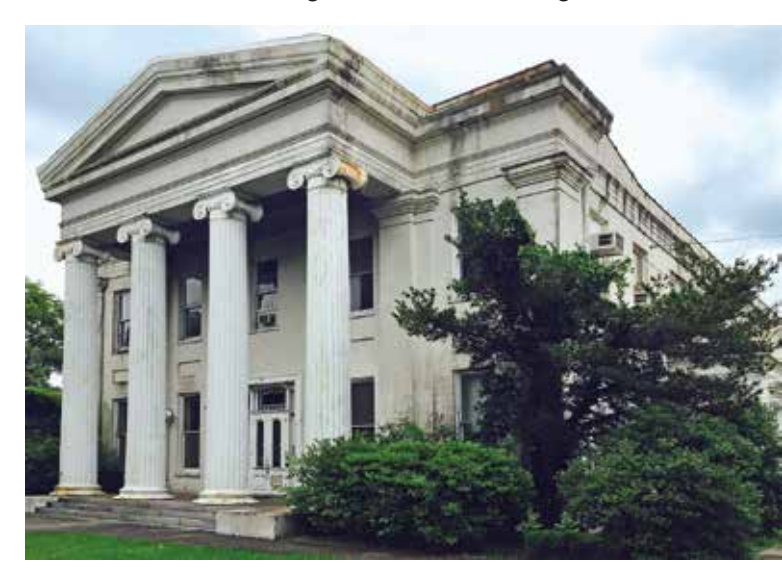
Carrolton Courthouse