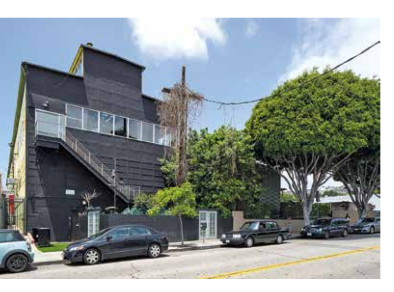
The Factory in West Hollywood

vate celebrity nightclub, an antique market and an experimental theatre. It is most famously known as the home of Studio One, a pioneering gay disco that opened in 1974. Hosting the likes of Patti LaBelle, Joan Rivers and Liza Minnelli, Studio One and its Backlot Theatre were open seven days a week, had cutting edge sound and light systems, and a dance floor that regularly drew more than 1,000 people a night. Founded by a Beverly Hills optometrist and openly gay man, Studio One became a place for gay men to socialize and proudly and openly celebrate their identity. As such, it was associated with the gay rights movement throughout its history. When the AIDS epidemic hit in the early 1980s, for example, one of the nation's first major fundraisers for AIDS research took place at Studio One.