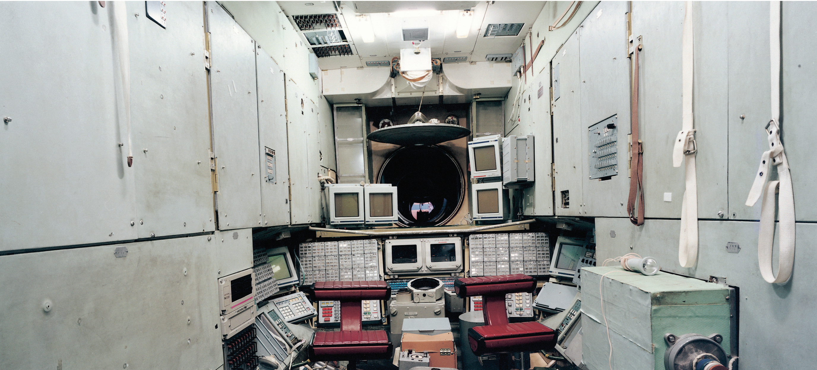
Star City, Mir Simulator. Moscow, Russia, 1999.