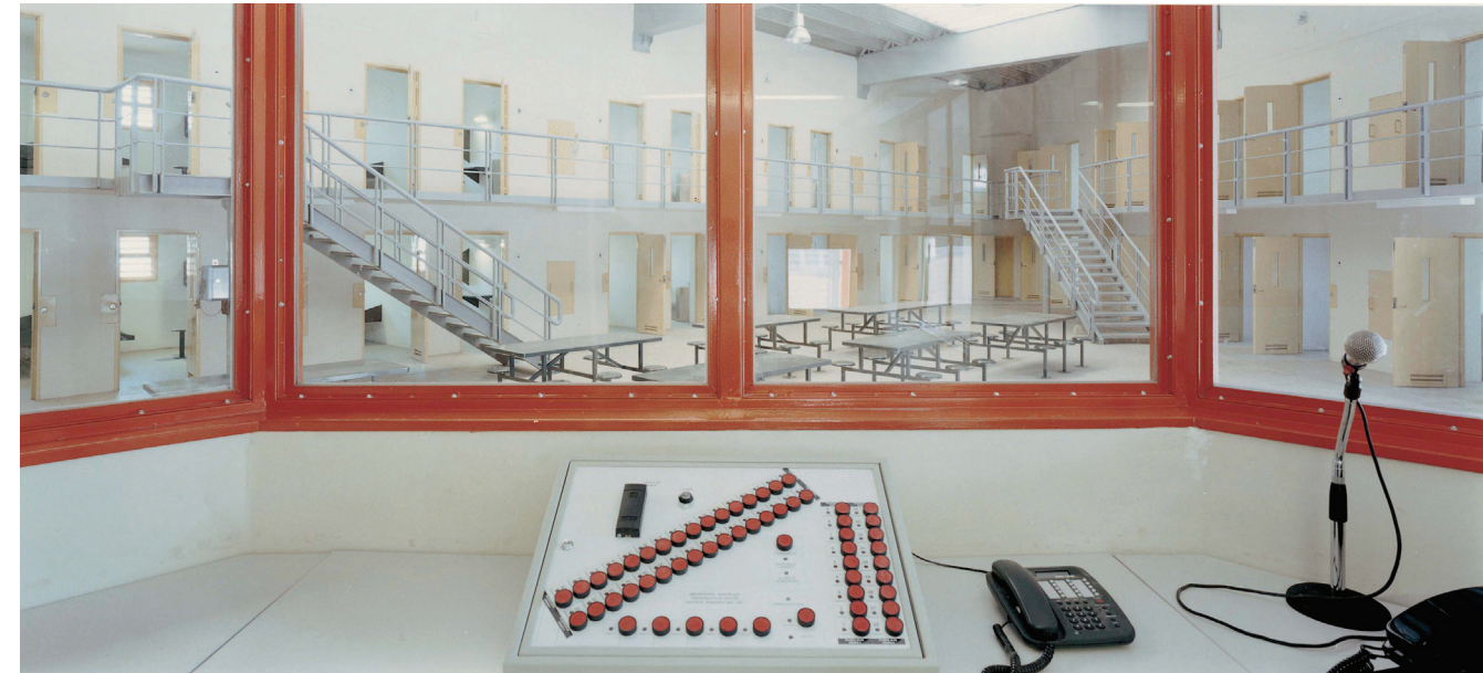
Ezeiza Penitentiary. Buenos Aires, Argentina, 1998.