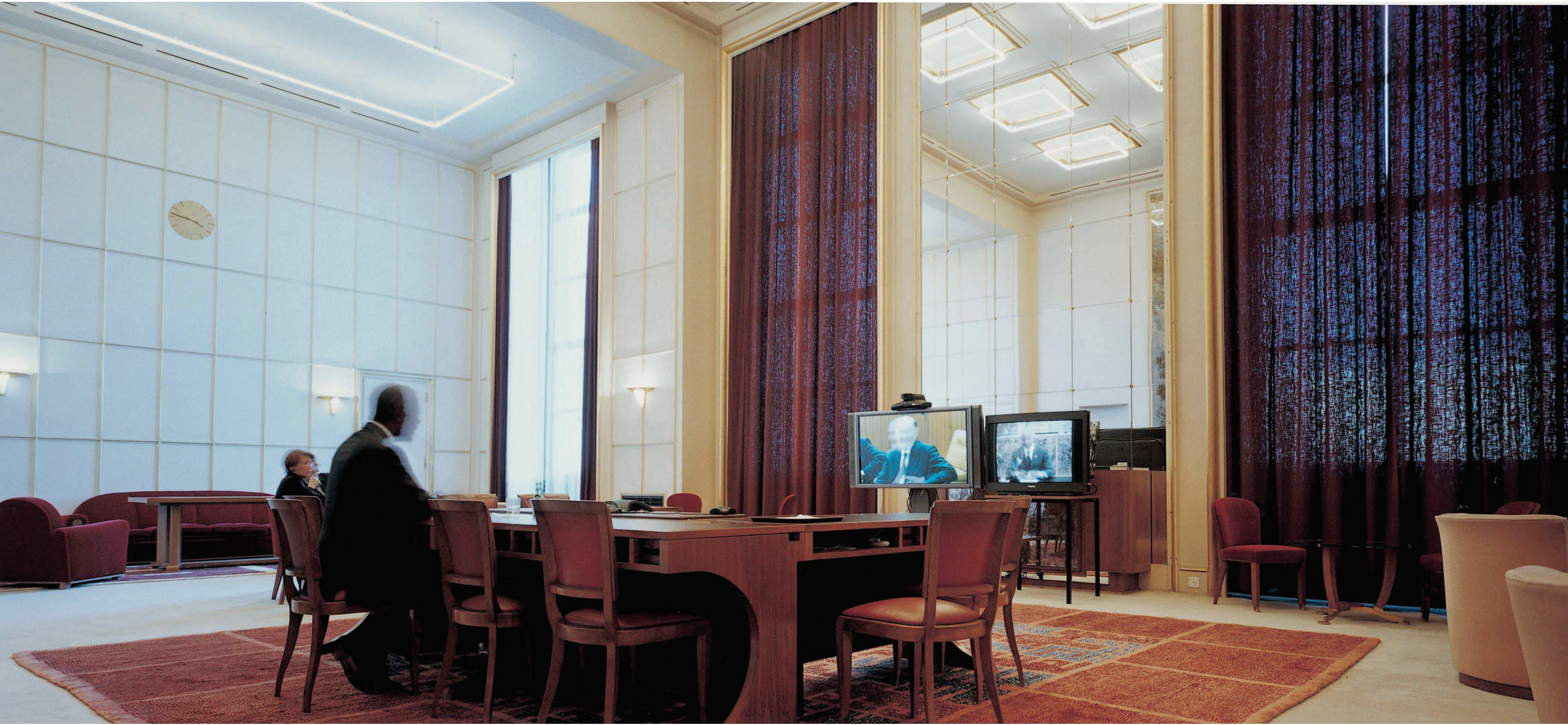
ONU, Organisation des Nations Unies, Kofi Annan Secretary-General, video conference. Genève, Switzerland, 2001.