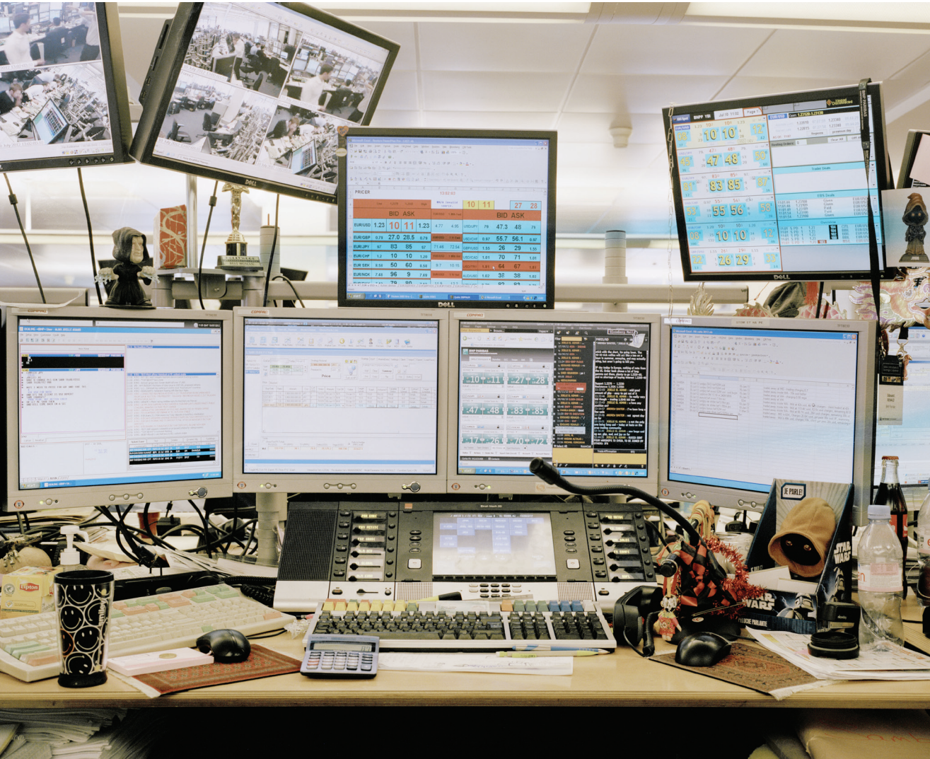
BNP Paribas, headquarters, trading floor. Paris France, 2012.