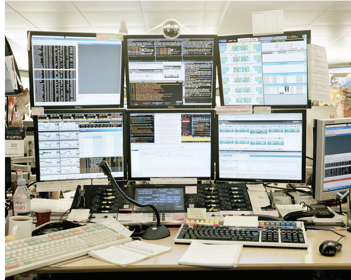
BNP Paribas, headquarters, trading floor. Paris, France, 2012.