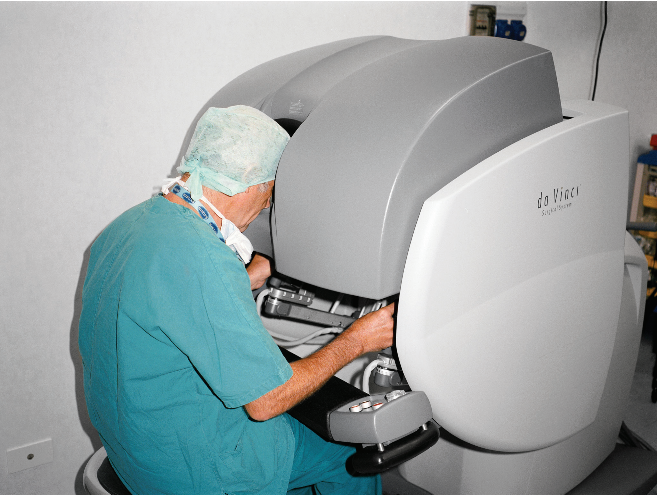
Operating theatre, remotely controlled surgery. Modena, Italy, 2006.