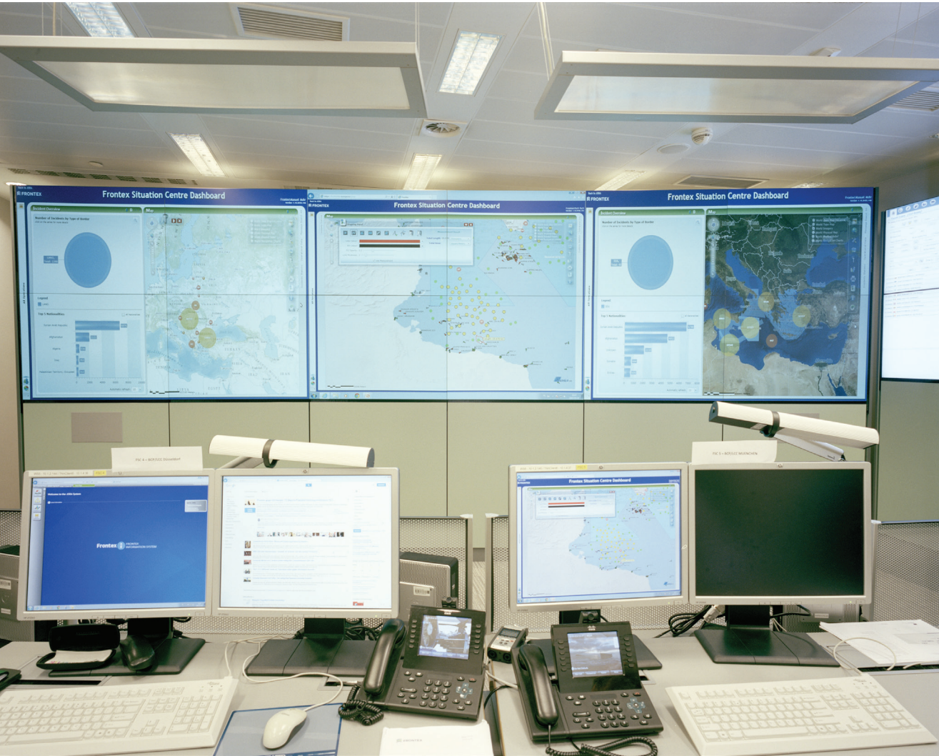
Frontex, control room. Warsaw, Poland, 2014.