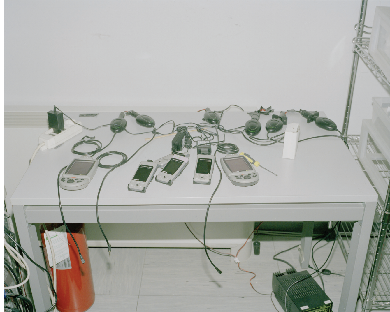
Navionics, GPS receivers, testing software. Viareggio (LU), Italy, 2009.