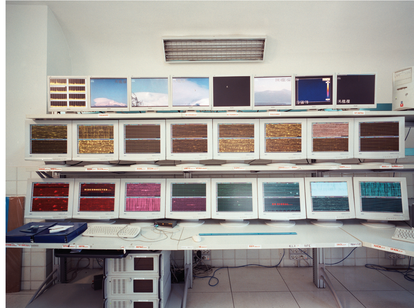
National Institute of Geophysics and Volcanology, monitoring room. Catania, Italy, 2006.