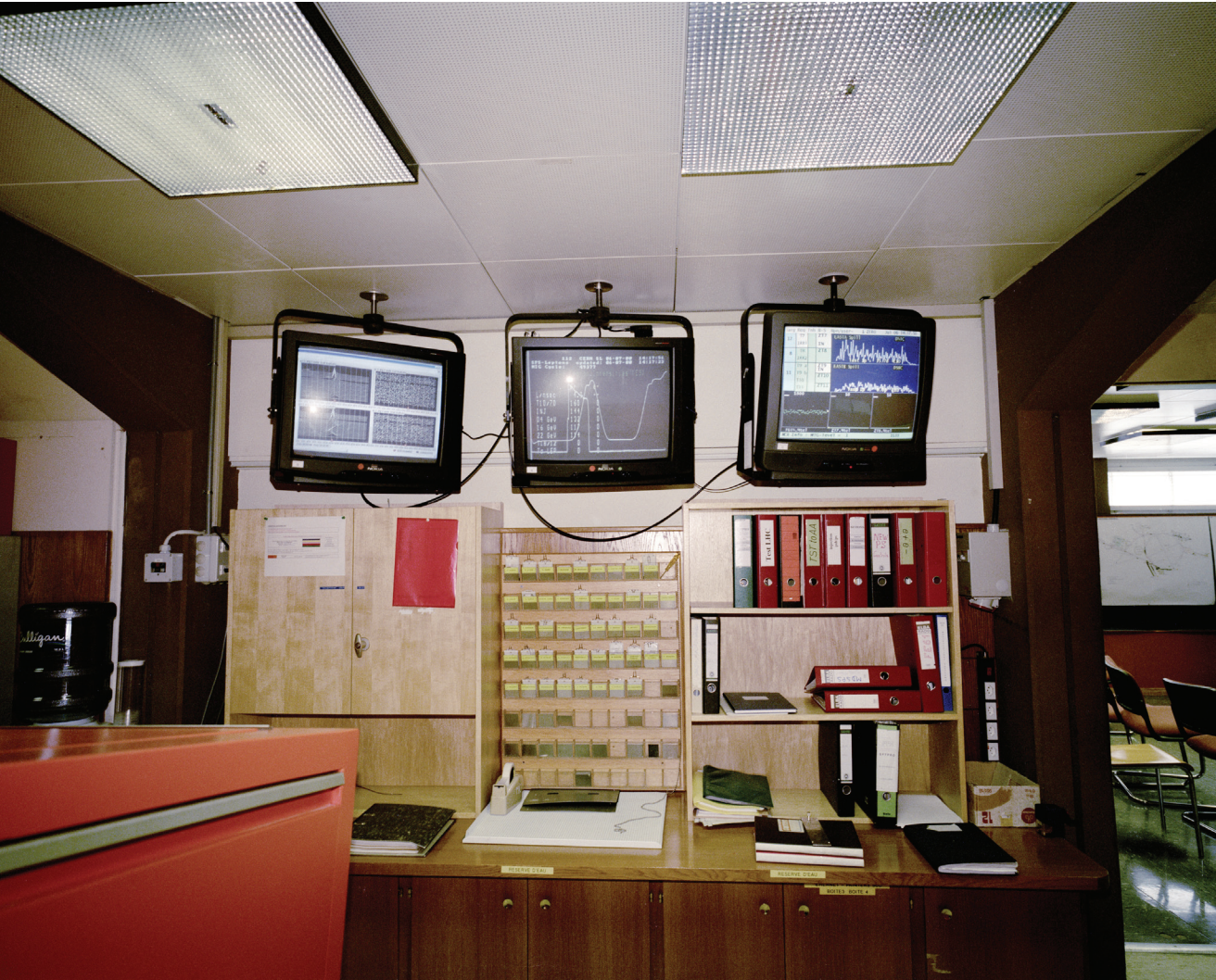
CERN, European Organization for Nuclear Research, control room. Geneva, Switzerland, 2000.