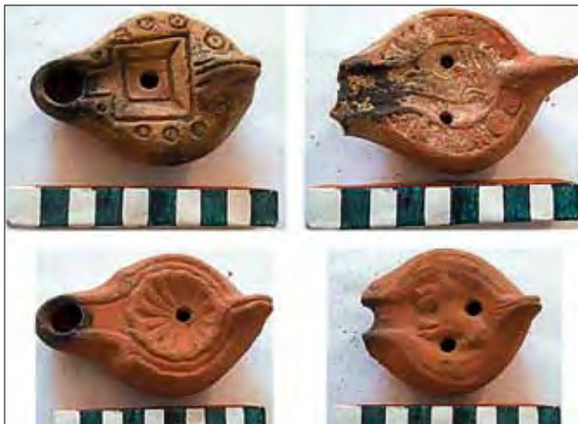
Fig. 1 Oil lamps discovered inside the catacombs (5th century)

The agreement between Italy and the Vatican (1984) attributed to the Ministry of Cultural Heritage the care and management of the Jewish catacombs in Italy. In 1988 the Archaeological Superintendency of Rome took over the management of the only complex in Rome to be owned publicly. The law 101 of 1989 established a joint commission with the Union of Italian Jewish Communities with the task of “determining the means for the Union to participate in