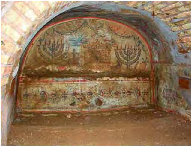
Fig. 3 Painted arcosolium with menorah and religious symbols