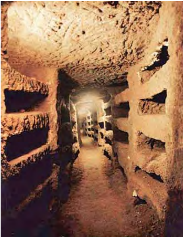
Fig. 4 Main passageway, open to the public

but had to limit intervention to essential security operations, due to the lack of funds.