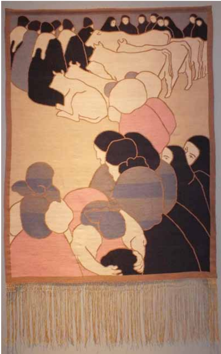
6 János Vaszary, The Fair tapestry, Budapest, 1908