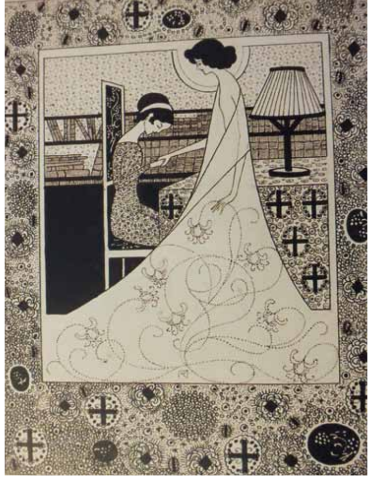
11 Mihály Rezső, The Blessing book illustration, Gödöllő, 1910