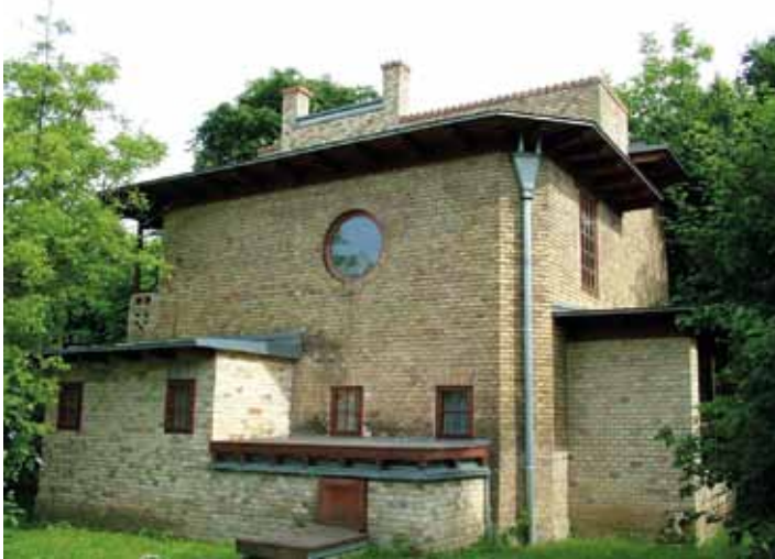
2 István Medgyaszay, Sándor Nagy House, Gödöllő, 1904–06 (status 2006)