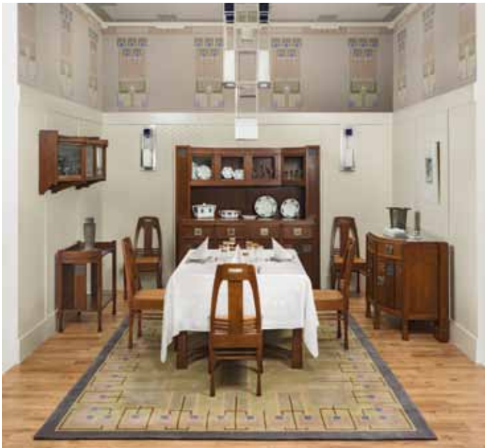
4 Peter Behrens, Wertheim, dining room, Darmstadt, 1901/02