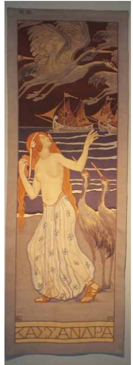
7 Aladár Kriesch-Körösfi, Cassandra tapestry, Budapest, 1908

facades and minimal decoration which was typical for his Mathildenhöhe houses. (Fig. 1, Ill. IX and X) In contrast, István Medgyaszay's two studio houses for Leo Belmonte and Sándor Nagy at Gödöllő (1904-06) appear much less sophisticated, although they are still quite radical in their design. The use of unplastered pale brick aids that perception. Medgyaszay was actually a pupil of Otto Wagner's in Vienna, which can be seen in the overhanging roof of the Sándor Nagy House. (Fig. 2) However, the construction of the porches and balconies in carved wood come straight out of the decorative features of traditional Transylvanian village building. (Fig. 3) So