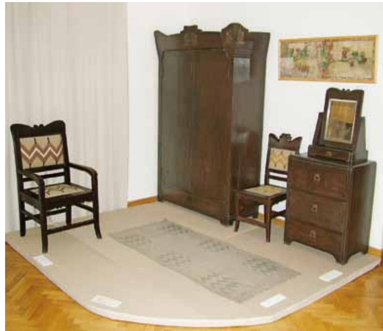
5 Aladár Kriesch-Körösfői, bedroom, Gödöllő, 1909

denhöhe Colony was intended as an exhibition itself, where interested buyers could come and see the complete range of works displayed and used in the houses of the artists, whereas the Gödöllő Colony never had such unity of either space or purpose. Table 4 gives an indication of the big differences in the infrastructure and organization of the two Colonies. The big push at Gödöllő was with the weaving studios, and tapestries were one of the major products of the Colony, whereas Darmstadt was much wider in what was set up, and also more commercially oriented.