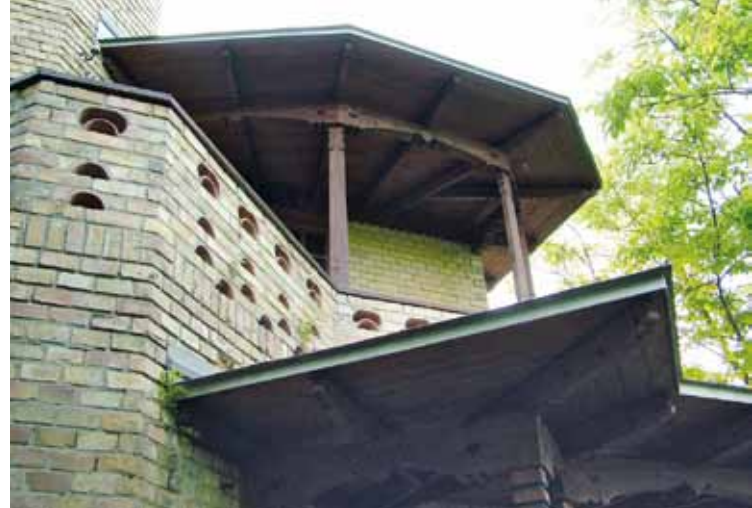
3 István Medgyaszay, Sándor Nagy House, porches and balconies, Gödöllő, 1904–06 (status 2006)