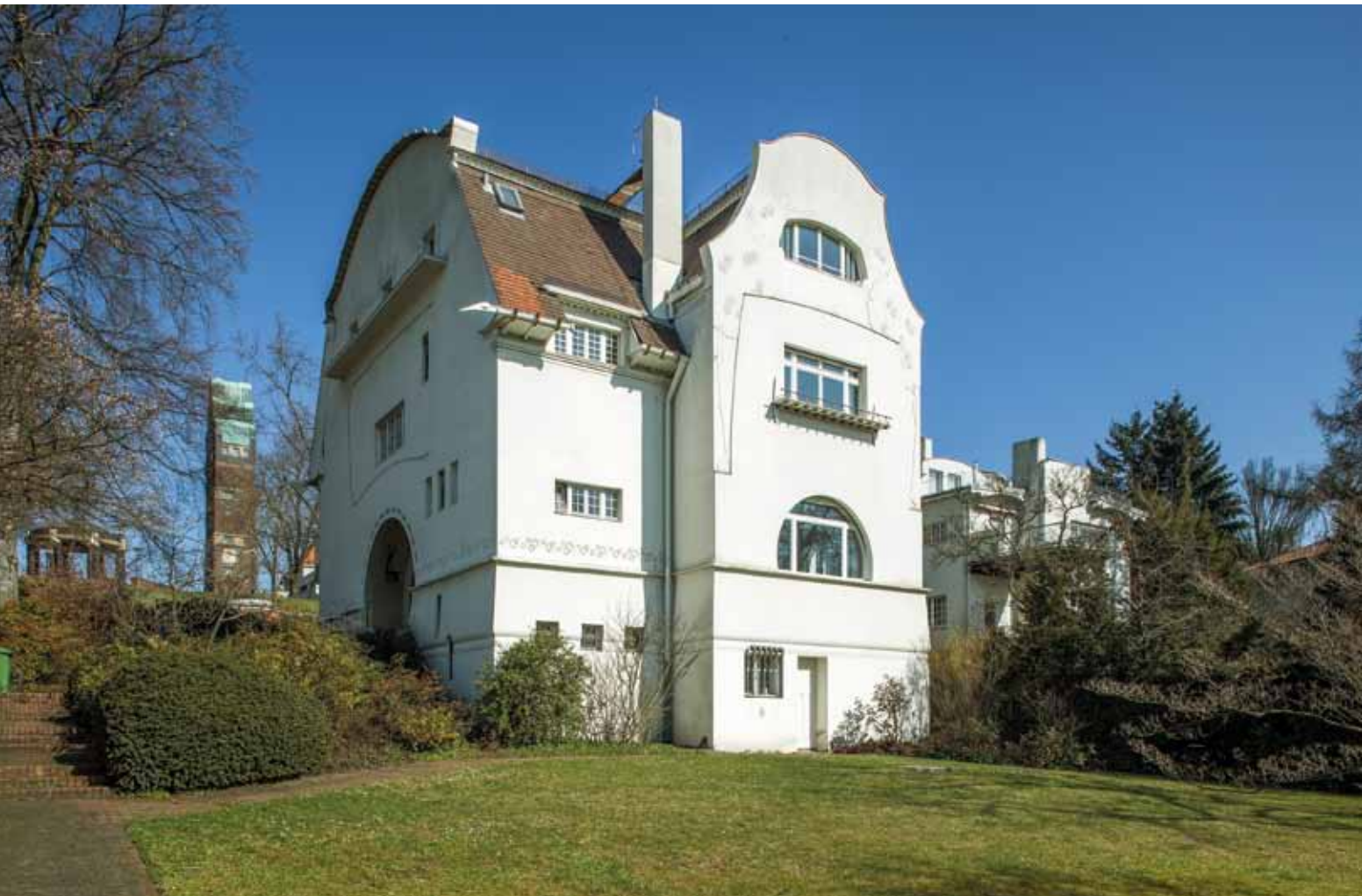
1 Joseph Maria Olbrich, Large Glückert House, Darmstadt, 1901 (status 2009)

grinding poverty of the feudal system that still operated in Hungary. However, they also aimed to use these folk elements in their own work, thereby creating a modern Hungarian style based on the country's design traditions. These aims were endorsed by the state, and so they received both moral and financial support from the Hungarian government to carry out their ideas.