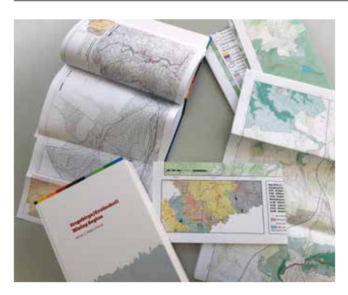
Fig. 5: Map volume, cultural landscape maps, World Heritage nomination file Erzgebirge/Krušnohoří Mining Region, submitted 2018

underground tunnel network, surface mining plants of different and complementary uses, and significant evidences of original machines and technical devices.