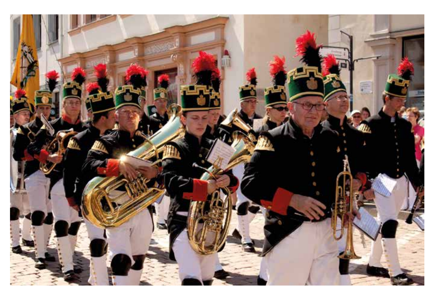
Fig. 6: Miner's parade in Freiberg

The category of cultural landscape, category (ii): organically evolved landscape, has been applied to the Erzgebirge/Krušnohoří Mining Region. When considering the further two sub-categories, <sup>12</sup> the Erzgebirge/Krušnohoří Mining Region is anchored as a substantially relict landscape but is also partly relevant as a continuing landscape in that parts of the