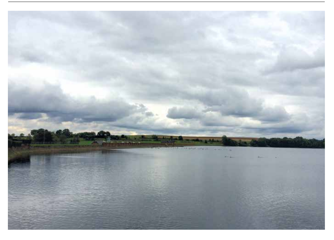
Fig. 7: Water management system, Großhartmannsdorfer pond, Freiberg mining landscape

landscape retain an active social role in contemporary society that is closely related to a traditional way of life and in which the evolutionary process is still in progress.