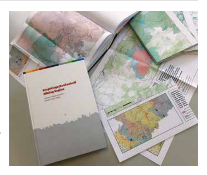
Fig. 4: Map volume, small-scale maps, World Heritage nomination file Erzgebirge/Krušnohoří Mining Region, submitted 2018

nated under criterion (iv) that in this case requires the illustration of "[...] significant stage(s) in human history". <sup>11</sup> The mining region is characterised by a range of successive and evolved socio-technical systems specified for several periods and different ore resources, and a series of cultural landscapes showing the development and function of these socio-technical systems by tangible mining heritage (Fig. 4).