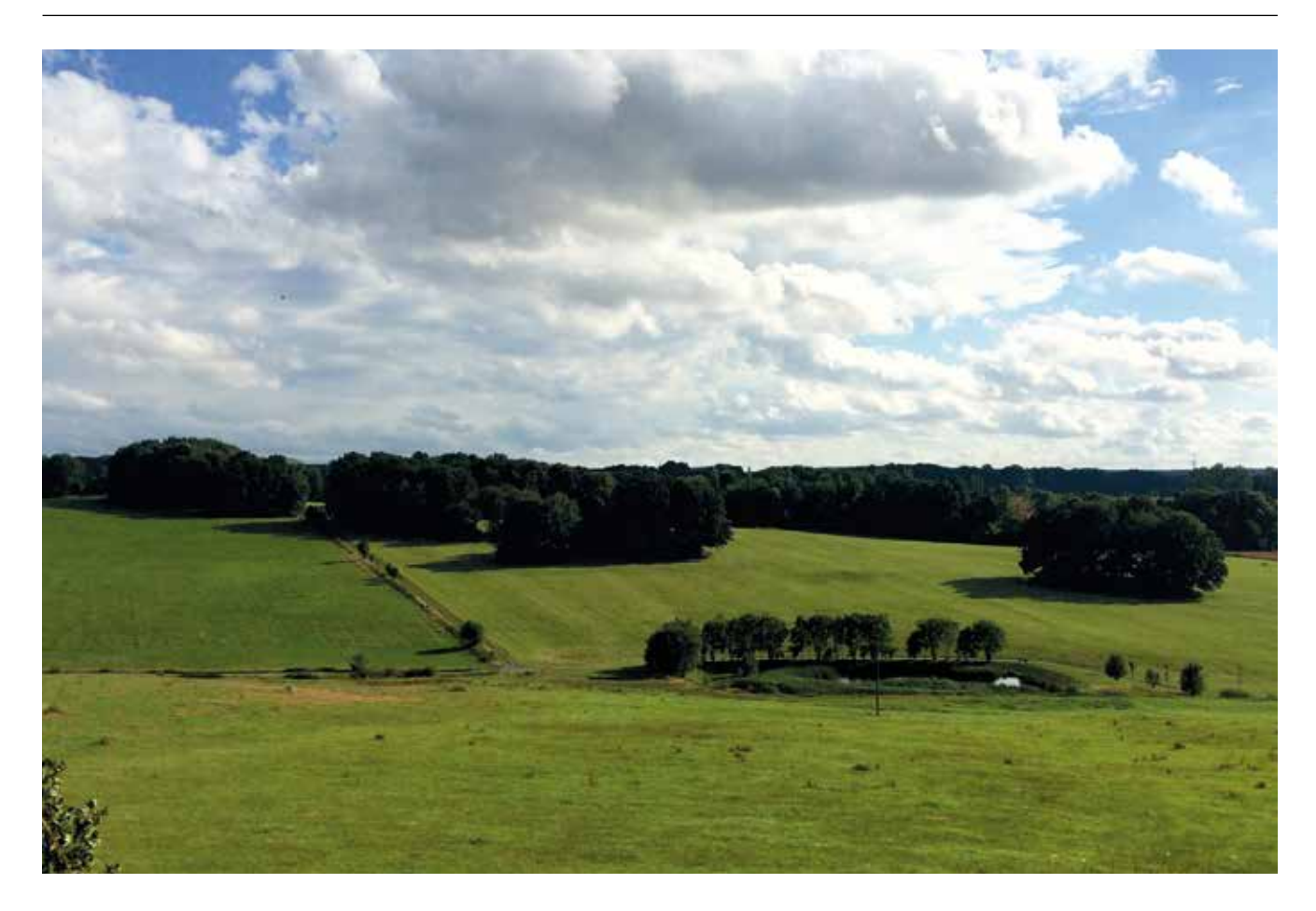
Fig. 1: Heaps landscape, Brand-Erbisdorf mining landscape

on the interaction between people and their environment. This interaction is tangibly manifested by mines and their innovative technological ensembles, mineral-processing infrastructure, water management systems, and mining towns.