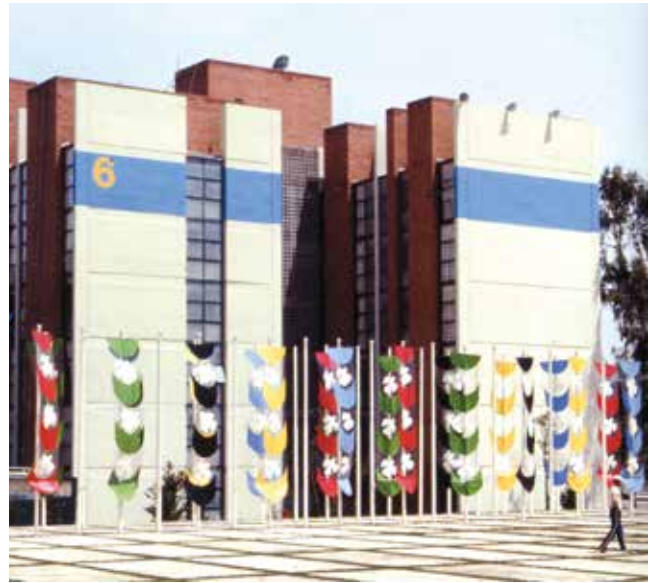
Fig. 10 The Olympic village

For several reasons, the Olympic Games meant new opportunities for experimentation for Mexican architecture, as new demands were made on the use of space in the buildings. Not only the large surfaces that had to be covered, but also the urban location in relation to the parking spaces and the new form of the buildings within the old city. The Sports Palace, the Velodrome and the Fencing Room were built in a long area that had the sports use specified by city planning, but the Olympic Village as well as the Swimming Pool and the Gymnasium were built in traditional quarters. In these 52 years, these buildings have been integrated into the city culture by their users with a different meaning. The Olympic Village, a cosmopolitan environment, stands for the playful experience for all people, and the Swimming Pool is the opportunity to be connected to a great sports experience day after day in one's own neighbourhood.