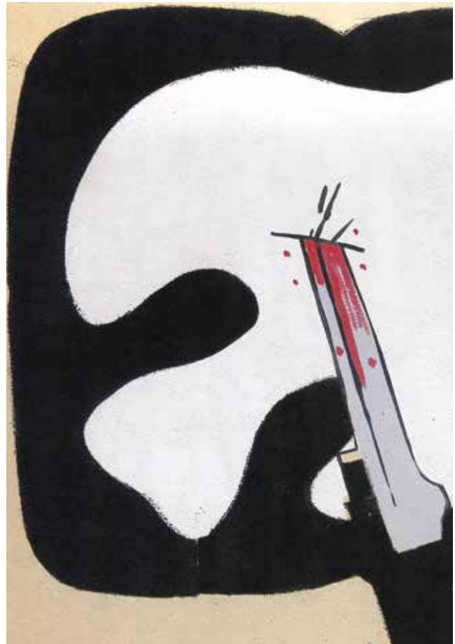
Fig. 1 Original Olympic design "The Olympics of Peace", with the stamp of the students' rebellion

The idea for the Olympic facilities that was proposed by the design team was not to have an Olympic park, but to transform Mexico City – the seat of the event – into a large Olympic stage. This meant not only to construct or adapt buildings for the sporting events, but to transform some parts of the city by setting up colourful graphic designs featuring all the activities of the Olympic celebration. My point of view is