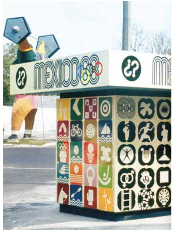
Fig. 2 Kiosk in the city with sports logotypes

I want to mention a particular modern heritage case that is facing a threat in the present: the Friendship Route of the Cultural Olympics that is in danger of completely disappearing as an urban and architectural heritage. This problem has to do with the dynamics of the modern city: changing the uses of the land, opening high-speed avenues and raising the value of urban land in the hands of the real state enterprises that have taken advantage of the disputes over owning the