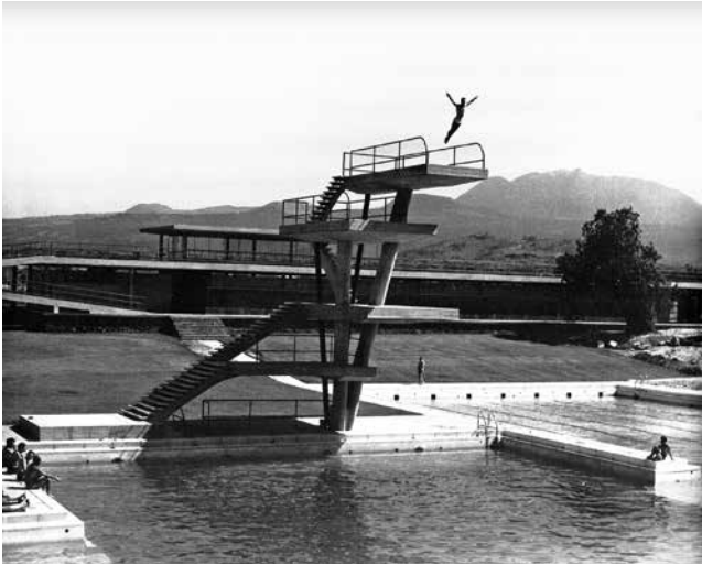
Fig. 8 The Olympic swimming pool at the university campus, for water polo competition

Due to the fact that the National University 10 is responsible for the National Observatory, the National Library, the National Collections of shells, birds and so on, it means that the university is responsible for some historic symbols that make the Mexican society proud. The University has constantly faced the history of Mexico, for example through the promotion of the fine arts, but also other fields like sports, or the free expression of young students against the status quo of some governments. All these matters were analysed and selected by the ICOMOS National Scientific Committee for 20th-Century Architecture when we decided in 2005 to start the effort of getting the campus on the World Heritage List. 11