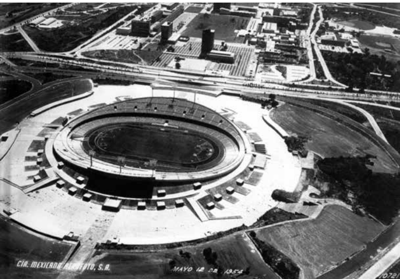
Fig. 6 The Olympic Stadium at the university campus