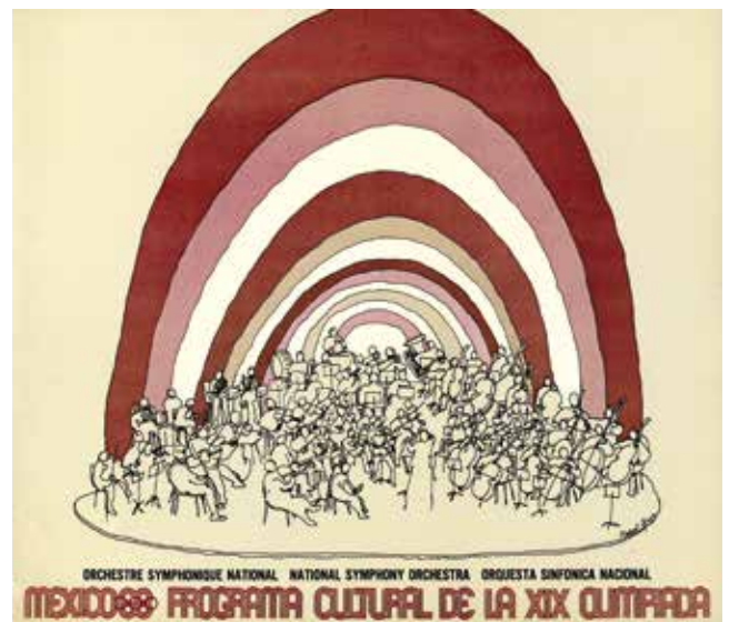
Fig. 3 “Cultural Olympic programme”, example of a leaflet, in this case for the national symphonic orchestra

best places to live. The example of the Friendship Route is the clearest; it was proposed by Mathias Goeritz to the Olympic Games committee, and the idea was to ask several countries for monumental sculptures that then could be installed on the banks of a new freeway on the southern border of the city. Many countries contributed with pieces and they were a great example of urban art related to a landscape