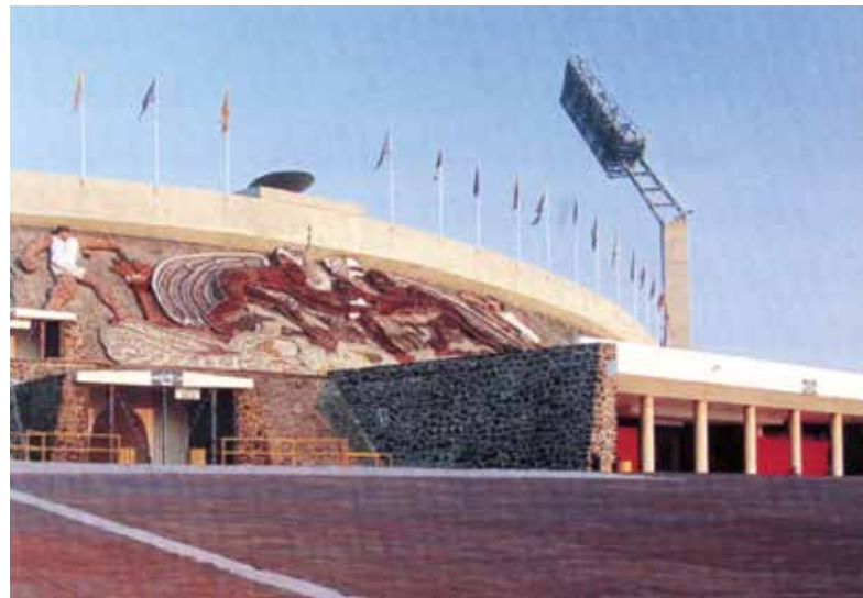
Fig. 7 The Olympic Stadium, main facade with stone mural by Diego Rivera

are: the Sports Palace, the Swimming Pool and Gymnasium buildings and the Olympic Village.