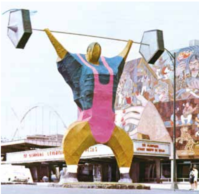
Fig. 5 Large ephemeral sculpture of papier mâché at the Insurgentes Theatre, the place for weightlifting

project. Unfortunately, the pieces themselves are not legally protected and under urban pressure around them. Some of the sculptures continue to stand on their original spot but the route as an artistic concept itself doesn't exist anymore (Fig. 5).