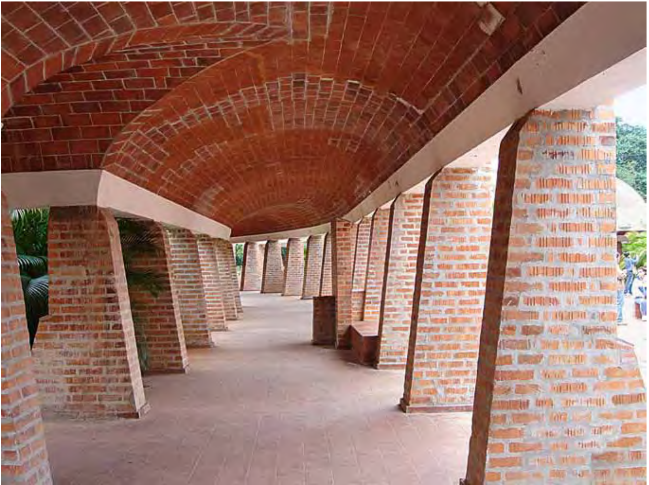
School of Plastic Arts (Ricardo Porro) Schule für Bildhauerkunst (Ricardo Porro)