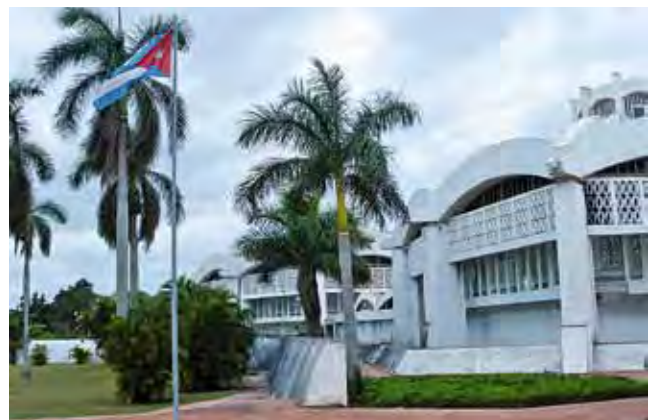
School of Modern Dance (Ricardo Porro) Schule für modernen Tanz (Ricardo Porro)

◁ The National School of Arts Cuba was constructed in Havana between 1961 and 1965, but not finished. The Arts School ensemble comprises five complexes: a School of Modern Dance (by Ricardo Porro), of Plastic Arts (Ricardo Porro), Dramatic Arts (Roberto Gottardi), Music (Vittorio Garatti) and of Ballet (Vittorio Garatti)