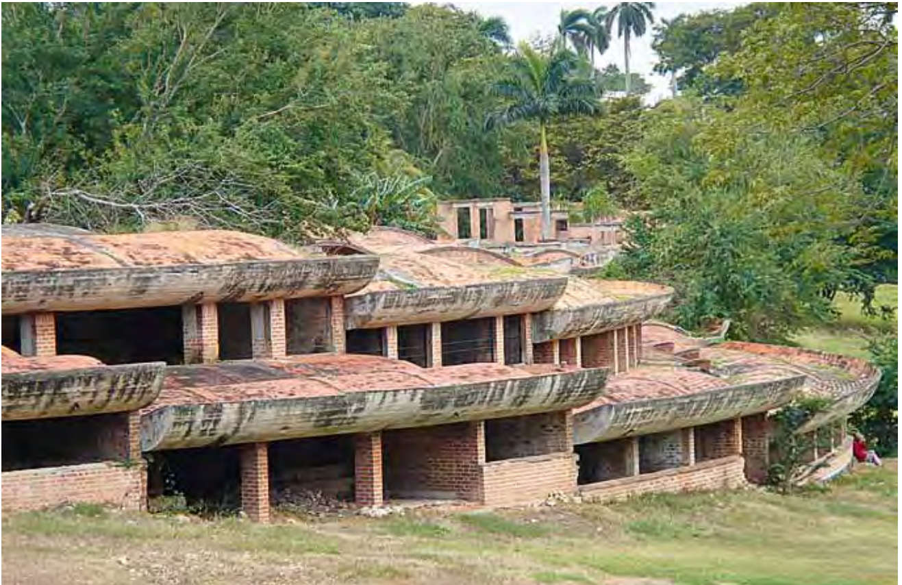
School of Music (Vittorio Garatti) Schule für Musik (Vittorio Garatti)