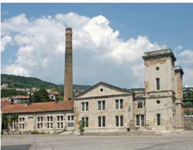
Figure 7: Trieste, Old Port, hydraulic power plant

The term Lagerhäuser has been used since the early plan stages and refers to the urban infrastructures dedicated to the loading, handling, storage and warehousing of goods in multi-storey lagers or hangars.