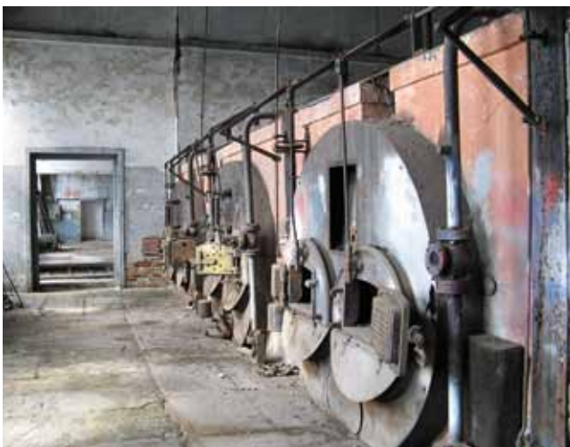
Figure 12: Trieste, Old Port, the boiler room