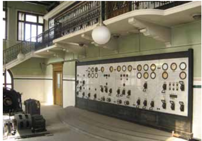
Figure 14: Trieste, Old Port, power plant

Durch den Bau des Hafens veränderte sich der Küstenverlauf, da in großem Umfang ausgebaggert und Land hinzugewonnen wurde.