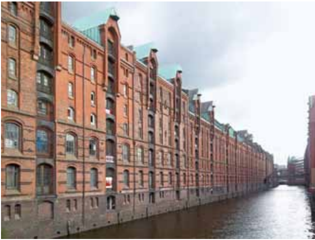
Figure 5: Hamburg, Speicherstadt