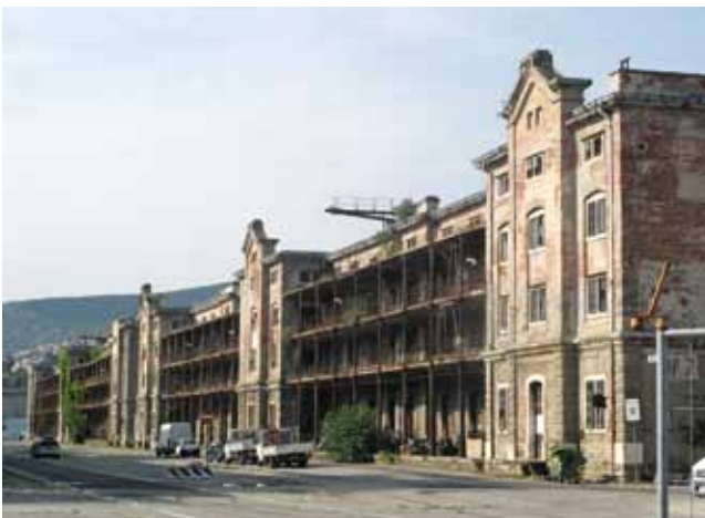
Figure 6: Trieste, Old Port, warehouse no. 7