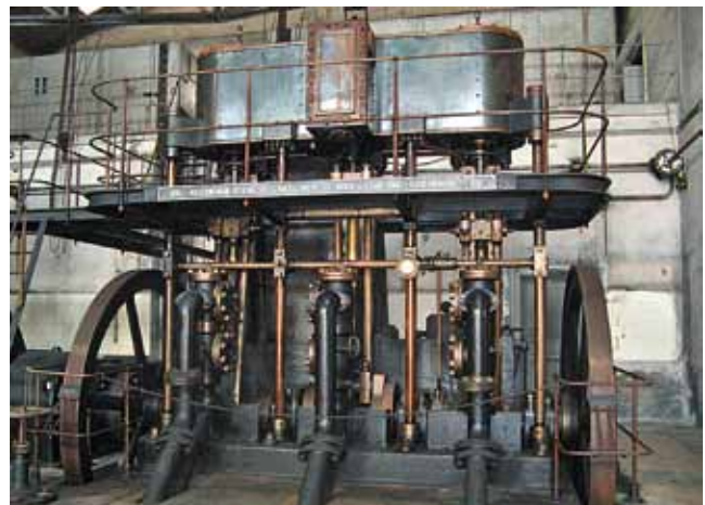
Figure 9: Trieste, Old Port, hydraulic power plant, (1890) machine Breitfeld & Danek – Karolinental – Prag