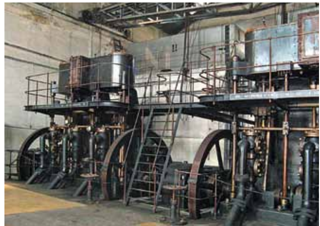
Figure 8: Trieste, Old Port, hydraulic power plant, machinery room

The distribution of geometric spaces, also on the plans, recalls the elements of Hamburg's Kesselhaus, that today serves as an information centre for the Speicherstadt.