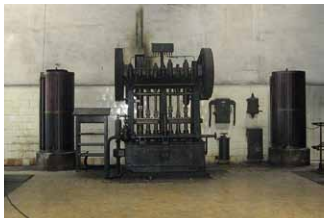
Figure 10: Trieste, Old Port, hydraulic power plant, (1890) auxiliary machine Breitfeld & Danek – Karolinental – Prag

During the construction of the hydrodynamic plant (between 1887 and 1890) setting work activities according to the destination, the size and the hierarchy of operations