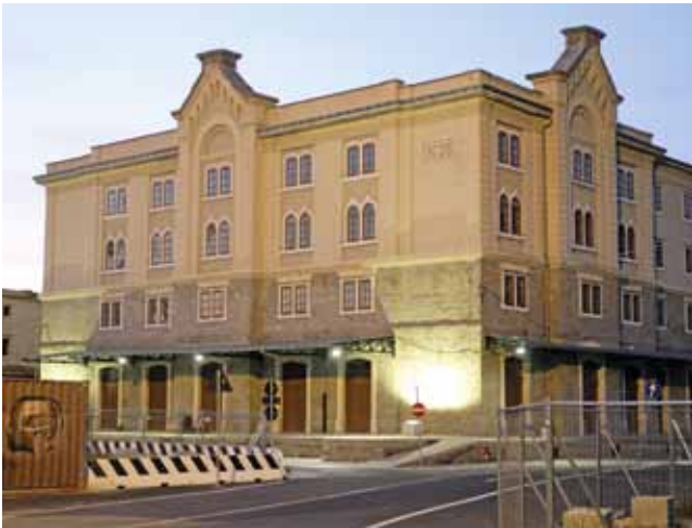
Figure 17: Trieste, Old Port, old warehouse no. 26 after restoration (2011)