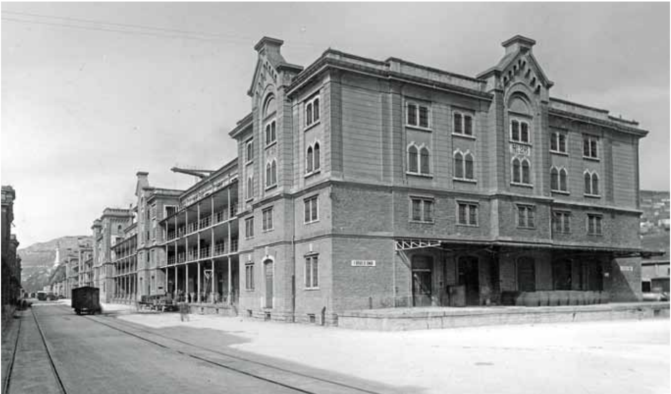
Figure 3: Trieste, Old Port, Warehouse no. 26

The Old Port, “Porto Vecchio” in Italian, is different from other ports of the Mediterranean area because it was built after the model of the Lagerhäuser, town districts designated as strategic areas for goods traffic in the Northern European ports, in particular the Hamburg Speicherstadt.