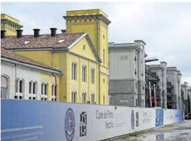
Figure 18: Trieste, Old Port, hydraulic power plant, works for restoration (2011)

Zusammenhang mit der traditionellen Bedeutung von Triest als Hafenstadt stehen. Sichtbare Zeugnisse des alten Hafengeländes existieren auch ohne gegenwärtige Nutzung fort: historische Lagerhäuser, Hangars, das Kesselhaus, Kaikräne, elektromechanisches Gerät und die alten Silospeicher mit ihrer charakteristischen Architektur.