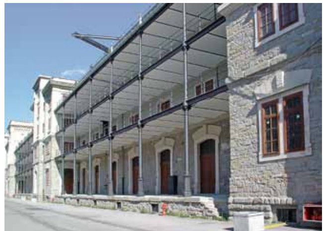
Figure 16: Trieste, Old Port, old warehouse no. 26 after restoration (2011)

Das ehemalige Hafengebiet und die Speicherstadt aus dem 19. Jahrhundert sind inzwischen vom Stadtzentrum umschlossen und haben ihre ursprüngliche Funktion für den gewerblichen Verkehr eingebüßt. Sie müssen sich deshalb für neue Nutzungen und Chancen öffnen, die im größeren