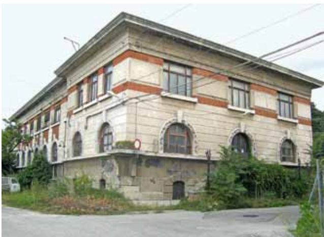
Figure 13: Trieste, Old Port, power plant

was necessary, providing at the same time a proper distribution of internal spaces.