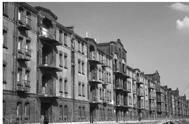
Figure 4: Bremen, Speicher XI

The spirit that governed the project, probably thanks to the contributions of Hamburg citizen Alexander von Schöeder, in its guidelines was the idea that the port was to be seen as a city district and, therefore, as a set of Lagerhäuser.