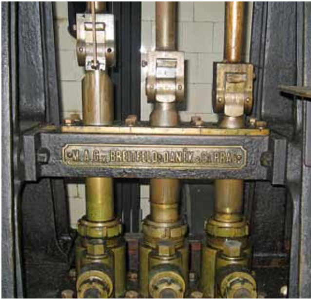
Figure 11: Trieste, Old Port, hydraulic power plant (1890), particular of auxiliary machine Breitfeld & Danek – Karolinenthal – Prag