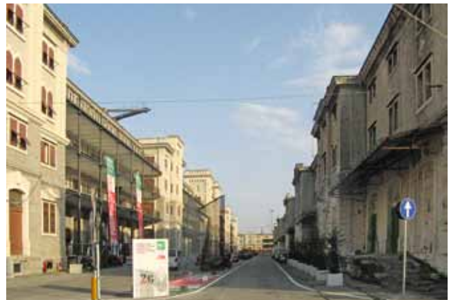
Figure 15: Trieste, Old Port, warehouse no. 26 after restoration (2011)