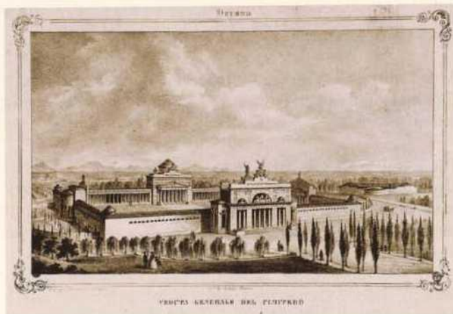
Fig. 2 Verona, Cemetery, general view, print, Milan 1849

regarded as some of the most positive outputs of a considerate and progressive administration. 2