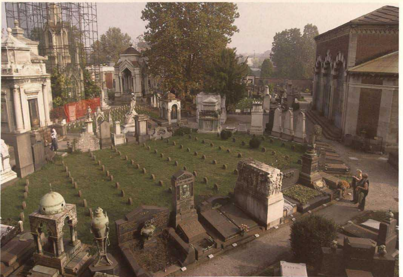
Fig. 14 Milan, Monumental Cemetery, Jewish section

Industrial proficiency and entrepreneurial skills were much praised in Milan; hence there are numerous memorials representing labour, professional emblems, working places. In the Jewish area the Treves memorial by sculptor Ettore Ximenes, dating from 1906, refers to the family's flourishing publishing activity, depicting its members surrounded by writers, painters and intellectuals and also recording in highly accurate details