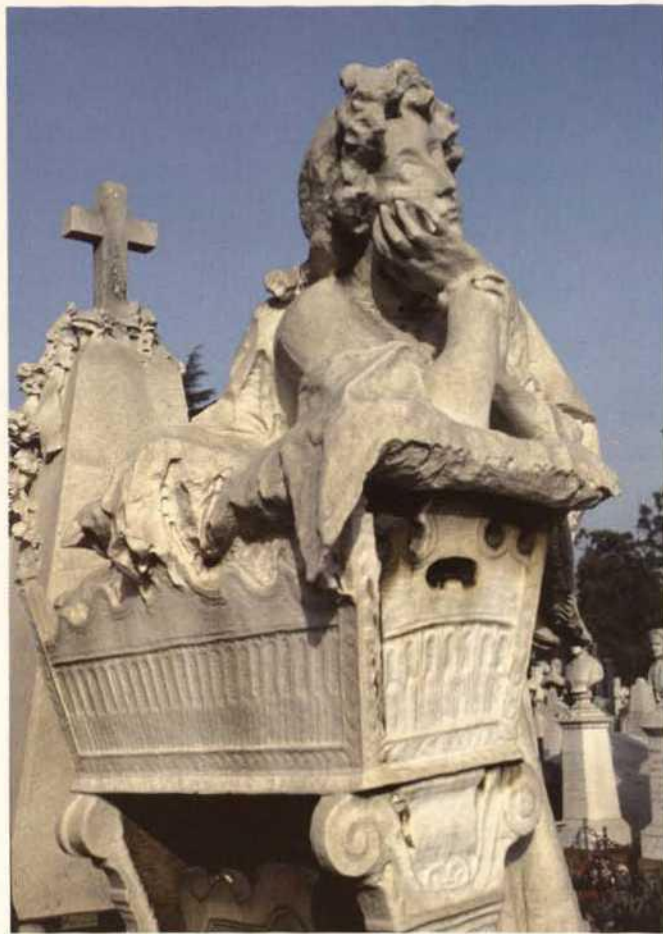
Fig. 15 Milan, Monumental Cemetery, memorial to Emilio Rigamonti, 1890, sculptor Ernesto Bazzaro

the modern photomechanical process for picture reproduction, a technique in which the Treves led the field 17 (fig. 10).