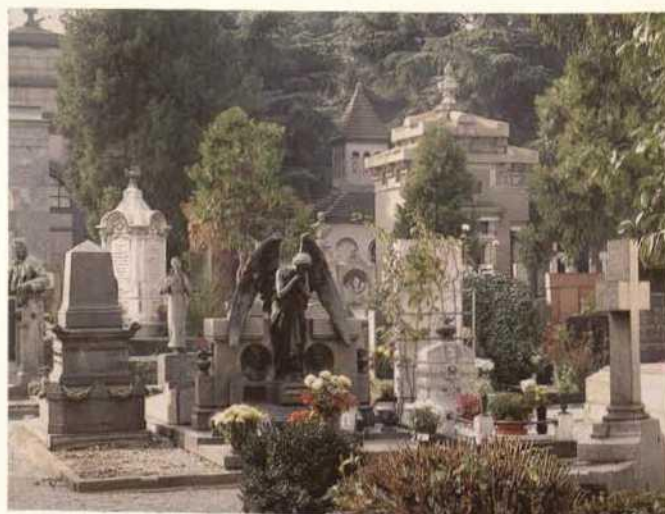
Fig. 17 Milan, Monumental Cemetery, general view

No less significant are those monuments that eschew representation of an event, a personage, or an emotion, assuming instead the form of a family chapel. Called "aediculae" (from Latin "small house") they are directly tied to the ancient tradition of the burial place as the last "home" where all the family members are gathered (fig. 16). "Aediculae" are particularly numerous at the Monumentale and had been foreseen from the beginning, representing not only an interesting design challenge to architects, but also a consistent income opportunity for the municipality which could lease the necessary building parcels in the cemetery at high prices. The most prominent architects designed "aediculae" and the most affluent families chose to be