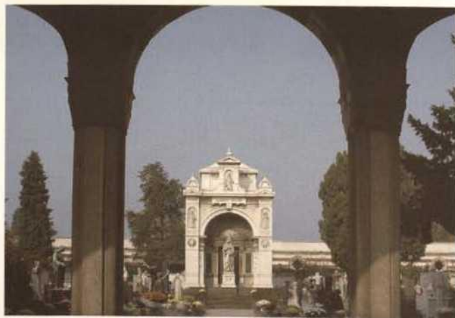
Fig 7 Milan, Monumental Cemetery. “Non-Catholic” section, in the background the memorial to Alberto Keller, promoter of the Crematorium Temple

men operating in Milan. Moreover this solution encouraged a taste for variety that met with the gradual onset of a sense of the individual or, better said, of an awareness of identity which had provoked a growing request for personal remembrance. In Milan, as elsewhere, people had come to regard funerary monuments as a way to establish, whether openly or not, significant bonds with their life histories: therefore as a means for self-representation and for communicating identities shaped according to personal preference and/or according to specific social rules.