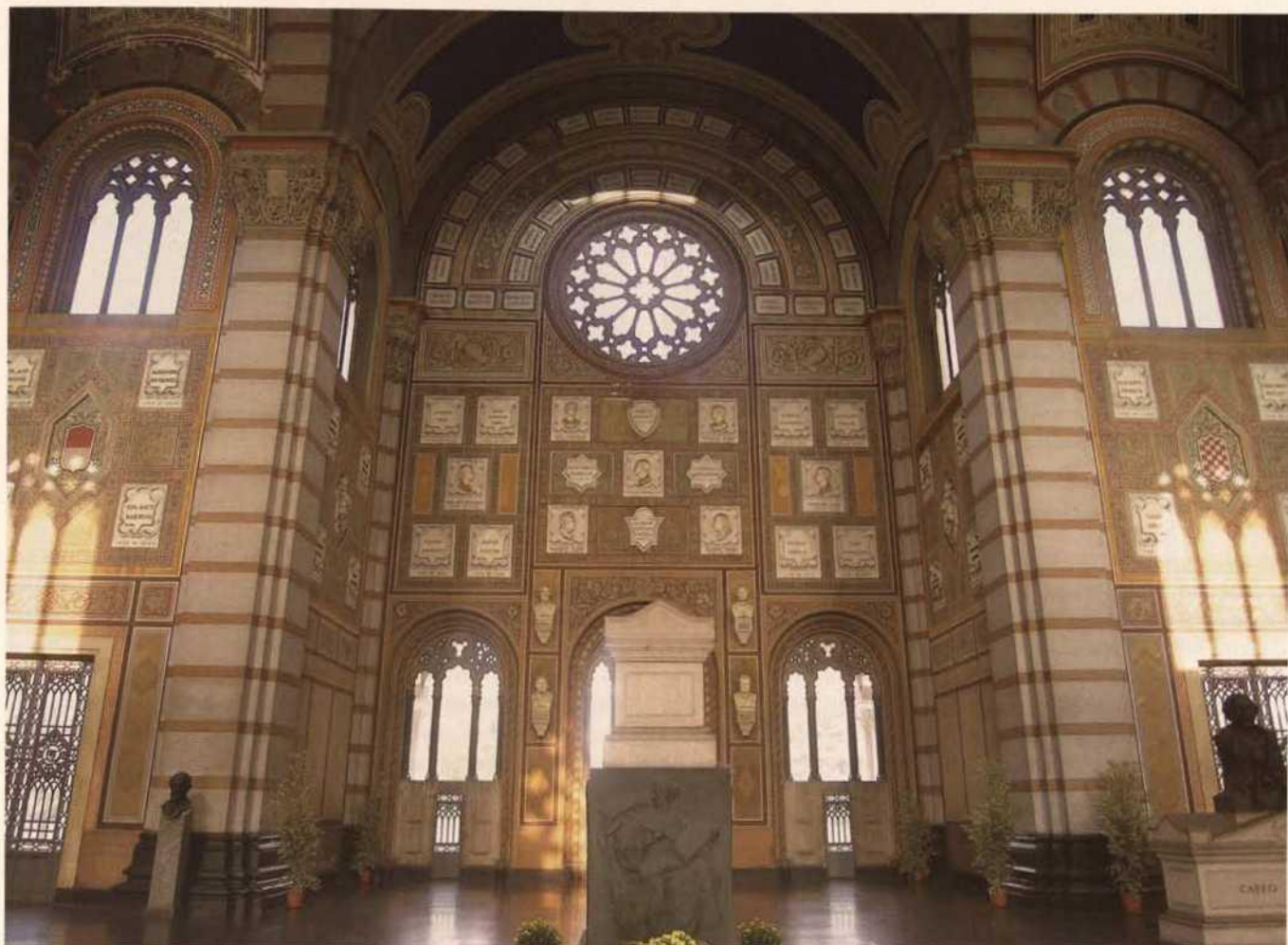
Fig. 6 Milan, Monumental Cemetery, interior of the Famedio

tion of the flesh”, the Crematorium was opened in 1876 and was equipped with advanced technical devices, gaining the reputation of being the first one in Europe operating in a public cemetery on a modern basis.