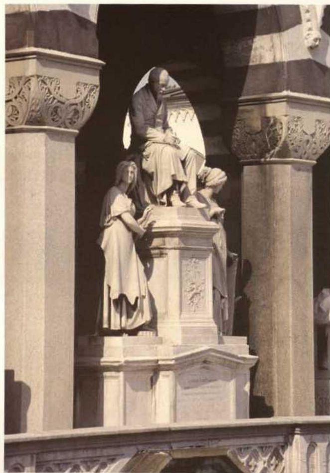
Fig. 9 Milan, Monumental Cemetery, memorial to Giulio Sarti, 1870, sculptor Giovanni Strazza

In the same years that the squares of Italy were being filled with monuments to the heroes of the Wars of Independence, to