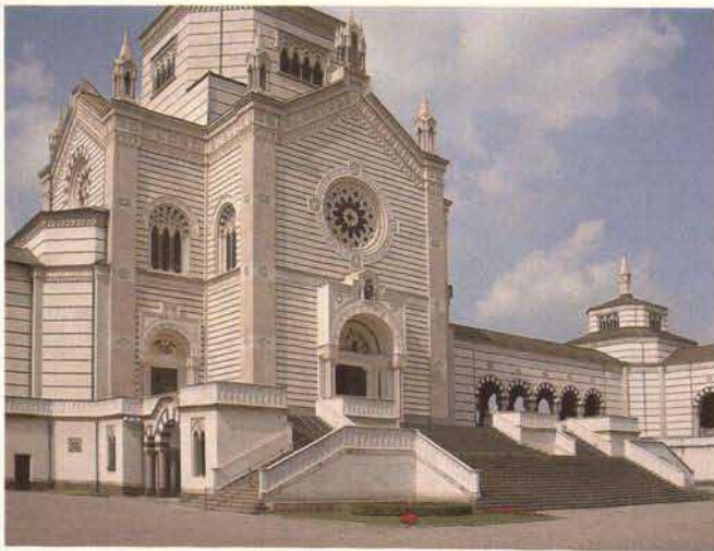
Fig. 5 Milan, Monumental Cemetery, the Famedio

result is rather peculiar, establishing a very “pagan temple”, as far as its significance is concerned, however devoid of any classical stylistic reference: establishing a place for secular worshiping where the Middle Ages are highlighted by employing many decorative patterns coming from Romanesque and Gothic church architecture, combining Pisa with Ravenna, Milan with Byzantium, carved stones with smooth bands of marbles, twisted columns with sculpted capitals, rose windows with mosaics. Laden with symbolism, the Famedio celebrates memory as the reward of great lives, placing the statue of Glory on top of the main entrance, and depicting the lunettes above the side doors with History writing meritorious names (“ Marcat nomen sicut monumentum ”); with shining Glow (“ Flamma flammae lux lucis ”) and with Fame that never wanes, not even in the silence of Death (“ Mutae mortis magna vox ”).