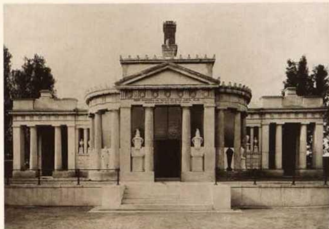
Fig. 8 Milan, Monumental Cemetery, Crematorium Temple, photograph from the end of the 19th century

The Monumentale widely reflects this phenomenon, portraying all sorts of iconographical themes, of artistic fashions, of cultural categories and, also, displaying the entire range of social classes, at least until 1895 when the opening of a new bigger cemetery (called "Musocco") restricted the Monumentale to the richest and longer lasting tombs. 14 Many of them can be considered greatly representative of the idea of memorials as conveyors of identity values.