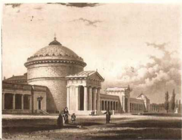
Fig. 1 Brescia, Cemetery, view of the front entrance, print by Artaria, Milan 1840

Such phenomenon acquired a special meaning in nineteenth-century Italy, a country that was almost totally dominated by foreign regimes and where the institution of city graveyards was soon to be perceived not only as part of modern hygienic facilities, but also as an opportunity to convey autonomous cultural values. This partly explains the extraordinary flourishing of new cemeteries from the very first decades of the century; among them one can mention the cities of Bologna, Brescia (fig. 1), Verona (fig. 2), Genoa, Torino, Naples, Rome, as well as several smaller towns like Modena, Como or Cremona; all of them truly engaged in building very distinctive structures that, although very costly, were greatly favoured by the citizens and came to be