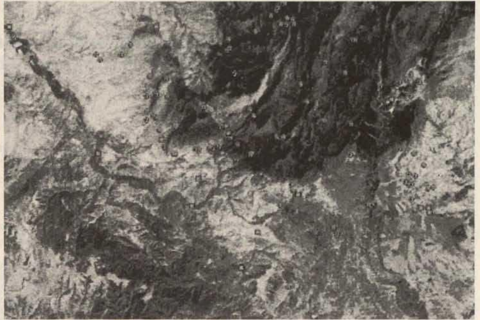
Fig. 2. Relation between water sources, rivers and archaeological sites