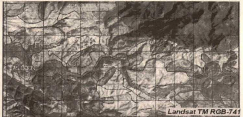
Fig. 4. Definition of Landscape units based on information provided by the Landsat image