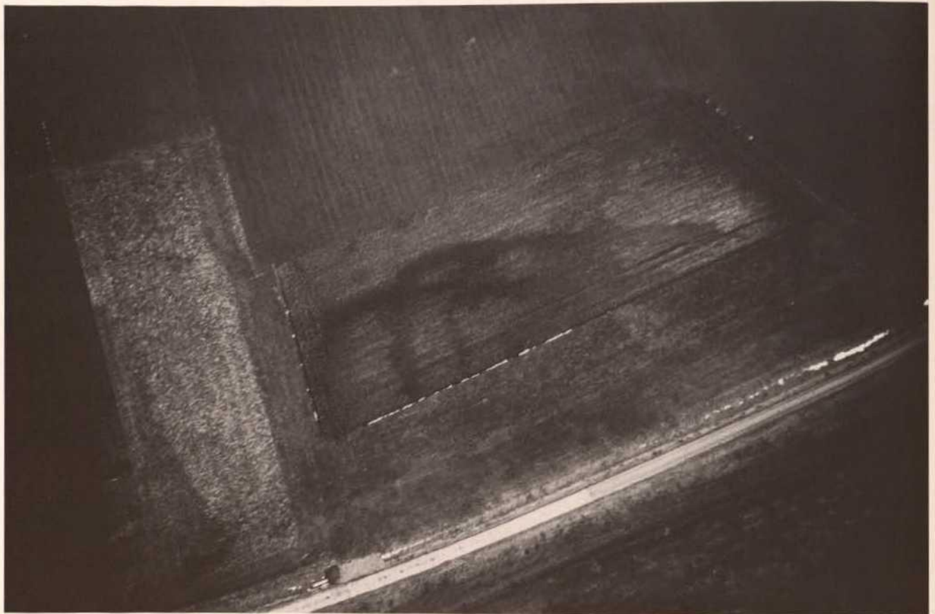
Fig. 1. Galgenberg-Kopfham; aerialphoto of soilmarks of a ditch system after first ploughing at the Galgenberg near Kopfham, Lower Bavaria (Photograph O. Braasch from 04.01.81, Archivnr. 7538/040; SW229-16)